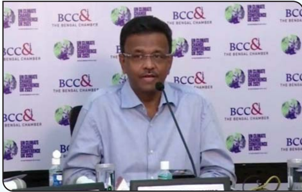
Janab Firhad Hakim, Hon'ble Minister-in-Charge, Department of Transport, Government of West Bengal; Chairman, Board of Administrators, Kolkata Municipal Corporation and Chairman, WBHIDCO Limited

There were audiences both at the Chamber in Kolkata and in Glasgow. This apart the programme was streamed online.