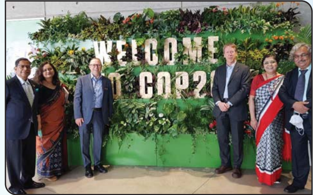
The Bengal Chamber Delegation at COP26 in Glasgow