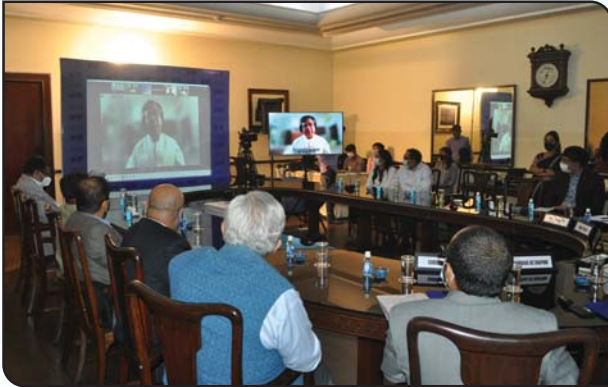
Audience at The Chamber

10th November 2021, Green Zone of COP26 in Glasgow, UK. and Kolkata Leadership at the Chamber Premises