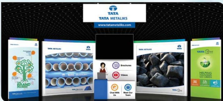
Tata Metaliks E-Kiosk