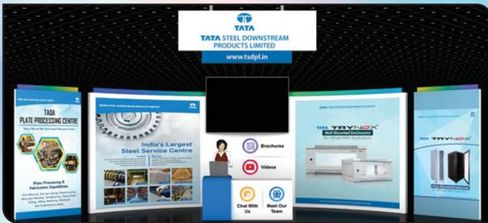
Tata Steel Downstream Products Limited E-Kiosk