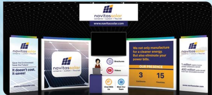
Navitas Solar E-Kiosk