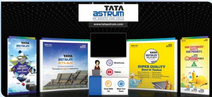
Tata Astrum E-Kiosk