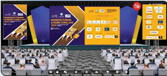
Main Conclave Hall

MANUFACTURING & MSME CONCLAVE AND MSME EXCELLENCE AWARDS 2021