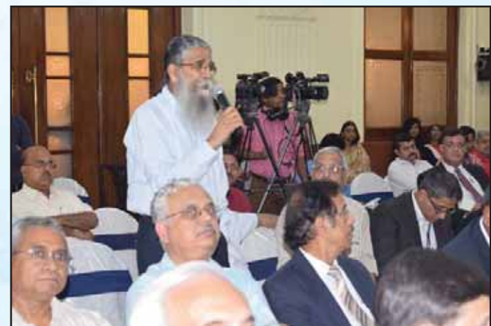
Q/A session in progress.