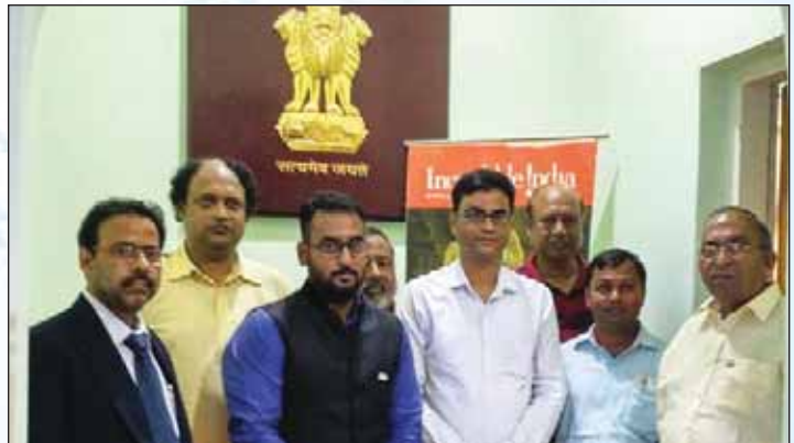
At Indian Consulate General office in Mandalay, Myanmar