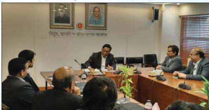
Meeting of The Bengal Chamber Delegation with Janab Nasrul Hamid, Hon'ble State Minister, Power Division-Ministry of Power Energy & Mineral Resources