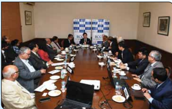
Participants at the Roundtable meet