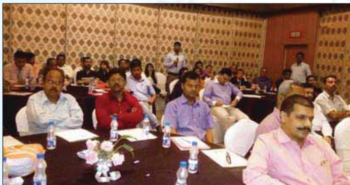
Q/A Session in progress