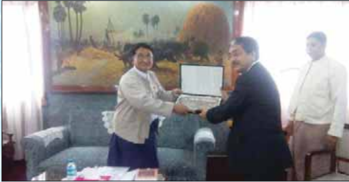
Meeting with His Excellency Dr. Than Myint, Union Minister, Ministry of Commerce, The Republic of the Union of Myanmar, Yangon, Myanmar