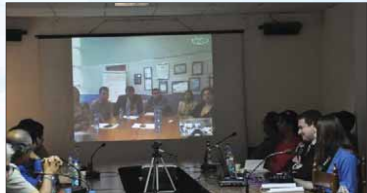
During the Video Conference