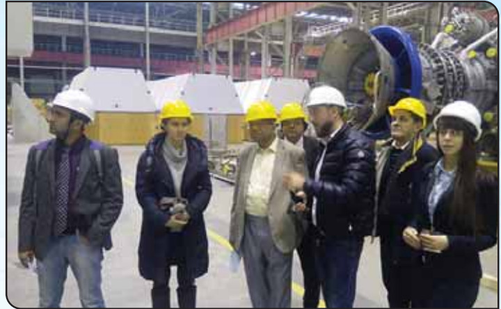
The visit of the plant in progress.