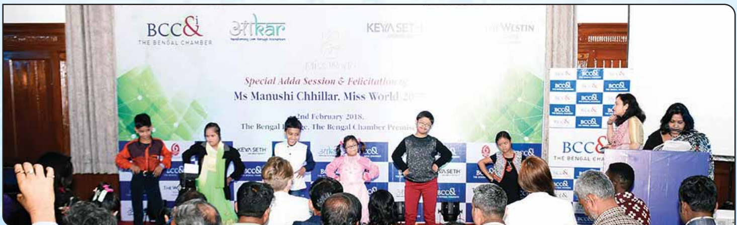
Performance by students from APT Centre