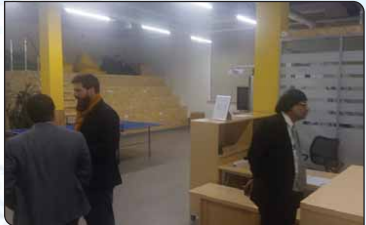
The visit of the delegates to INGRIA, business incubators of Saint – Petersburg, Russia.