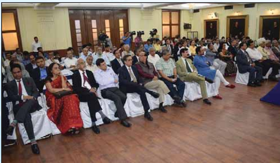
A section of the audience.