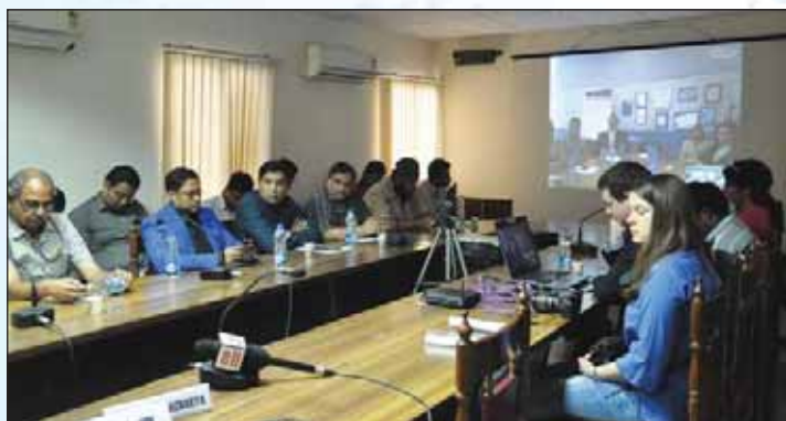
Video Conference in progress

The Russian representatives discussed about various products from the Russian side focusing on analytics, biotechnology applications, wound dressing, molecular biotechnology products which are less expensive and have huge customer and distributor support system. The conference acted as a precursor to the Chamber’s upcoming business delegation to Russia later this year.