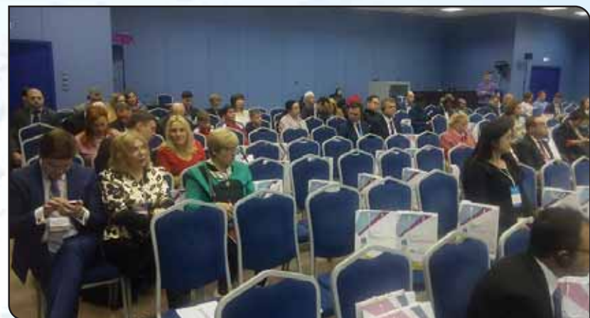
The delegates present at the press conference.