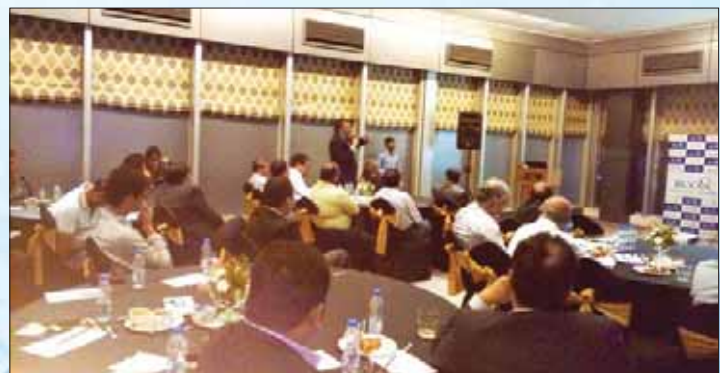
Q/A Session in progress