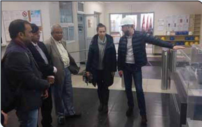
The visit of the delegates to the Museum of REP Holding, Nevskiy plant.