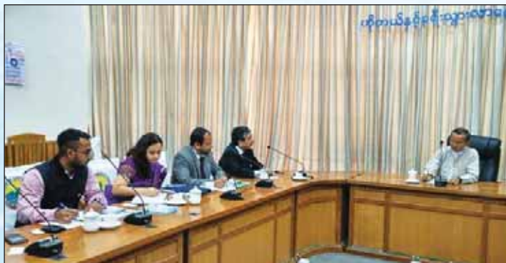
Meeting with His Excellency, U Ohn Maung, Hon'ble Minister of Hotels and Tourism, The Republic of the Union of Myanmar, Nay Pyi Taw, Myanmar