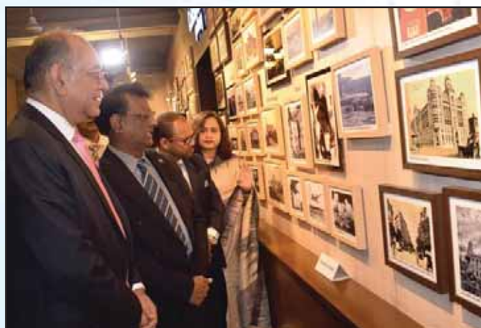
H.E. Mr. Paramasivum Pillay Vyapoory, Hon'ble Vice President, Republic of Mauritius walking through The Calcutta Gallery.