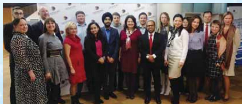
Chamber representatives at Institute for Emerging Market Studies (IEMS), Moscow School of Management SKOLKOVO