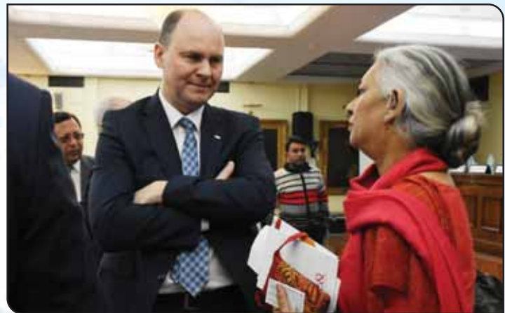
B2B Networking in progress