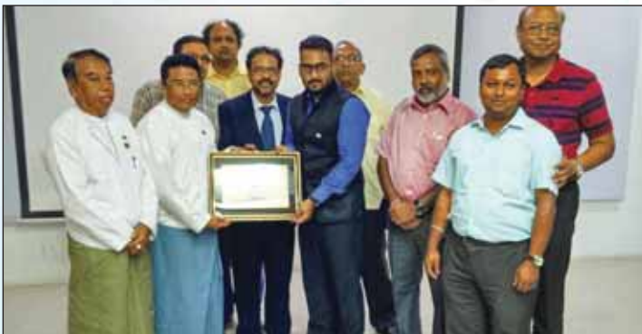
Meeting with business entrepreneurs/companies at Mandalay Regional Chamber of Commerce and Industries, Mandalay, Myanmar