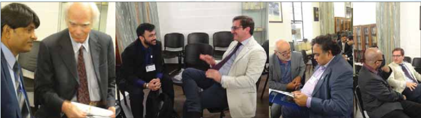
B2B Meetings in progress at Embassy of India in Rome