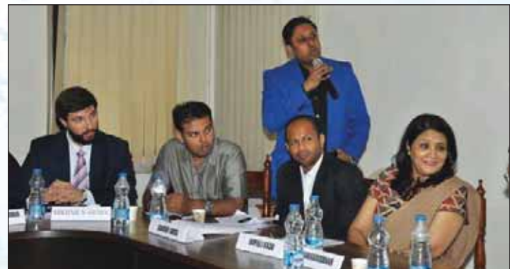
Members interacting with the Russian counterparts