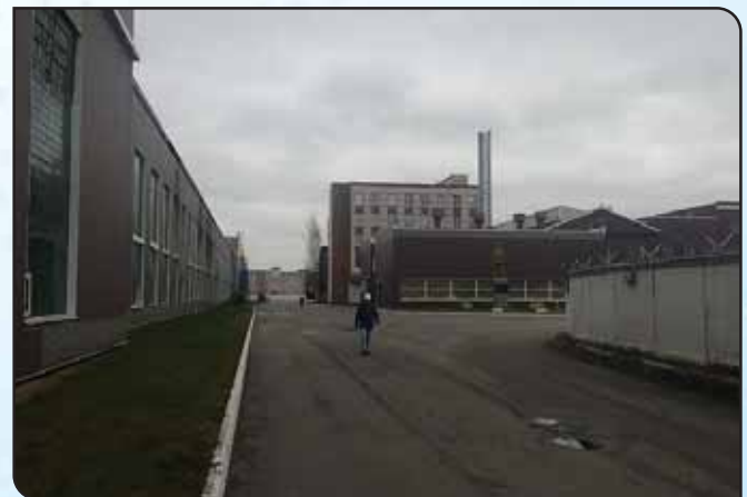
The snapshot of the REP Holding, Nevskiy plant.