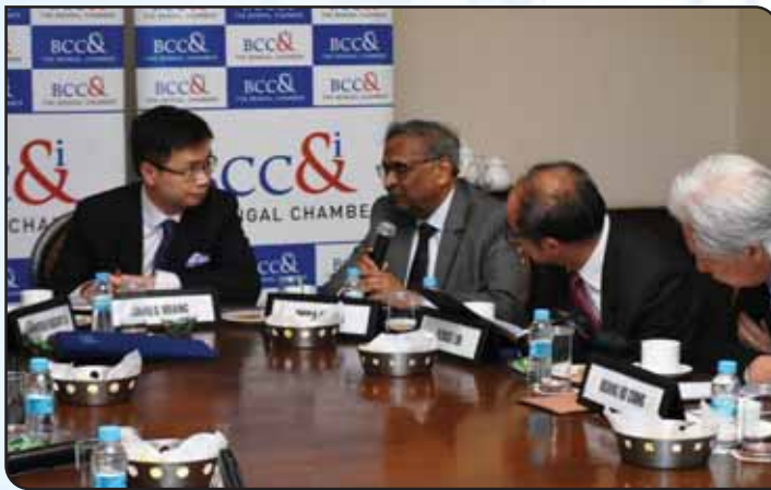
Interaction in progress