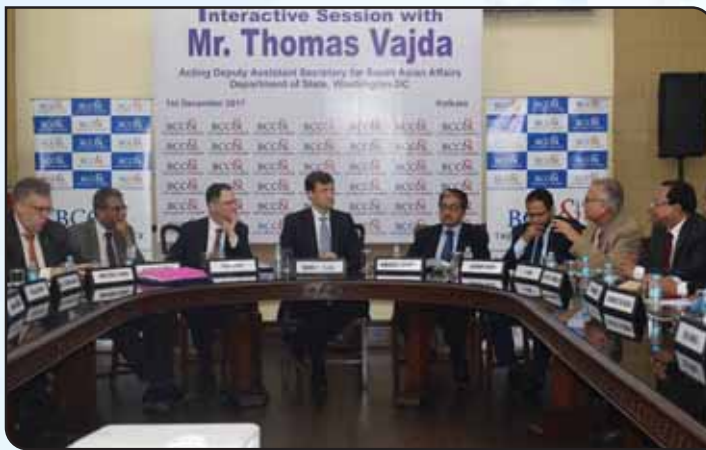
Interaction in progress.