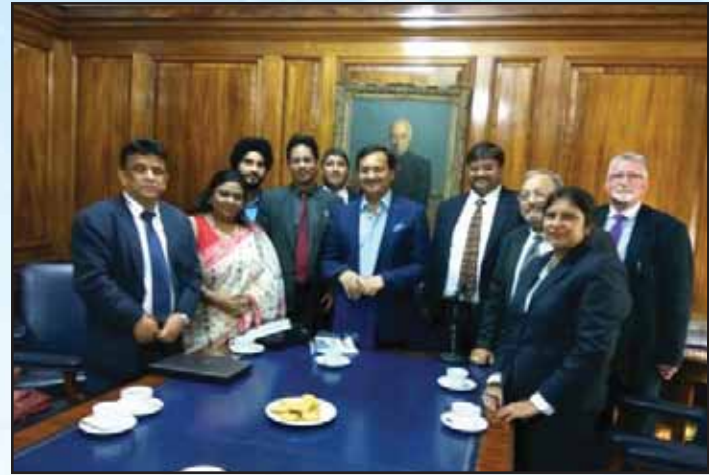
Delegation with the Ambassador Dinesh Patnaik, Deputy High Commissioner of India at High Commission of India, India House, London, The United Kingdom.

The visit concluded on 13th July 2017. The delegation marked the beginning of the international educational tie-ups facilitated by the Chamber and was appreciated by the members comprising the delegation.