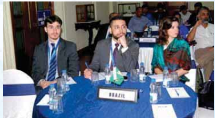
The visiting Diplomats.