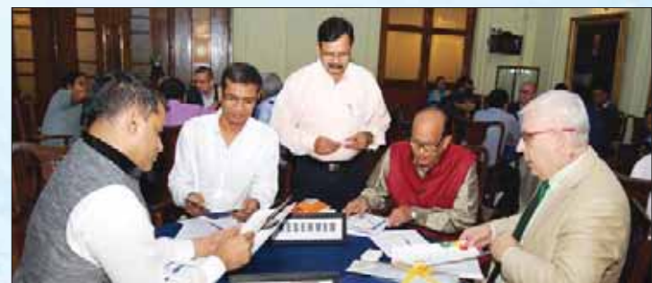
B2B interaction in progress