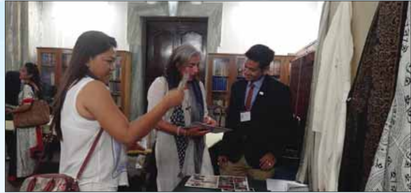
B2B Meetings in progress at Embassy of India in Rome