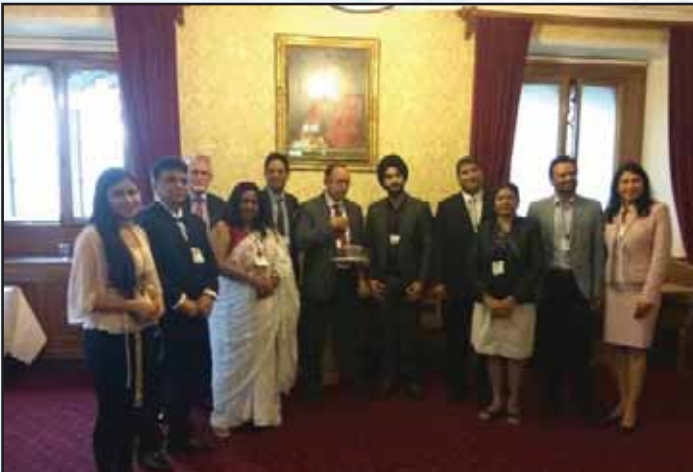
Meeting with Lord Nick Bourne at the House of Lords.