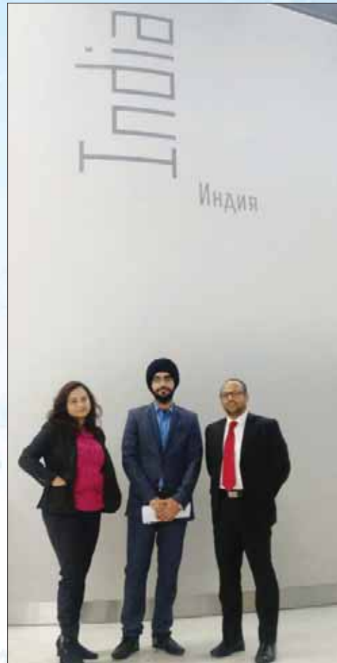
Chamber representatives at Institute for Emerging Market Studies (IEMS), Moscow School of Management SKOLKOVO