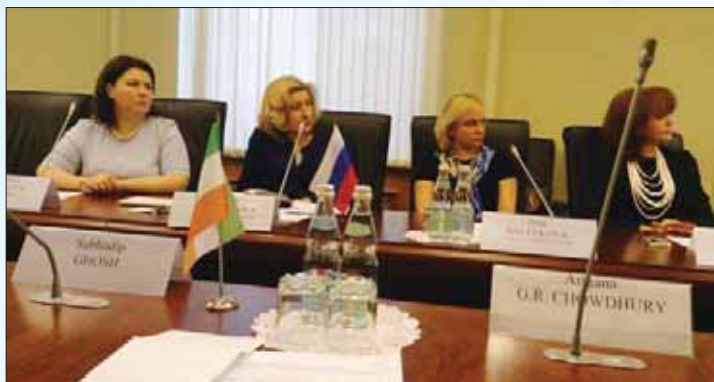
Meeting in progress with Ministry of Economic Development of The Russian Federation