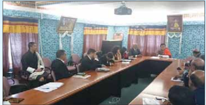
Meeting with His Excellency Lyonpo Norbu Wangchuk, Hon'ble Minister of Economic Affairs, Royal Government of Bhutan