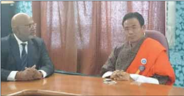
Meeting with His Excellency Lyonpo Norbu Wangchuk, Hon'ble Minister of Economic Affairs, Royal Government of Bhutan