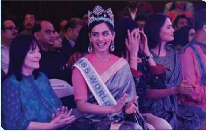
Ms. Manushi Chhillar, Miss World 2017 along with her team enjoying the performance of the students from APT Centre.