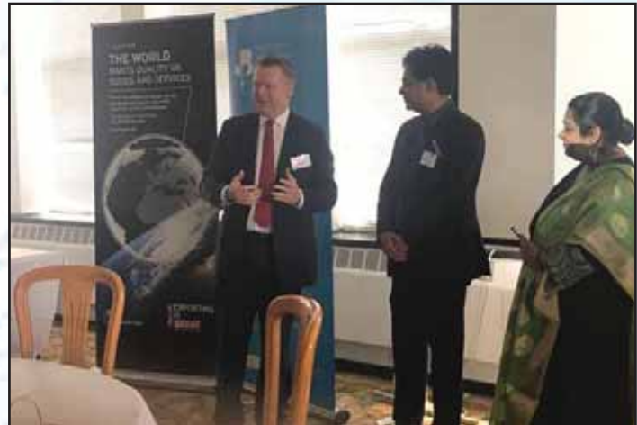
Visit to Greater Birmingham Chamber of Commerce.