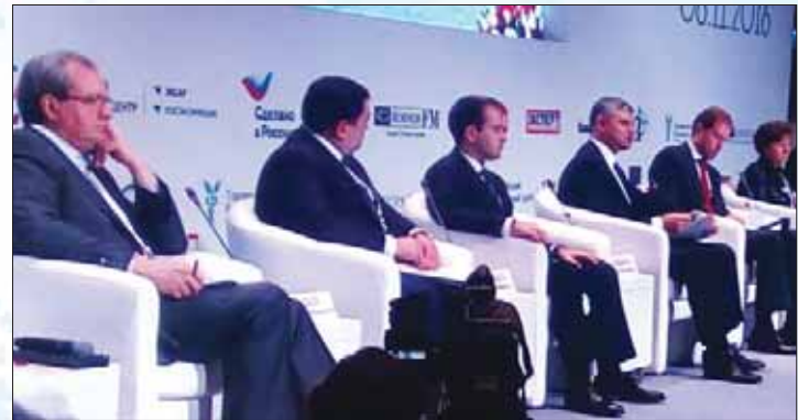
Plenary Session of The International Export Forum – “Made in Russia”, organized by Russian Export Center at World Trade Center, Moscow