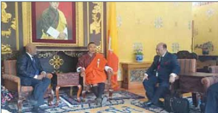
Meeting with His Excellency Tshering Tobgay, Hon'ble Prime Minister of Bhutan