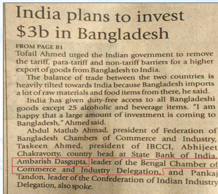
The BCC&I Delegation, found good coverage in Bangladeshi media