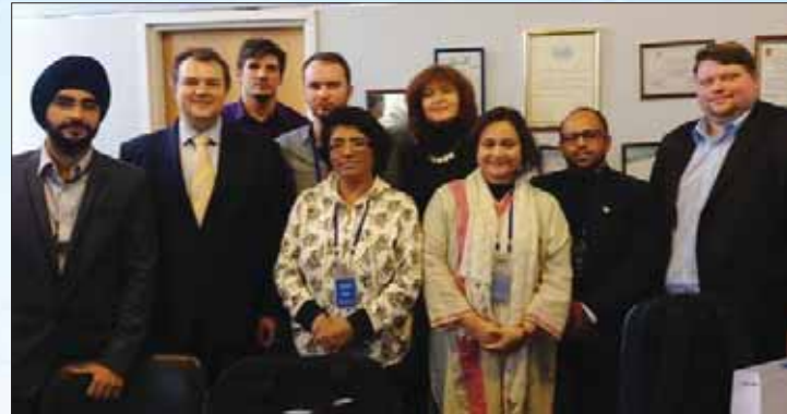
At Moscow State University Science Park

The Bengal Chamber of Commerce and Industry separately proposed an institutional partnership with the Science Park. The Chamber requested the Science Park to share their updates on various innovations taking place in their eco-system which the Chamber will circulate among their members and stakeholders for match making.