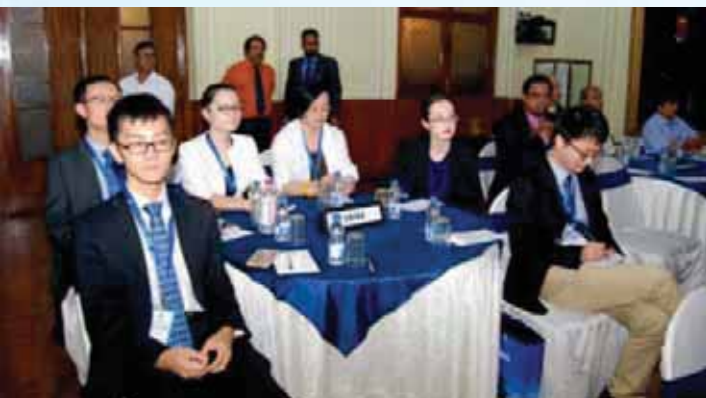
The visiting Diplomats.