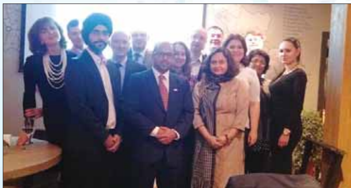
Meeting with Ulyanovsk Region