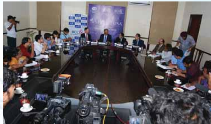
Press Conference in progress.