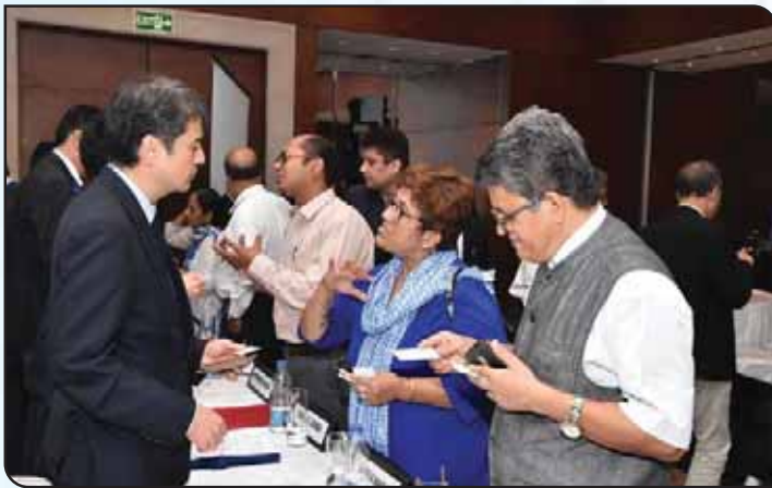
B2B Interaction in progress.