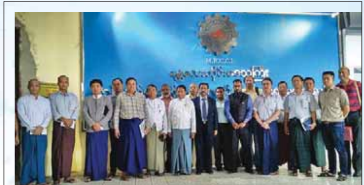
Meeting with business entrepreneurs/companies at Mandalay Regional Chamber of Commerce and Industries (MRCCI), Mandalay, Myanmar