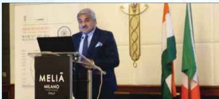
Ambassador Anil Wadhwa, Embassy of India in Rome addressing the Seminar on 'Indian Opportunities for Italian Companies'

The concluding day, 19th July 2016, was utilized for follow up and additional B2B Meetings.