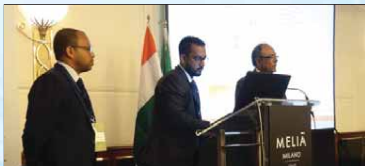
Introduction of Delegates