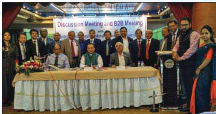
The members of BCC&I Delegation with the President and other members of FBCCI