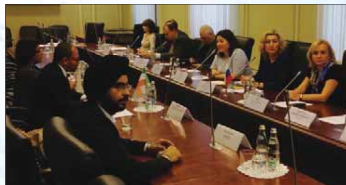
Meeting in progress with Ministry of Economic Development of The Russian Federation.