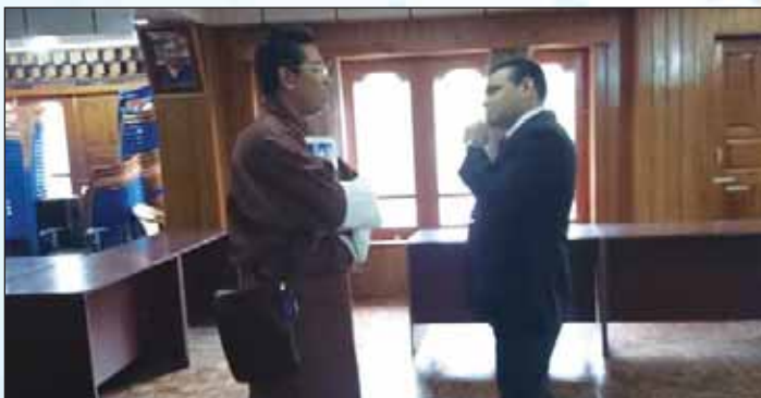
B2B Meetings in progress