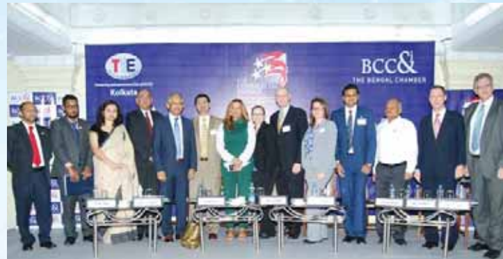
The Bengal Chamber Secretariat Team with the Delegation.