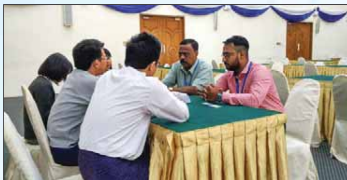
B2B Meetings in progress, UMFCCI office, Yangon, Myanmar