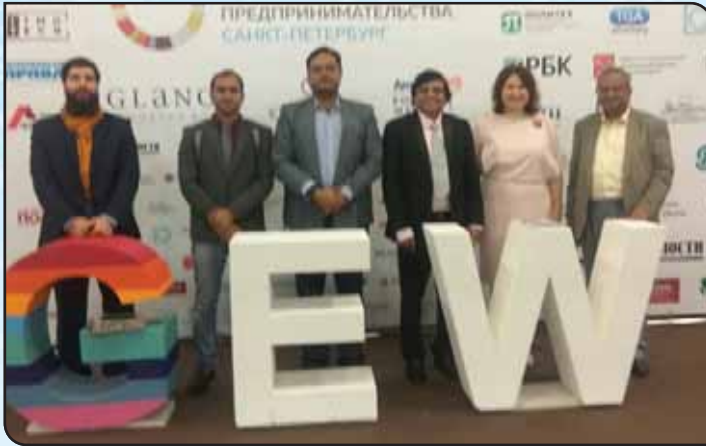
A group photo of some of the Chamber delegates with some of the representatives of GEW – 2017.