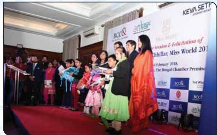
Presentation of tokens of appreciation to the students of APT centre