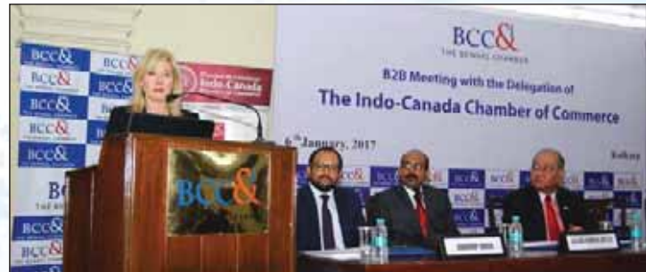
Her Worship Bonnie Crombie, Mayor, City of Mississauga.