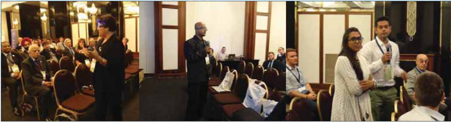
Introduction of Delegates