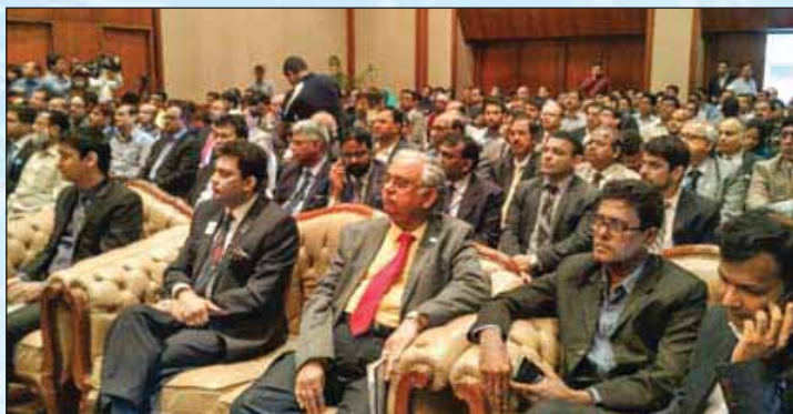
A section of audience with the BCC&I Delegation members at the Inaugural Ceremony of Indo Bangla Trade Fair