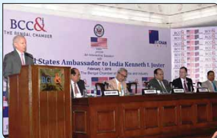
His Excellency Kenneth I. Juster, The 25th United States Ambassador to India gracing the occasion