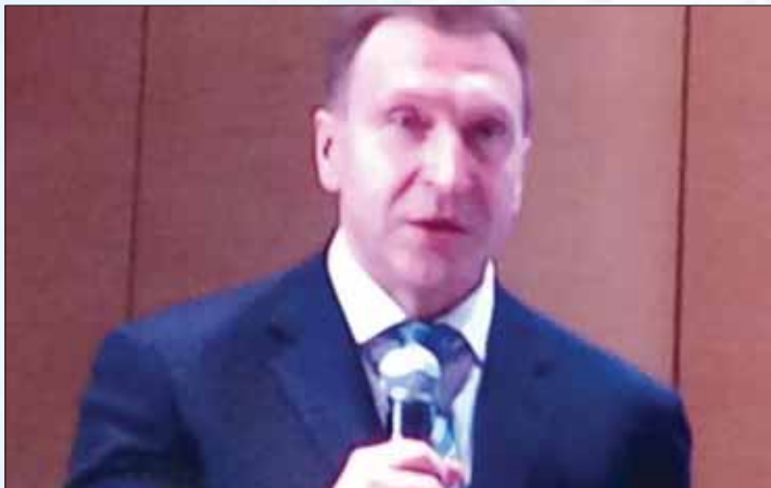
First Deputy Prime Minister of Russia, Igor Shuvalov