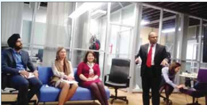
Meeting in progress in Institute for Emerging Market Studies (IEMS), Moscow School of Management SKOLKOVO