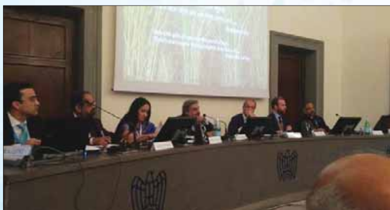
The Business Session in progress