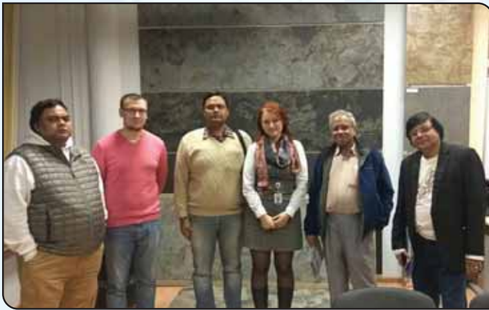
A group photo of the delegates with the representatives of the First Business Incubator of Russia.