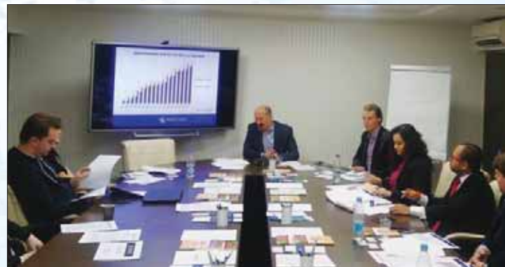
Workshop on “Recommendations for the Foreign Investors in Russia” in progress