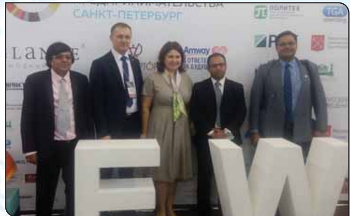
A group photo of some of the Chamber delegates with some of the representatives of GEW – 2017.