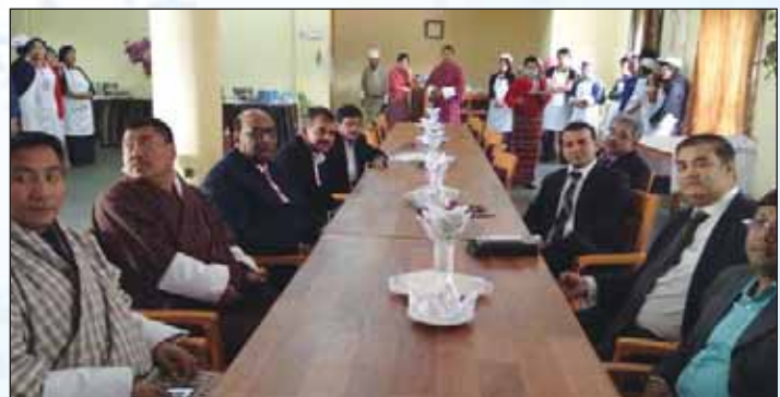
At Lunch with authentic Bhutanese cuisine