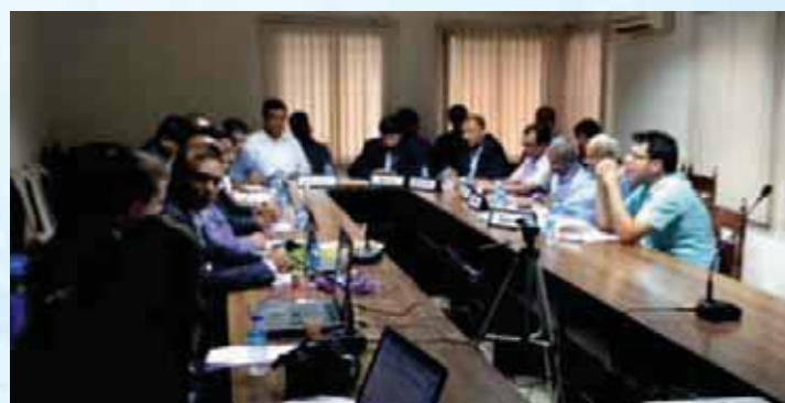
Interactive Session in Progress