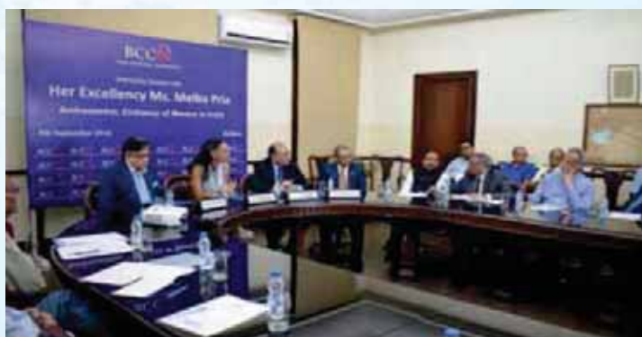
Interaction in progress