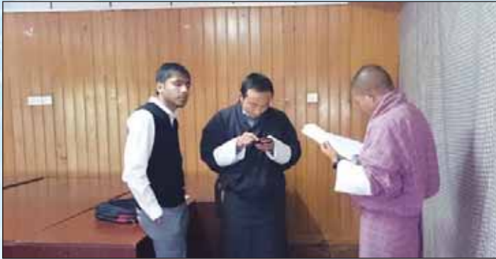
B2B Meetings in progress