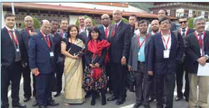
Delegation in front of Gyalong Tshogkhag, Thimphu