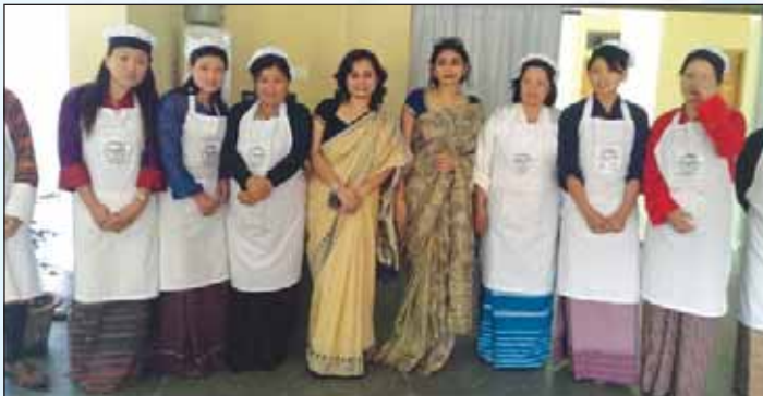
Lunch with authentic Bhutanese cuisine