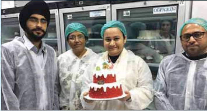
Chamber representatives at Baskin Robbins Russia

are in the business domain of hyper markets with whom discussions may be initiated to import consumable goods from Russia.