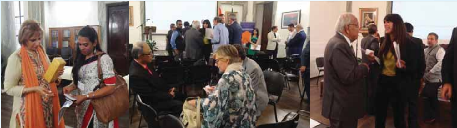
B2B Meetings in progress at Embassy of India in Rome