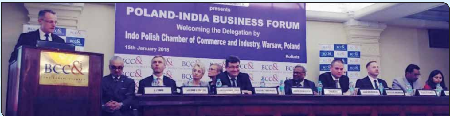
Mr. Marek Magierowski, Hon’ble Deputy Minister of Foreign Affairs of Poland gracing the occasion