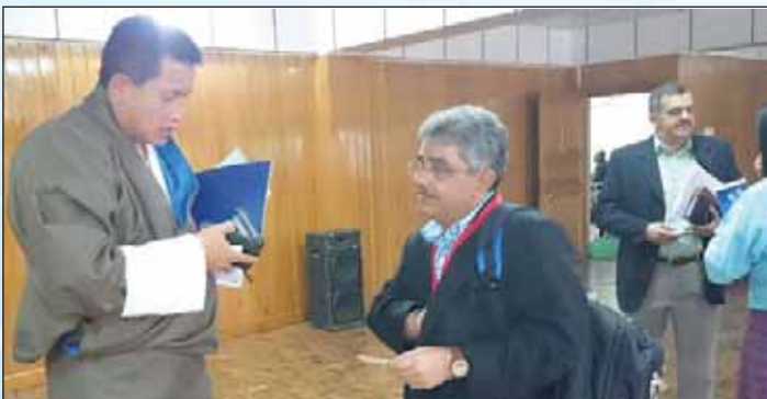
B2B Meetings in progress