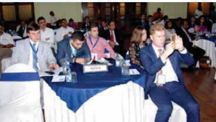
The visiting Diplomats.