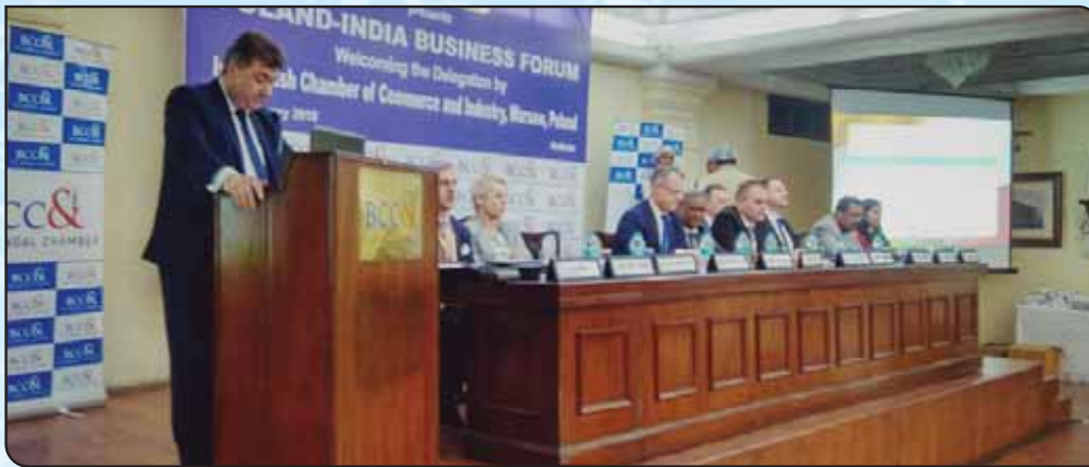
Mr. Grzegorz Tobiszowski, Hon'ble First Deputy Minister of Energy of Poland gracing the occasion