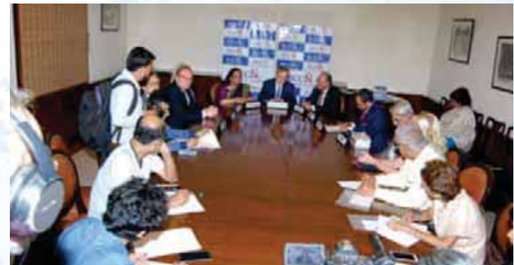
Press Conference in progress.