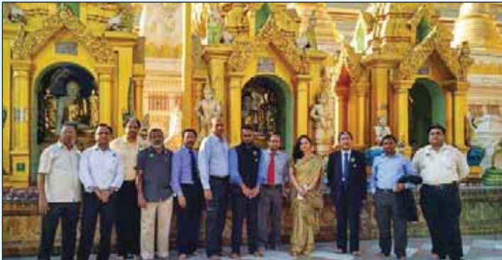
Delegates at Shwedagon Pagoda, Yangon, Myanmar