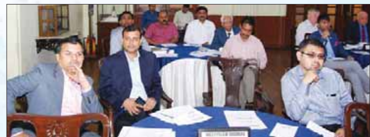
A Section of audience.