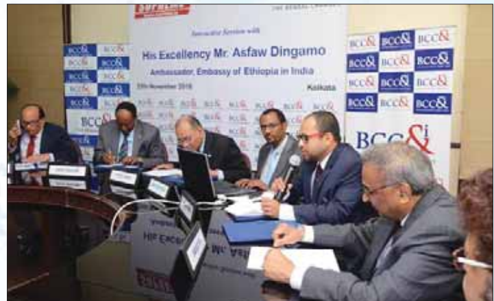
The speakers at the Interactive Session