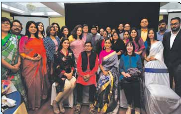
Team Bengal Chamber with Ms. Manushi Chhillar- Miss World 2017