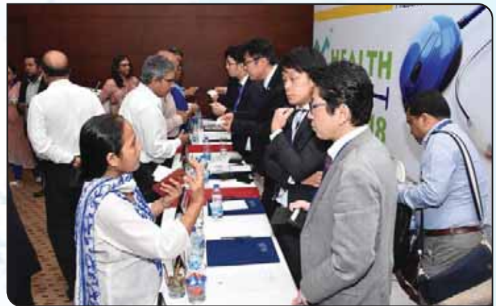
B2B Interaction in progress.