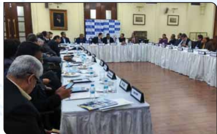
Managing Committee Meeting in progress