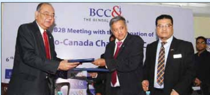
MOU signing between the Indo-Canada Chamber of Commerce and The Bengal Chamber of Commerce and Industry.