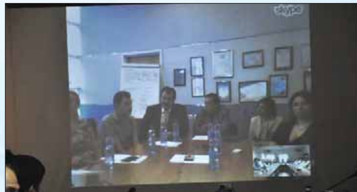
The Russian Side.