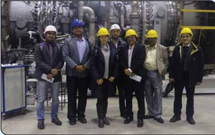
A visit of the Chamber delegates to REP Holding, Nevskiy plant.