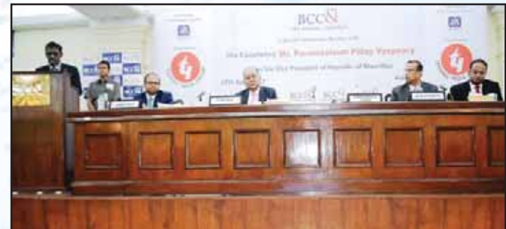
H.E. Mr. Paramasivum Pillay Vyapoory, Hon'ble Vice President, Republic of Mauritius gracing the session.