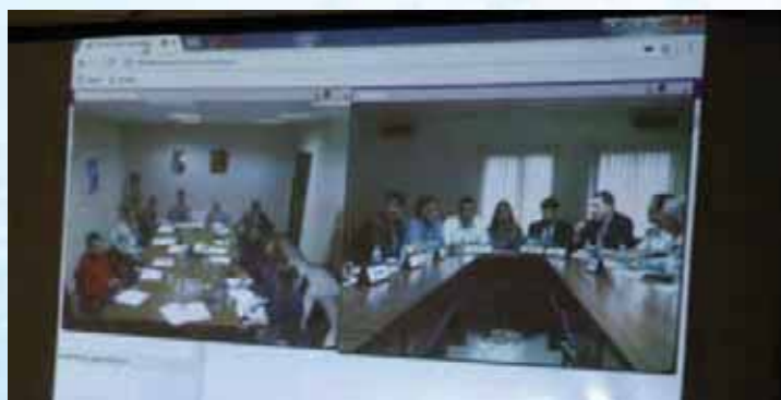
B2B interaction between India and Russia via video conferencing

The Russian representatives also invited the delegates and also the BCC&I IT Fraternity to pay a visit to Voronezh sometime soon to explore more on mutually beneficial collaborative arrangements.