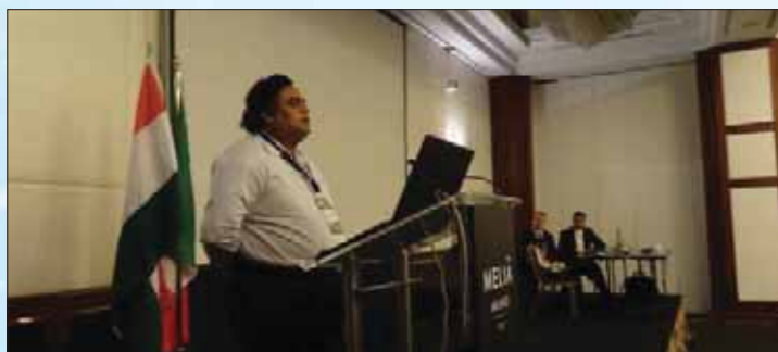
Introduction of Delegates