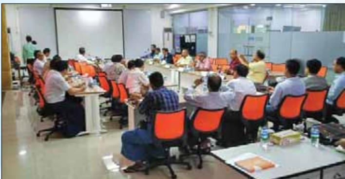
Meeting with business entrepreneurs/companies at Mandalay Regional Chamber of Commerce and Industries (MRCCI), Mandalay, Myanmar