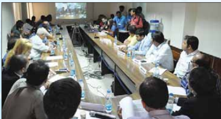
During the session