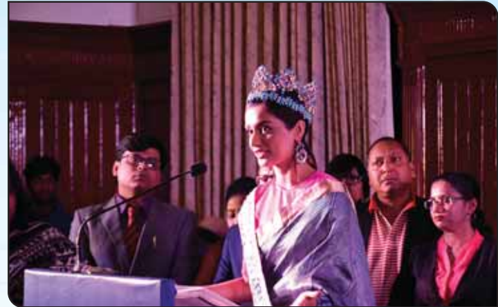
Special Address by Ms. Manushi Chhillar, Miss World 2017