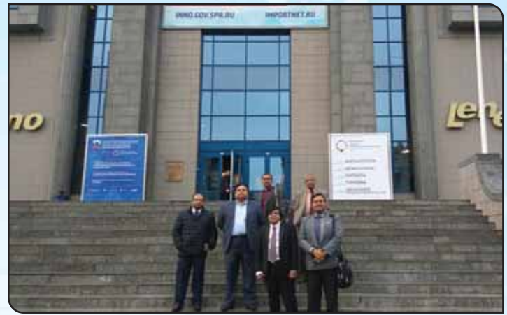
The Bengal Chamber delegates in front of Lenexpo, the venue for the GEW – 2017.