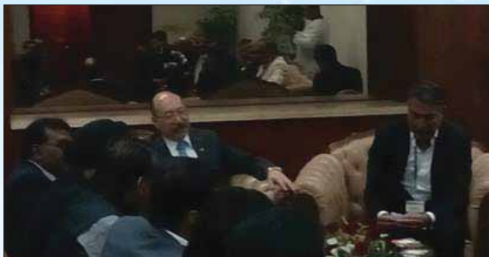
Meeting of The Bengal Chamber Delegation with Shri Harsh Vardhan Shringla, High Commissioner of India to the People's Republic of Bangladesh