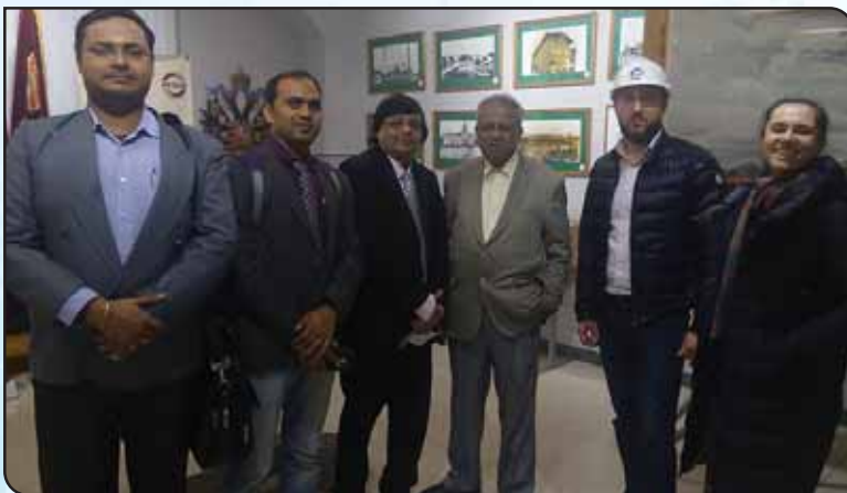
A group photo of the delegates with the representatives of REP Holding, Nevskiy plant, Saint – Petersburg, Russia.