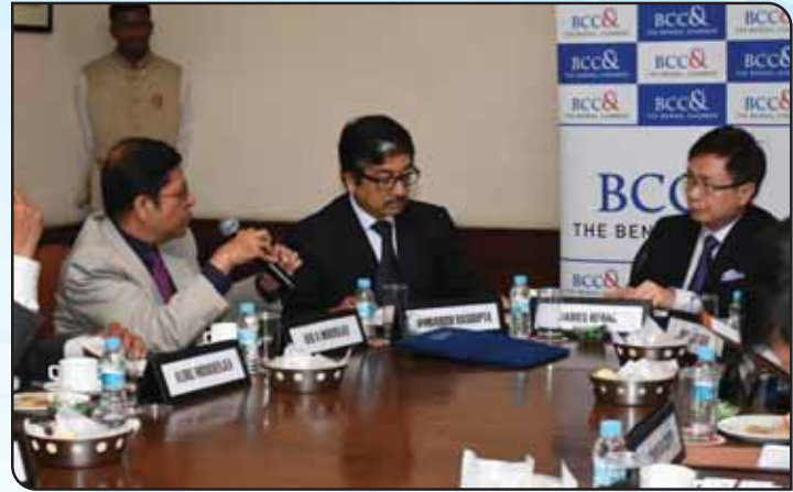
Interaction in progress