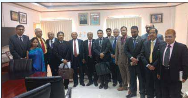
Members of BCC&I Delegation with Janab Tofail Ahmed, Hon'ble Commerce Minister, People's Republic of Bangladesh