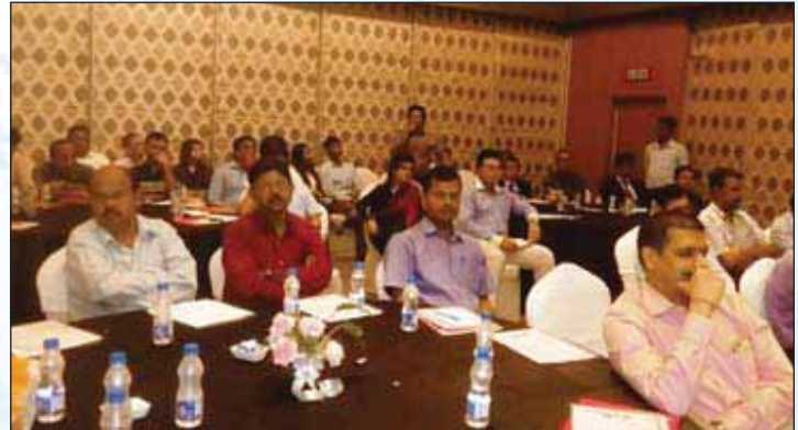
Q/A Session in progress