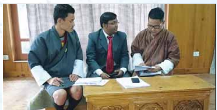
B2B Meetings in progress