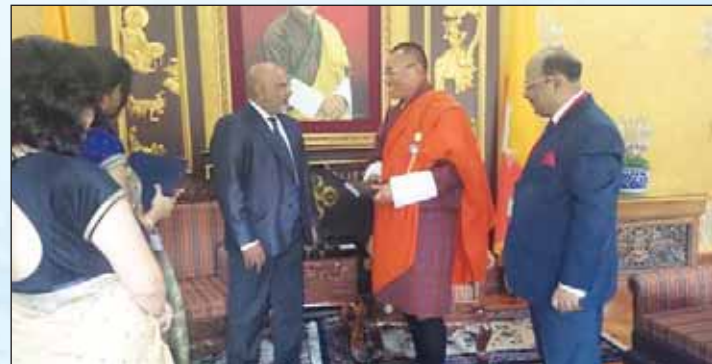
Meeting with His Excellency Tshering Tobgay, Hon'ble Prime Minister of Bhutan