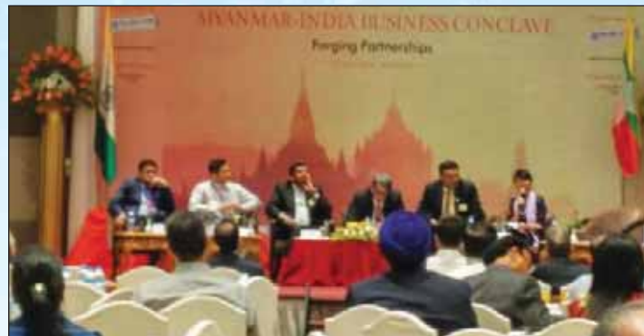
At Indo-Myanmar Business Conclave, Yangon, Myanmar