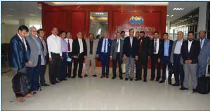
Members of The Bengal Chamber Delegation at World Trade Centre, Chittagong