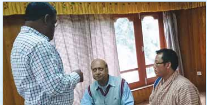
B2B Meetings in progress