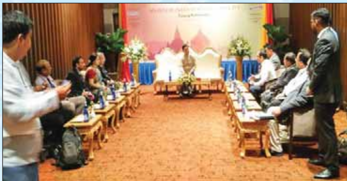
Meeting with His Excellency U Khin Maung Cho, Union Minister, Ministry of Industry, The Republic of the Union of Myanmar, Yangon, Myanmar