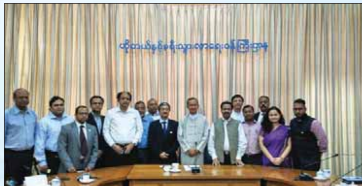
The delegation with His Excellency, U Ohn Maung, Hon'ble Minister of Hotels and Tourism, The Republic of the Union of Myanmar, Nay Pyi Taw, Myanmar