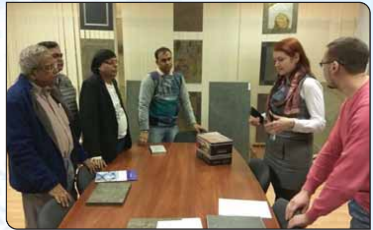
Meeting of the delegates with the representatives of the First Business Incubator of Russia.