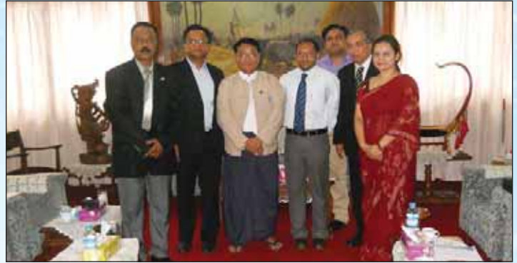
The delegates with His Excellency Dr. Than Myint, Union Minister, Ministry of Commerce, The Republic of the Union of Myanmar, Yangon, Myanmar