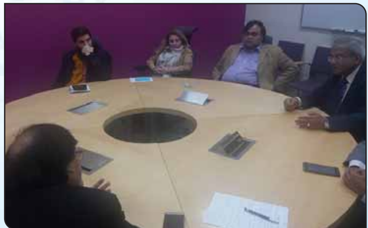
A Roundtable meeting in progress between the Chamber delegates and INGRIA at their office premises.