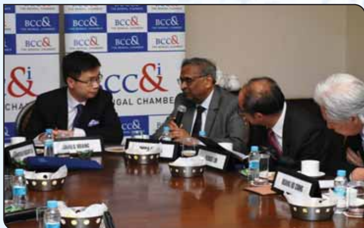
Interaction in progress