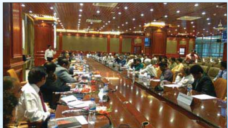
B2B Meeting with Chittagong Chamber of Commerce in progress