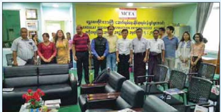
Meeting at Myanmar Construction Entrepreneurs Association, Mandalay, Myanmar