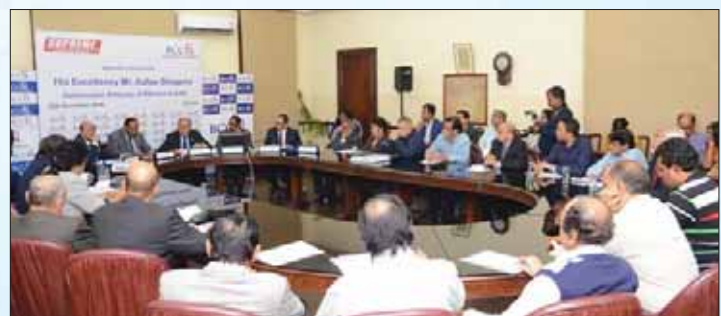
During the Interactive Session