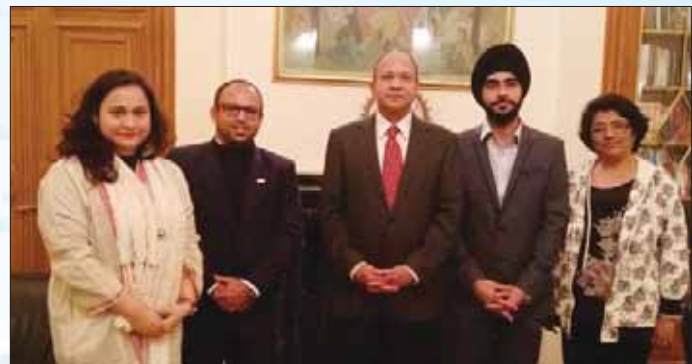
Chamber representatives with Shri Pankaj Saran, Ambassador, Embassy of India in Moscow