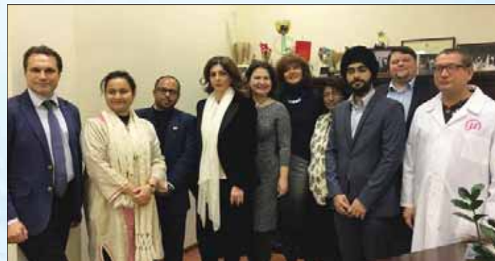
Meeting with Russian Franchise Association (RFA) at Baskin Robbins Russia

The Chamber briefed about the historical linkage shared by West Bengal with Russia and the State's strategic location. The Chamber also mentioned about its stakeholders who