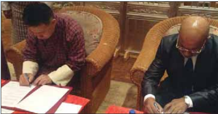
Signing of MoU