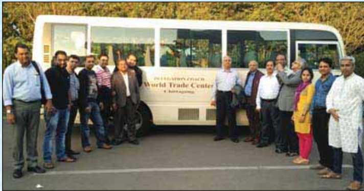
Members of BCC&I Delegation - on arrival at the Chittagong airport