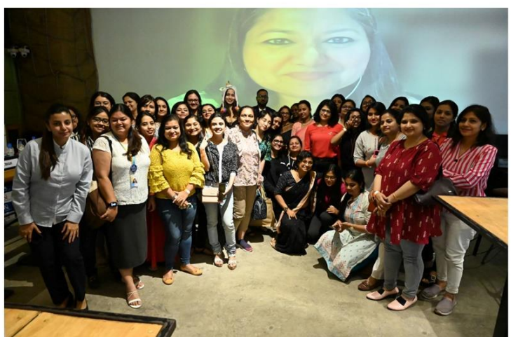
Distinguished participants along with distinguished Speakers.