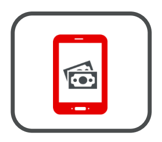
Mobile Payments to enable cashless transactions