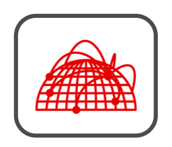
Core connectivity and Location Based Services for Safe and Smart City solutions