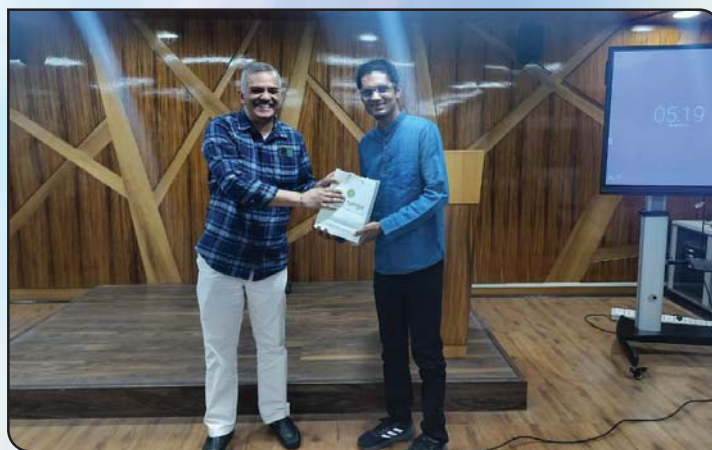
Glimpses of Prize distribution to the Winners of the Quiz round