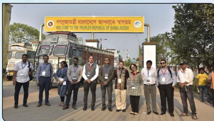
Stakeholder Consultation Meeting at Petrapole on 25 th March 2025