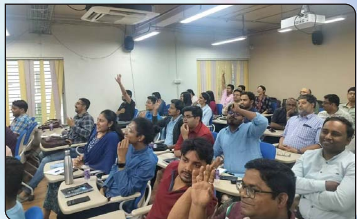
Glimpse of the engaging Quiz round conducted by the Faculty