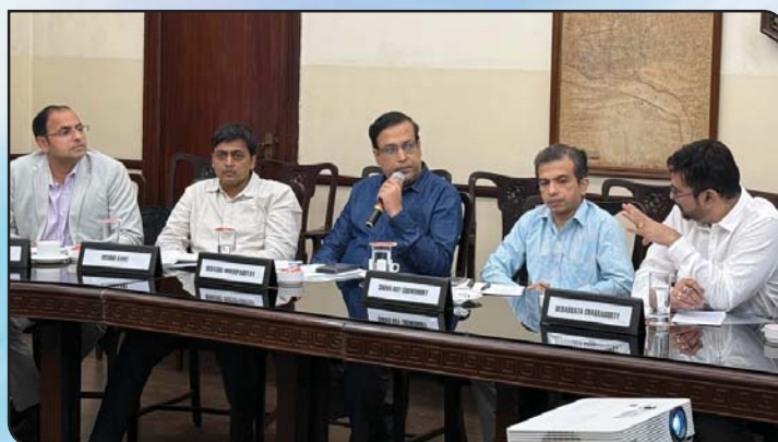
Stakeholder Consultation Meeting at Kolkata on 26 th March 2025