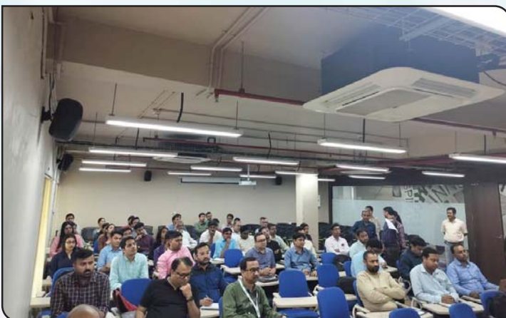
Packed room of participants immersed in the engaging course