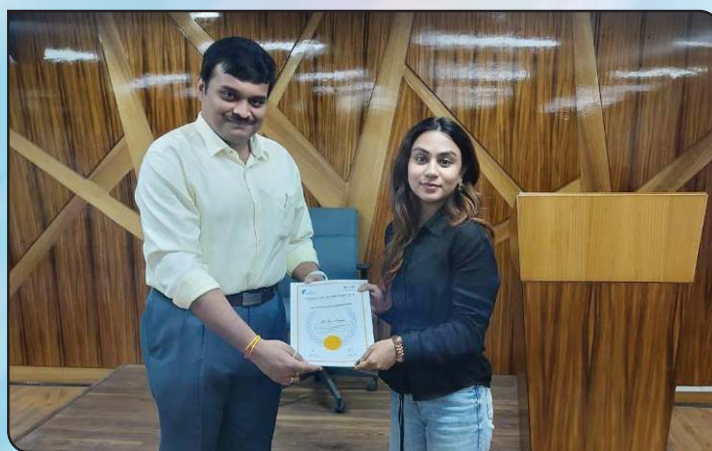
Glimpses of the Certificate Distribution Ceremony marking the end of 4th Edition of Cyber Security Course 2025