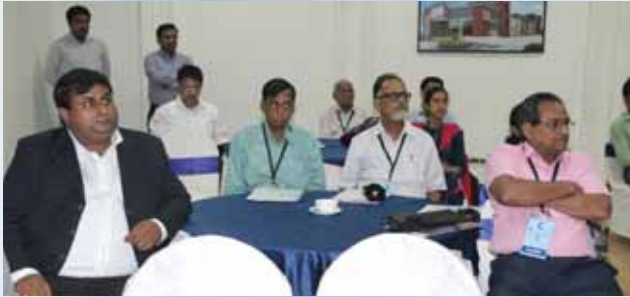
Audience in B2B session with HP.

Second International Conference on Engineering for Humanity 2015