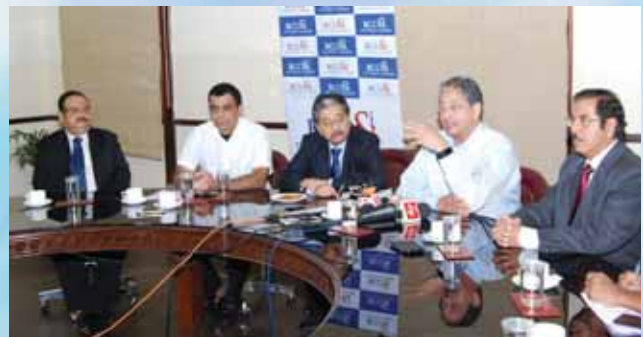
Press conference of the seminar