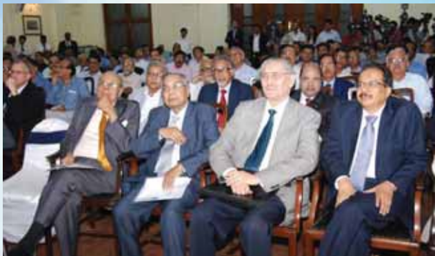
The Past Presidents and other guests.