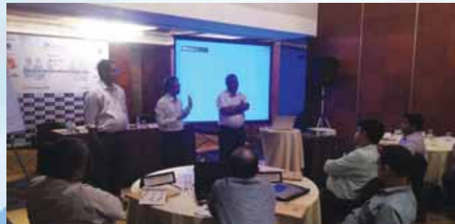
The faculty of Jadavpur University conducting the workshop.