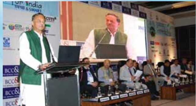
Shri Manish Gupta, Hon'ble Minister-in-Charge, Power & Non-Conventional Energy Sources, Government of West Bengal during his address.