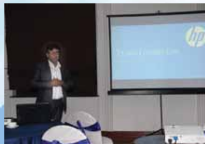
B2B presentation by HP at Globysyn Room, The Chamber Premises.