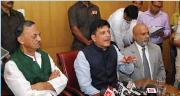
(L-R) Shri Manish Gupta, Hon'ble Minister-in-Charge, Power & Non-Conventional Energy Sources, Government of West Bengal; Shri Piyush Goyal, Hon'ble Minister of State with Independent Charge and Dr Alok Roy, President, The Bengal Chamber are addressing the Media.