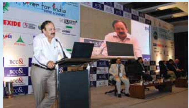
Shri V Subramanian, IAS, Former Secretary to the Government of India, Ministry of New and Renewable Energy.