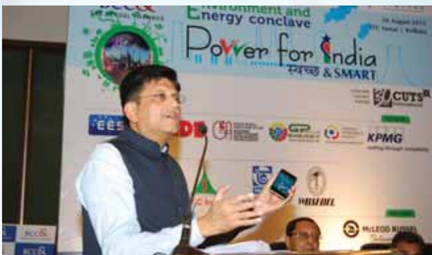
Shri Piyush Goyal, Hon'ble Minister of State with Independent Charge for Power, Coal and New & Renewable Energy, Government of India during his Inaugural Address.