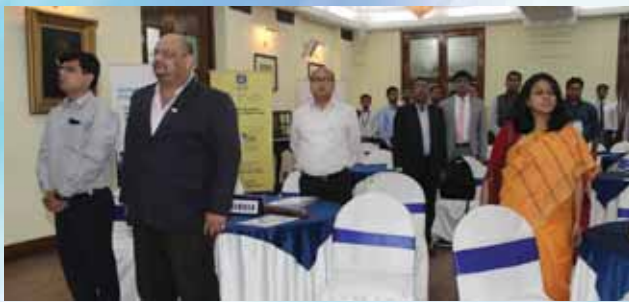
National Anthem at the closing of conference.