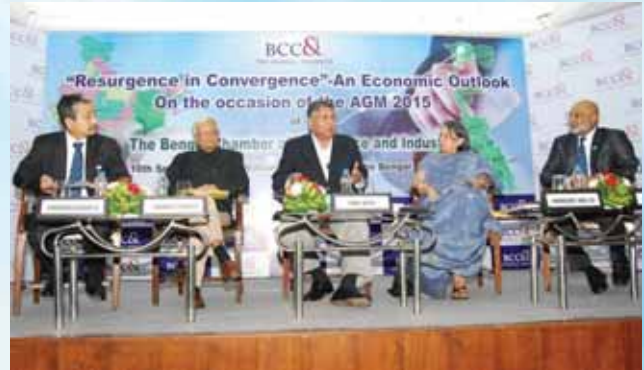
Panel Discussion in progress.