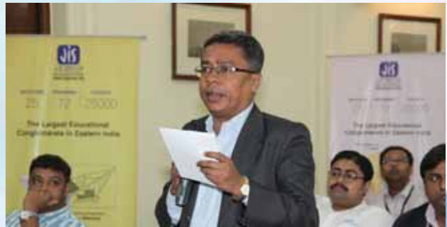
Question from the audience.