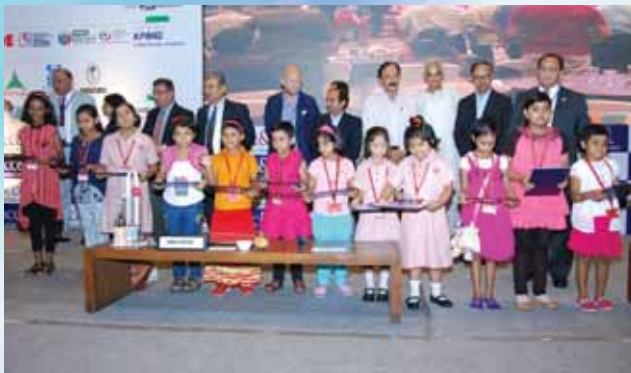
Children who participated in the Sit and Draw Competition on 25th April in the Chamber with the dignitaries.