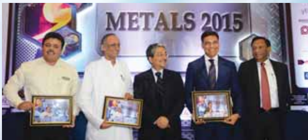
Speakers at the Opening Session.