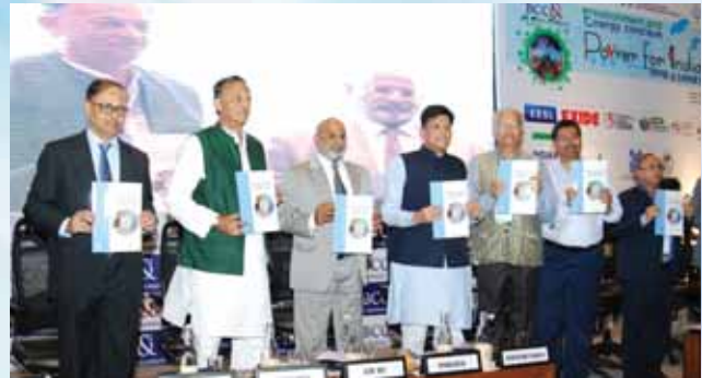
Release of CUTS Special Publication, "Mainstreaming Sustainable Development: A Quick Diagnostic of Key Challenges and Opportunities for Water, Energy & Food Security in South Asia".