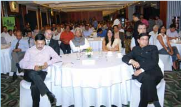
A cross section of the Audience.