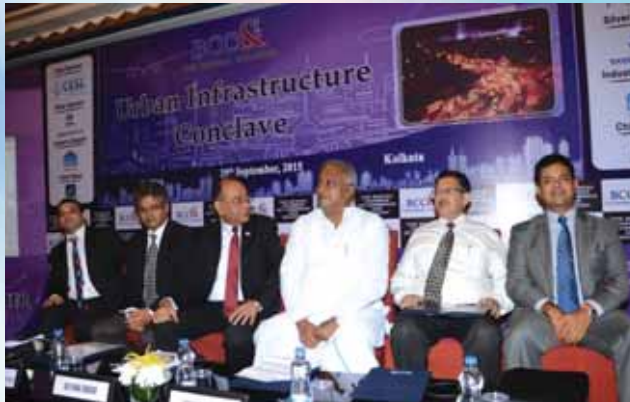
Inaugural Session of the Urban Infrastructure Conclave.

The Bengal Chamber organised a seminar on Urban Infrastructure on 29th September at The Park, Kolkata. The need for up-gradation and development of urban infrastructure and for sustainable cities cannot be overstated. The present levels of urban infrastructure are grossly inadequate to meet the demand of the existing urban population. There should be adequate flow of investment to support the growth of this sector. However over-dependency on the Government in terms of investment is not advisable and neither is a viable model, and yet there should be adequate return for the private sector investment. From where the investment would come and how the return can be ensured becomes the utmost important question. There is also the requirement of proper sewerage system and adequate power supply. There is a great need of a solid waste management policy. Extra high voltage ring around the city is required in addition to the existing power generation units and that has to be wide spread so that there remains less possibility of passing heavy voltage from a very short path. Sustainability is complex and requires a shift from reactive to proactive approaches. It demands adoption of an integrated approach to management of key services like water, waste and transportation. It urges participation at all levels of the community in decision-making. The key focus also has to be given towards modernization of airport infrastructure and the overall transportation system.