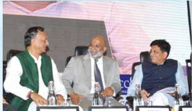
In conversation (L-R): Shri Manish Gupta, Hon'ble Minister-in-Charge, Power & Non-Conventional Energy Sources, Government of West Bengal; Dr Alok Roy, President, The Bengal Chamber and Shri Piyush Goyal, Hon'ble Minister of State with Independent Charge for Power, Coal and New & Renewable Energy, Government of India.