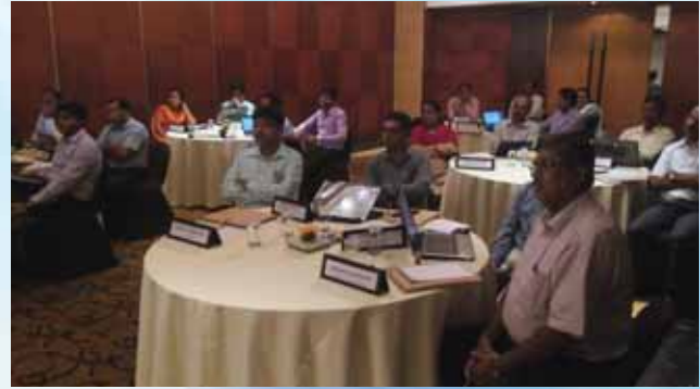
The participants present in the workshop.