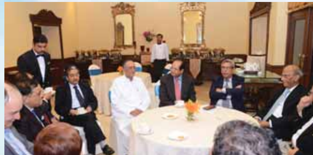
Speakers interacting with Dr. Amit Mitra before the start of the programme.