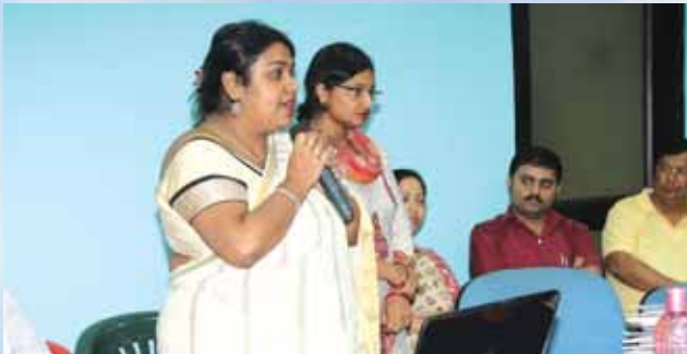
During the workshop in Borough 15.