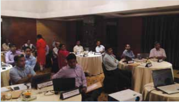
The participants present in the workshop.

Workshop on Statistical Decision Making for Managers