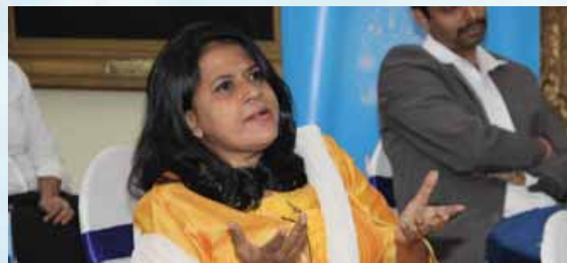
Question from audience.