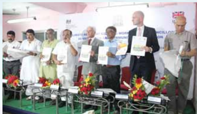
Borough 3 - during the poster launch.