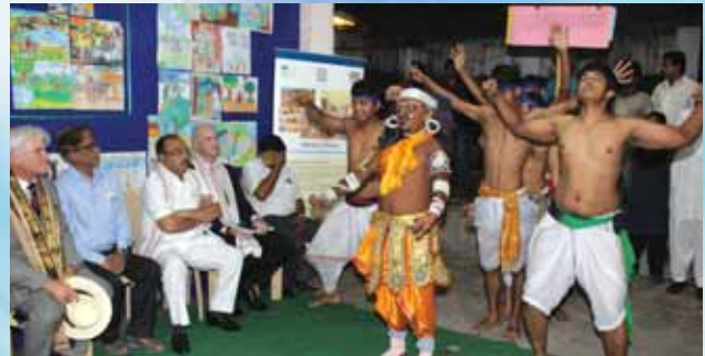
Performance during the workshop - Borough 3