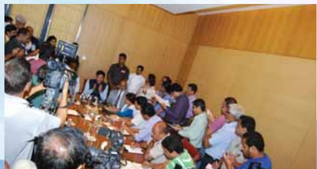
Press Conference in progress.