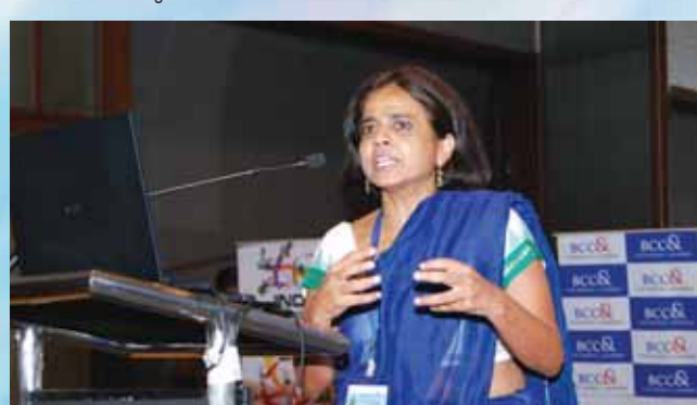
Dr. Sunita Narain, Director General, Centre for Science and Environment addressing the Valedictory Session.