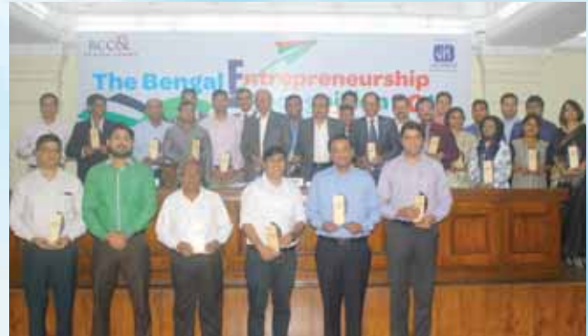
Participants from both Services and Non Services sectors with their recognition/awards.