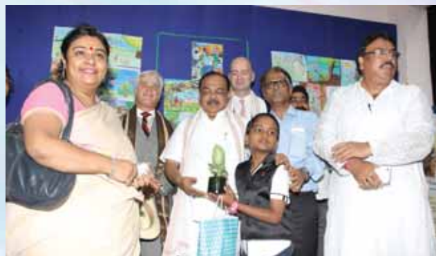
Borough 3 - During the prize distribution ceremony.