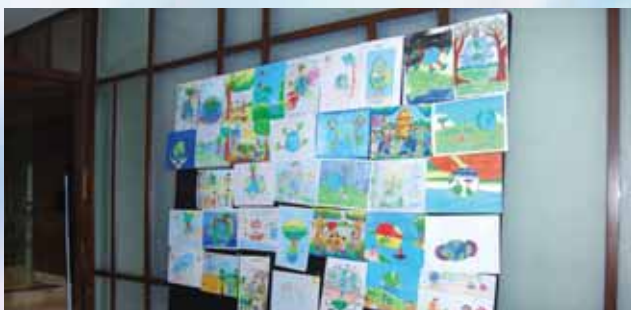
Exhibition of Drawings by children in the Sit and Draw Competition on 25th April in the Chamber.