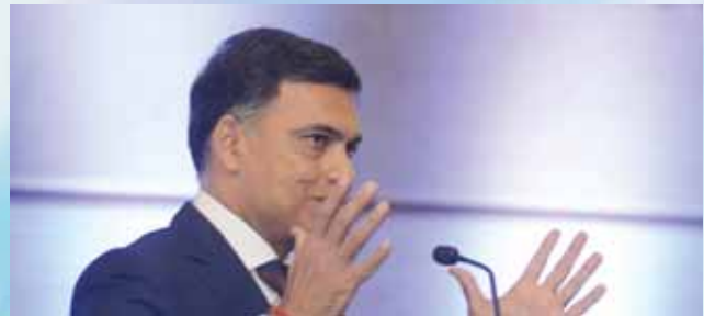
Mr. Sajjan Jindal speaking at the Opening Session.