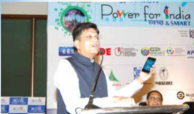
Shri Piyush Goyal, Hon'ble Minister of State with Independent Charge for Power, Coal and New & Renewable Energy, Government of India during his Inaugural Address.