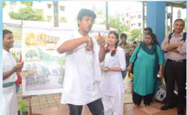
Borough 16 – Roadshow.