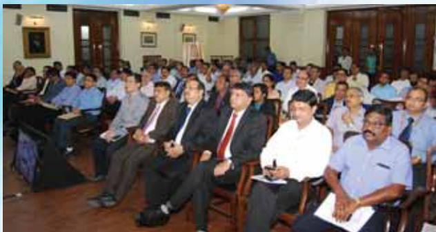
The delegates present in the seminar