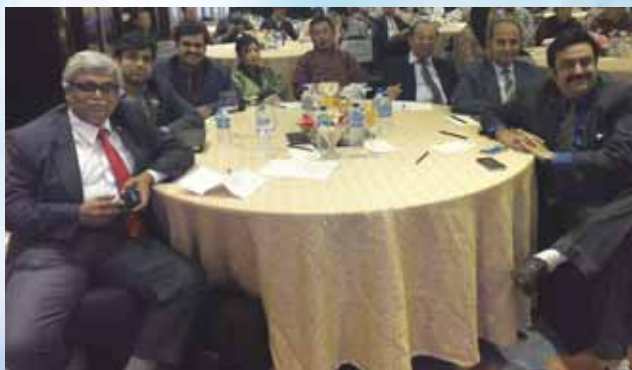
A part of the Bengal Chamber delegation at the Conclave.