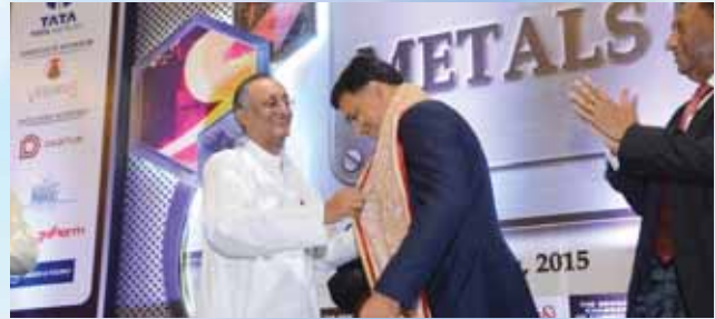
Dr. Amit Mitra felicitating Mr. Sajjan Jindal.