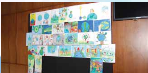
Exhibition of Drawings by children in the Sit and Draw Competition on 25th April in the Chamber.