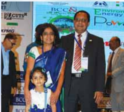
Children who participated in the Sit and Draw Competition on 25th April in the Chamber with the dignitaries.