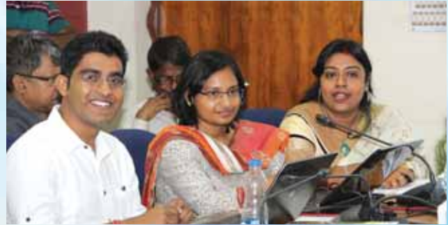
During the workshop in Borough 5.