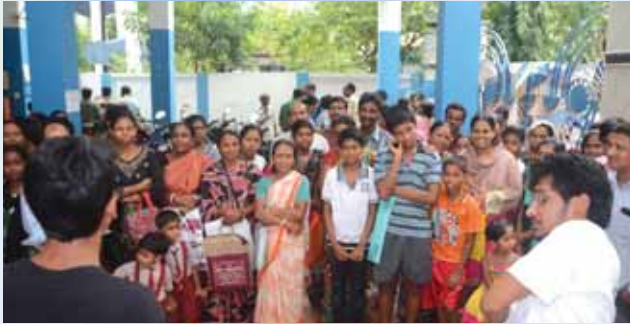
Roadshow at Borough 16