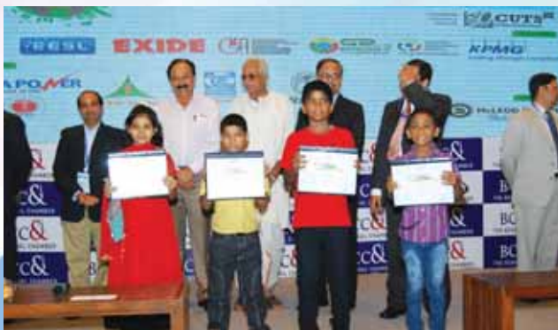
Children who participated in the Sit and Draw Competition on 25th April in the Chamber with the dignitaries.