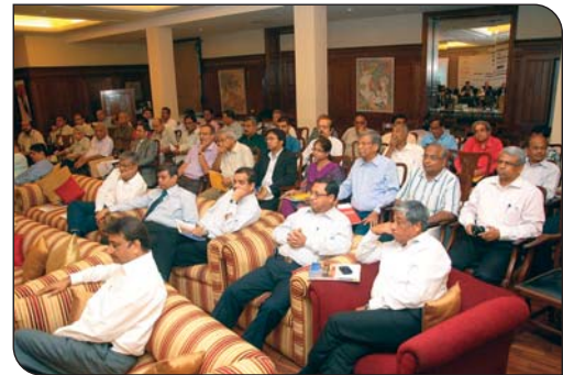
▲ The Audience

KKN Group, The Telegraph, Ballantines, Government of South Australia & Anderson Printing were involved in bringing the programme