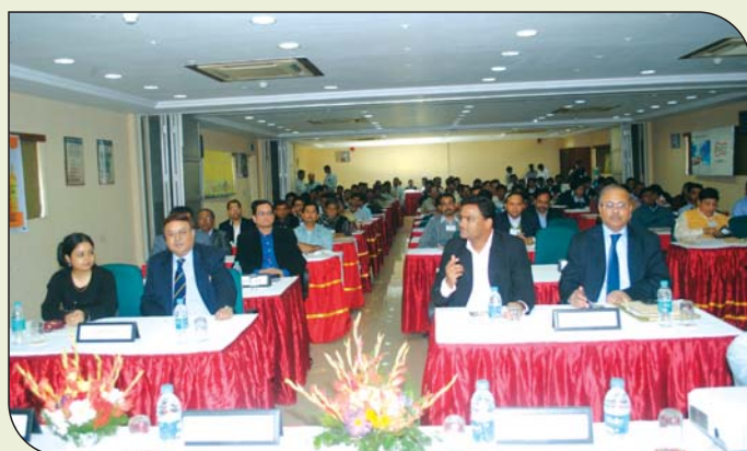
▲ Delegates on Day 1 of the seminar.