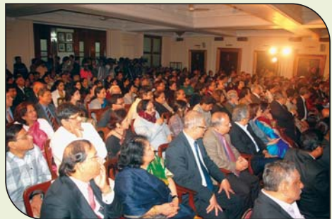
▲ A packed Williamson Magor Hall