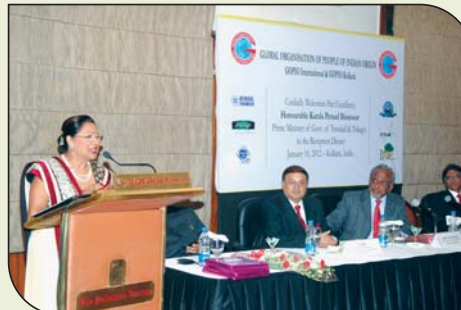
▲ H.E. Kamla Persad-Bissessar addressing the invitees