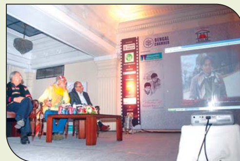
▶ The Adda in progress. A clip of "Kanchenjanga" being projected on the screen