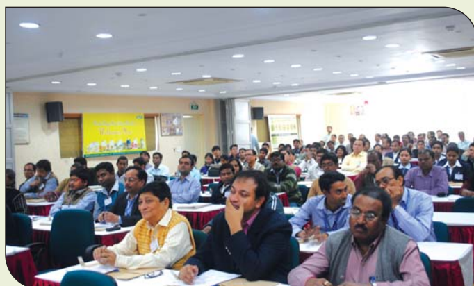
▲ Delegates on Day 2 of the seminar.