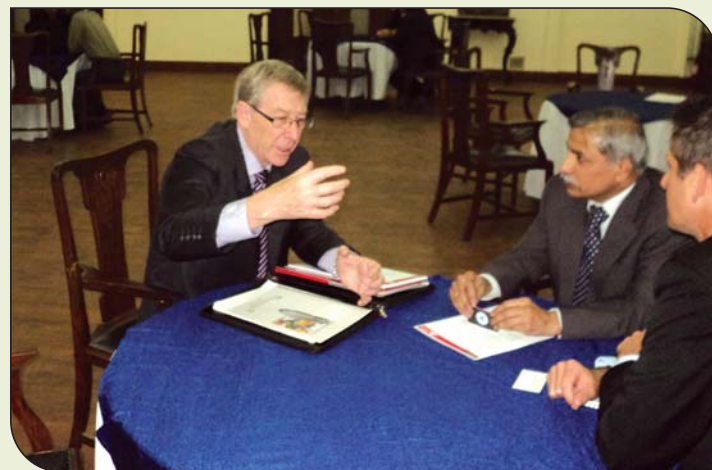
▶ B2B meeting with Queensland Mining Trade Mission