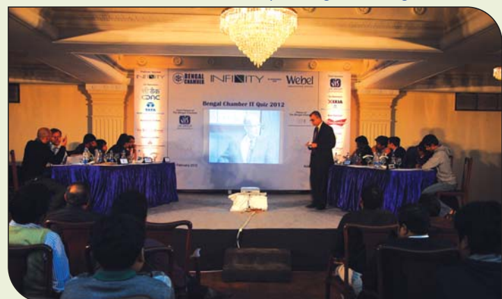
▲ Another snap of the final round.