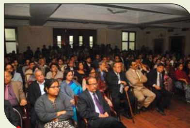
▲ The distinguished members of the audience in rapt attention

hosted the panel discussion as the moderator and anchor. The programme was an informal discussion, in the mood of an "adda", with the panelists being the leading actors of Ray Classics. The Panelists shared their anecdotes and experiences of working with the maestro and recounted some of the many memories of their days in Ray films. It was a natural sequel to the "Adda with Heroines of Satyajit Ray" organized on 11th