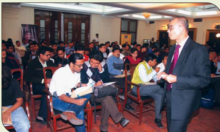
▲ The preliminary round with close to 50 teams