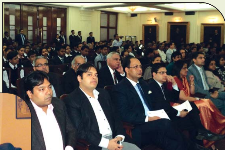
▲ A packed WM Hall