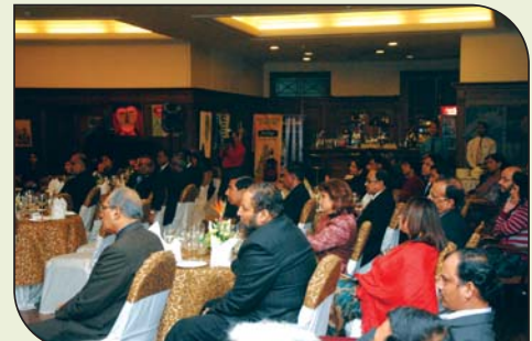
▲ The audience