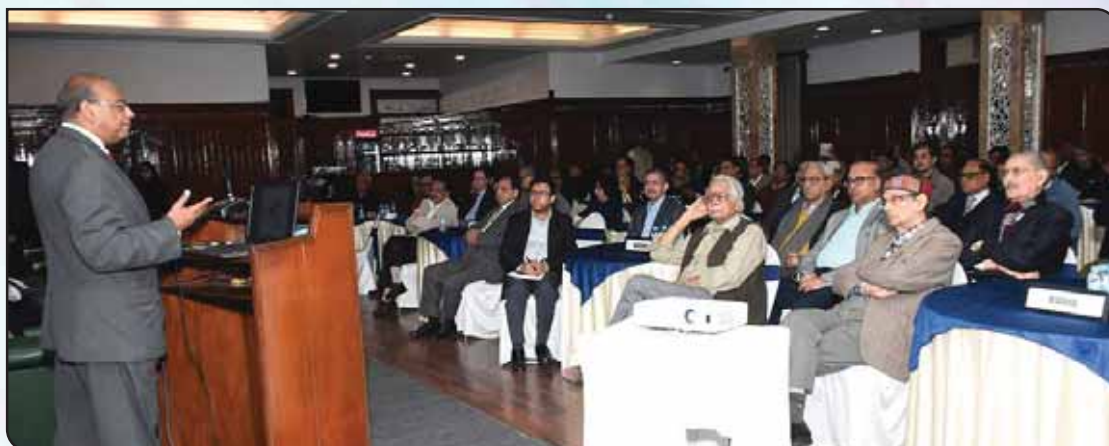
Audience at the session