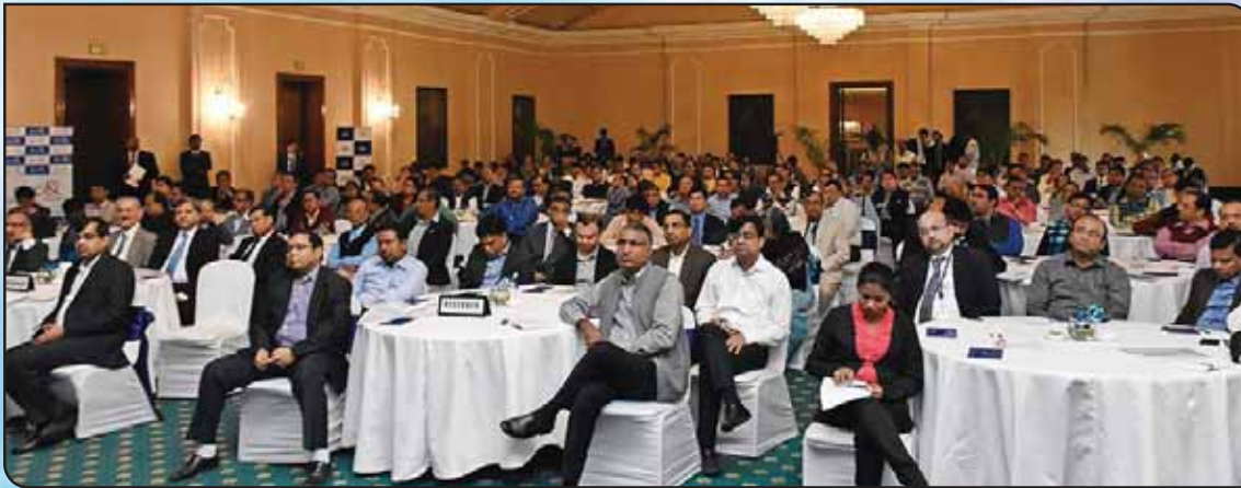
Audience at 'Union Budget 2018 -19: An In-depth Analysis'

2nd February 2018, The Oberoi Grand, Kolkata