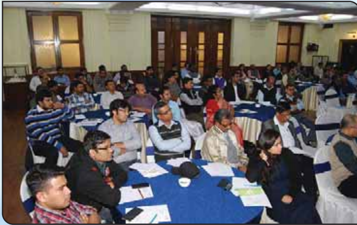
Audience at the Seminar