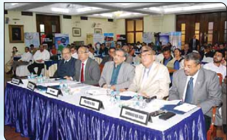
The Panel of Judges along with the audience