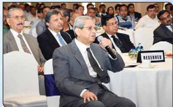
Q/A Session in progress