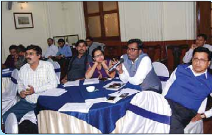
Q/A Session in progress