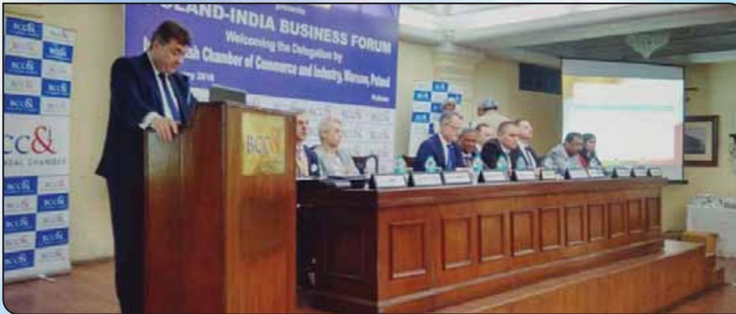
Mr. Grzegorz Tobiszowski, Hon'ble First Deputy Minister of Energy of Poland gracing the occasion