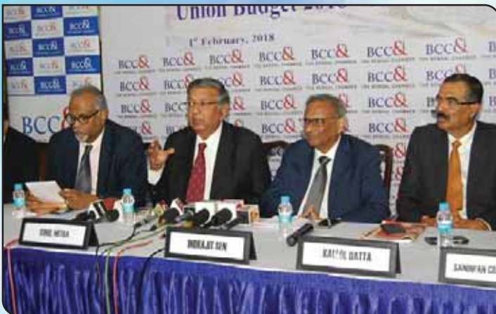
Media Interaction in progress