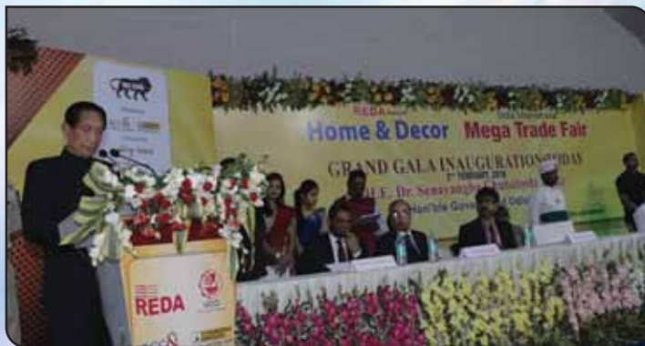
His Excellency Dr. S. C. Jamir, Hon'ble Governor of Odisha, delivering the Welcome Address at the Inaugural Session of the India International Mega Trade Fair, 2018 at Bhubaneshwar

There was participation from 10 foreign countries – Thailand, Mexico, Netherlands, Pakistan, Sri Lanka, Egypt, Turkey, Dubai, Bangladesh & Afghanistan - which was also the Focus Country. There was also participation from various agencies and organizations under the Government of India as well as State Government Departments like, MSME, NSIC, IT Departments, Jharkhand, West Bengal, Gujarat and other Indian States.