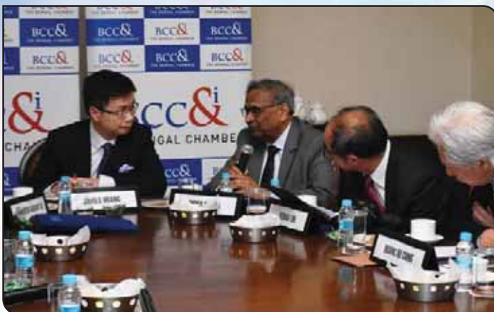
Interaction in progress