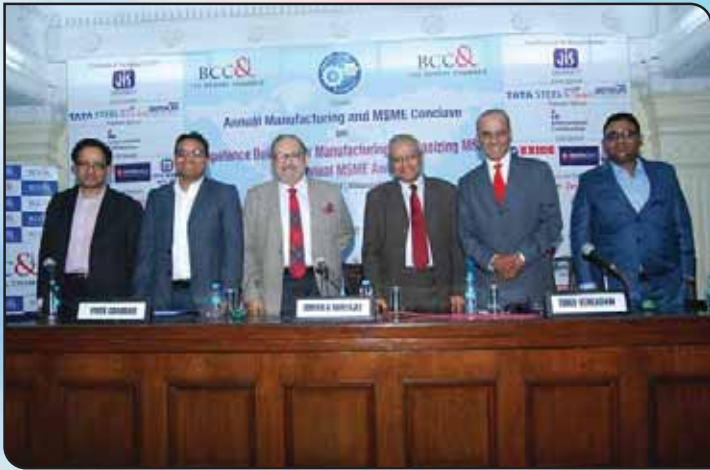
A Group photo of the Panelists of Technical Session II