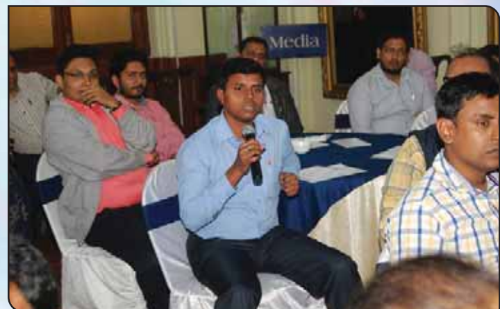
Q/A Session in progress