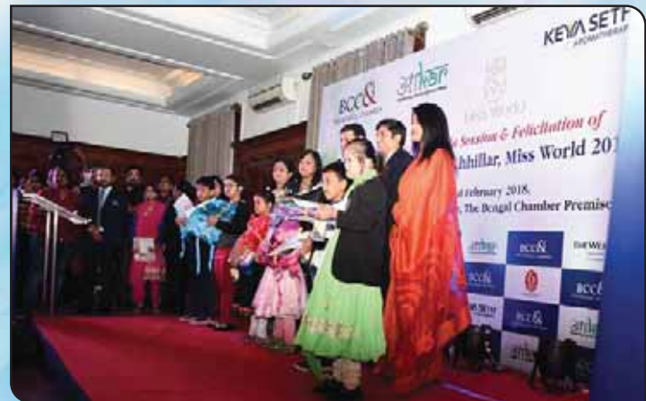
Presentation of tokens of appreciation to the students of APT centre