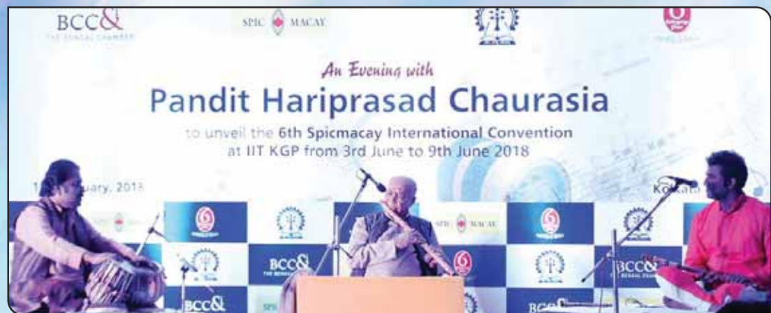
Performance by Pandit Hariprasad Chaurasia