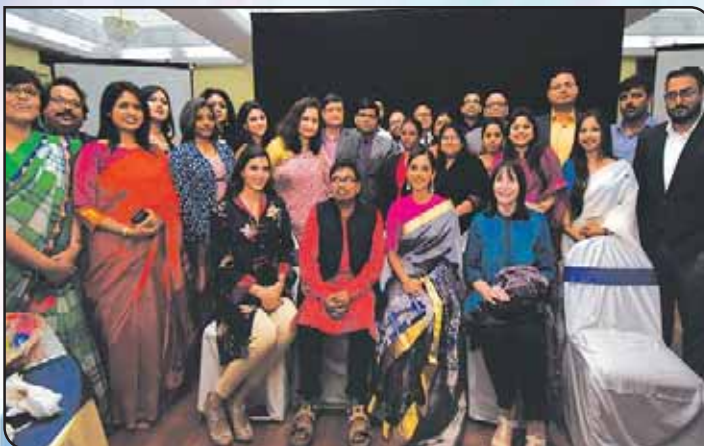
Team Bengal Chamber with Ms. Manushi Chhillar- Miss World 2017