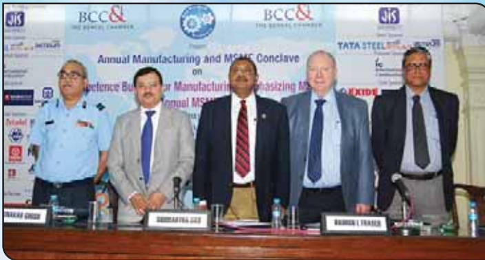
A Group photo of the Panelists of Technical Session 1