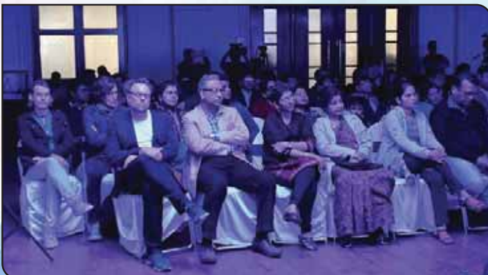
Section of the audience