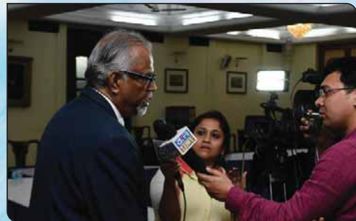
Media Interaction in progress