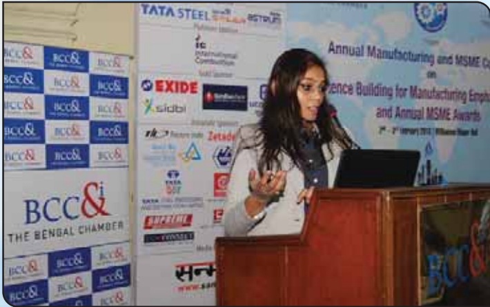
An applicant under the Service Category making a presentation at Technical Session III of the Conclave