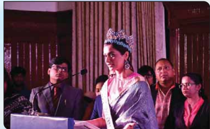
Special Address by Ms. Manushi Chhillar, Miss World 2017