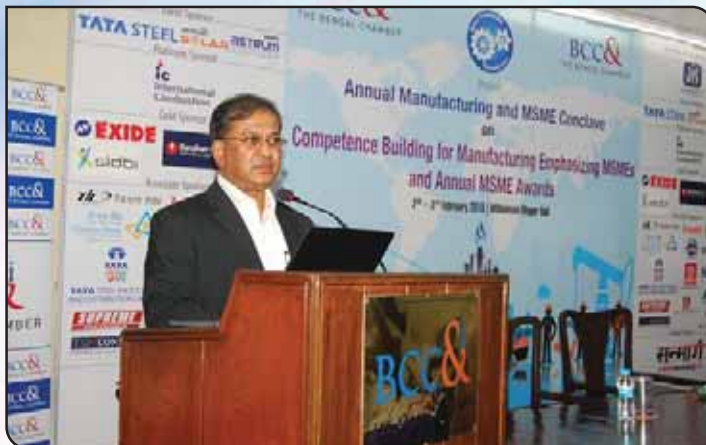
An applicant making a presentation at Technical Session III of the Conclave