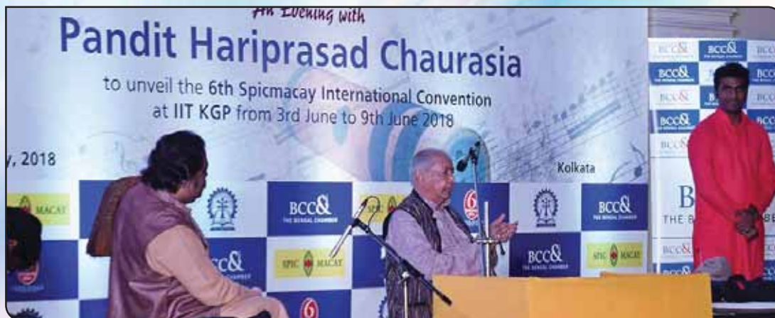
Performance by Pandit Hariprasad Chaurasia