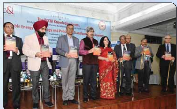
Launching of the publication titled, 'Sustainable Energy Technology and Policies- A Transformational Journey', published by Springer