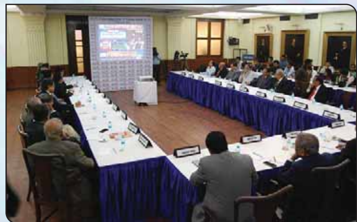
Union Budget 2018-19 Viewing Session in progress