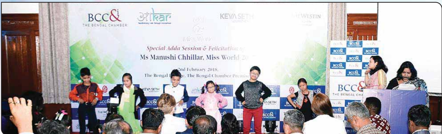
Performance by students from APT Centre