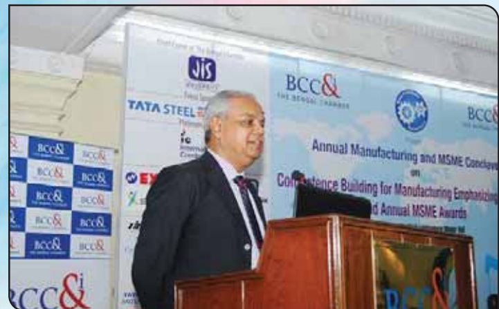
An applicant making a presentation under the Steel and Manufacturing Category at Technical Session III of the Conclave