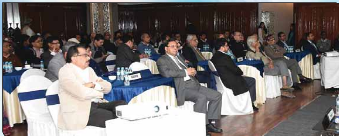
Audience at the session