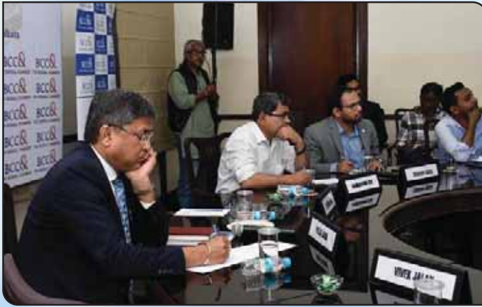
State Budget 2018-19 Viewing Session in progress