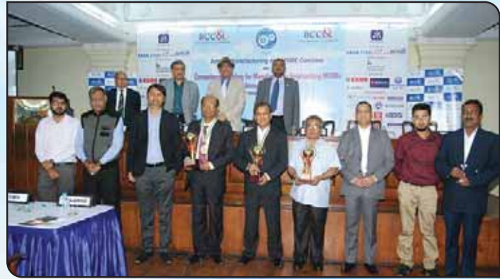
A Group photo of the Participants for the Award, the Award Winners, the Panel Judges and the Chamber Secretariat