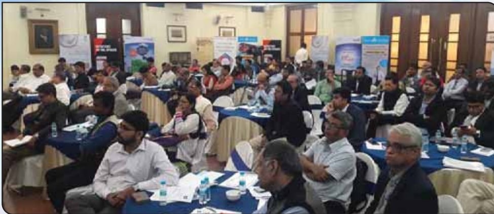
The delegates present in the Conclave