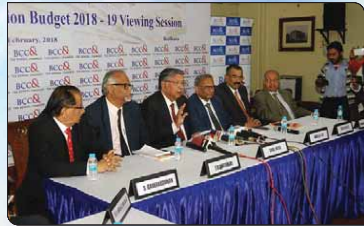
Media Interaction in progress