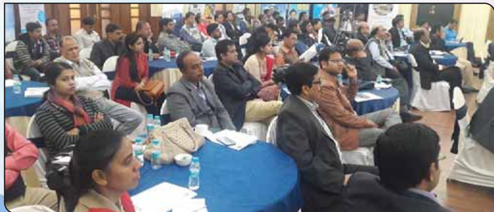
The delegates present in the Conclave