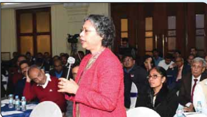
Q/A Session in progress.