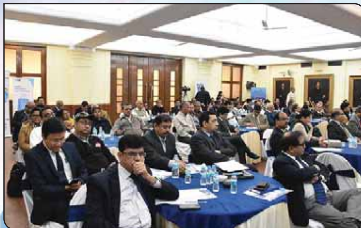
Audience participating in the Conclave