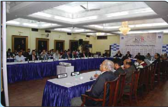
Union Budget 2018-19 Viewing Session in progress