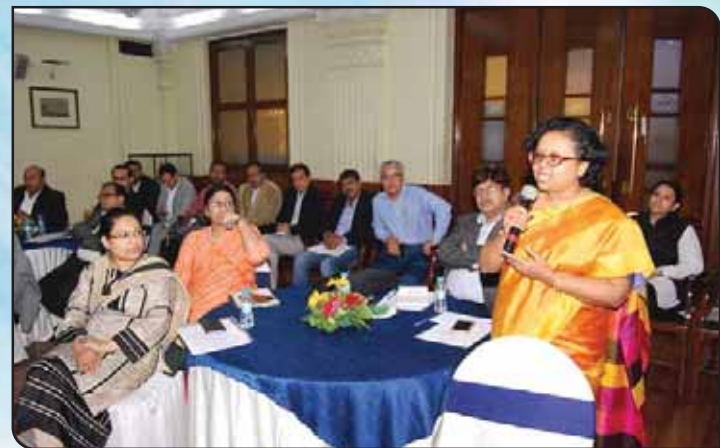
Questions from the audience

15th-25th December 2017, Science City Grounds, Kolkata