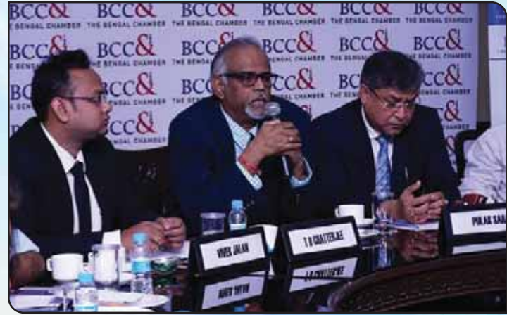
Media Interaction in progress