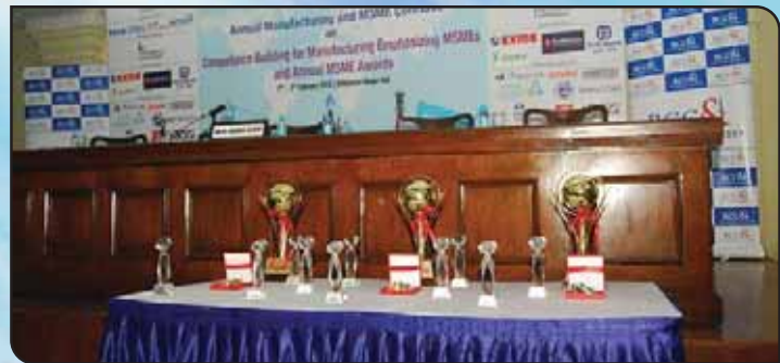
A photo of the Awards, Medals and the Mementos presented to the Award winners and the participants in the conclave