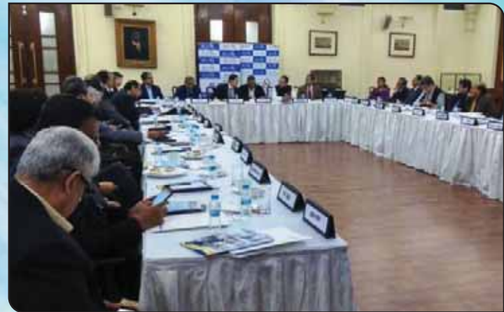
Managing Committee Meeting in progress