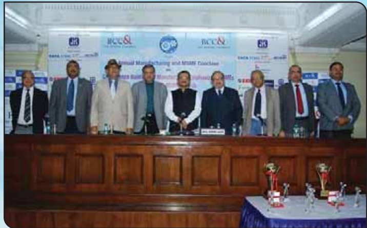
A Group photo of the Panelists of Technical Session III and the Chamber secretariat