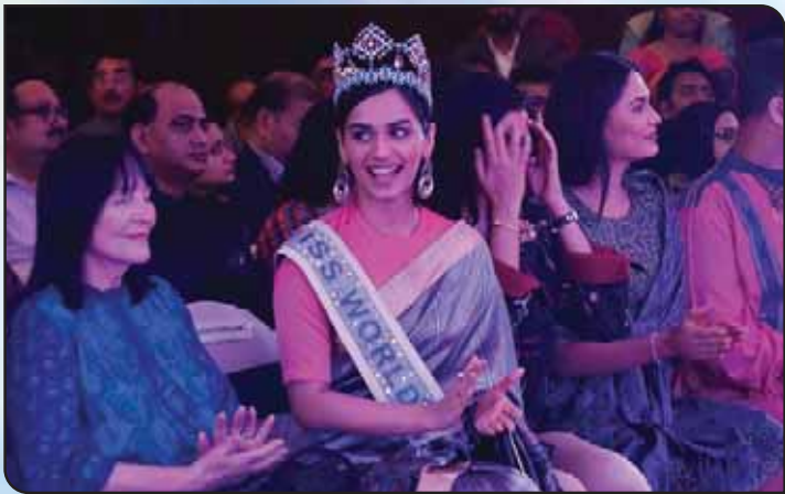
Ms. Manushi Chhillar, Miss World 2017 along with her team enjoying the performance of the students from APT Centre.