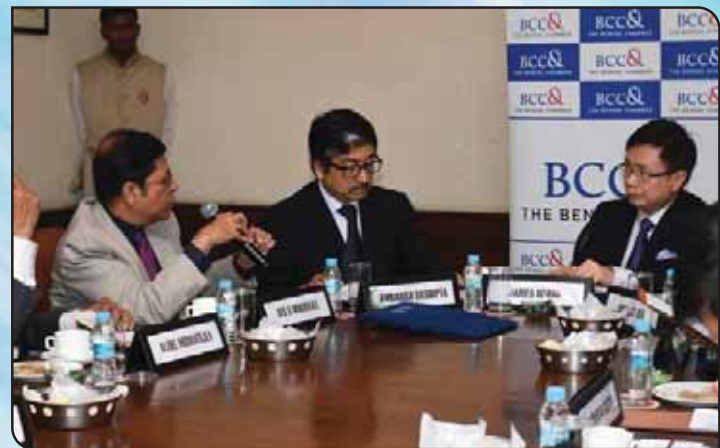
Interaction in progress