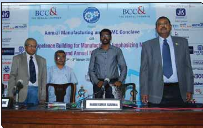
A Group photo of the Panelists of Technical Session IV