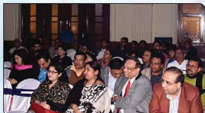
Section of the audience enjoying the performance