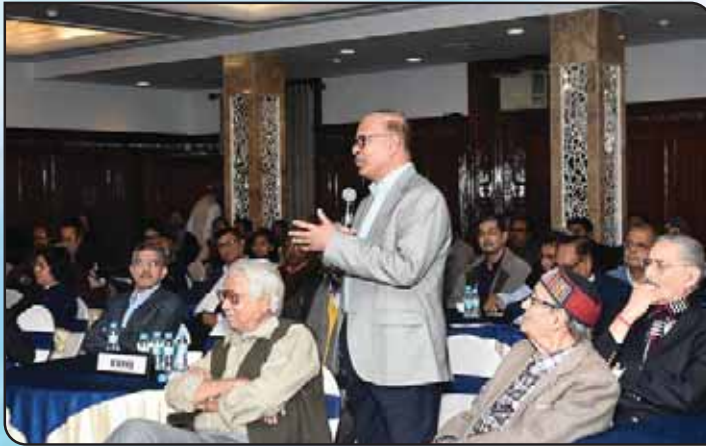
Q & A in Progress

10th January 2018, The Bengal Lounge, Chamber premises