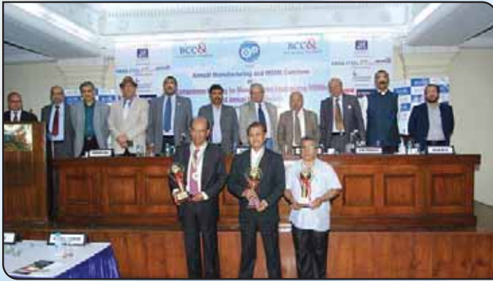
A Group photo of the Session Panelists, the Panel of Judges, the Award Winners and the Chamber Secretariat