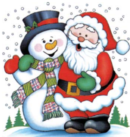
Christmas joy warms the heart