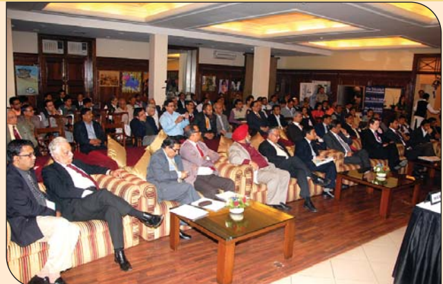
▲ Section of the audience in rapt attention

CERTIFICATE COURSE IN SAFETY, HEALTH AND ENVIRONMENT ALONG WITH EMERGENCY MANAGEMENT