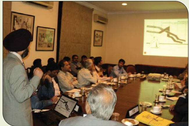
▶ Presentation in progress on the Eurozone Crisis.