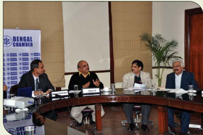
▲ Discussions during the meeting

The next meeting will take place at the Chamber premises on 31st January, 2011 at 3 p.m.