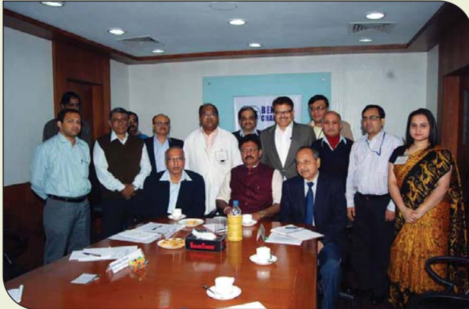
▲ The group.

garbage disposal and others and explained that the State Government had some plans in mind, e.g., the setting up of an IT hub in Taratala and exploring the PPP route to transform abandoned