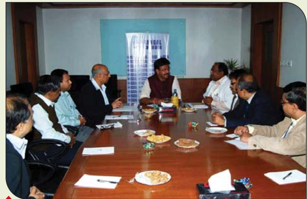
Janab Firhad Hakim interacting with the industry representatives during the meeting focusing on infrastructure development in Taratala.