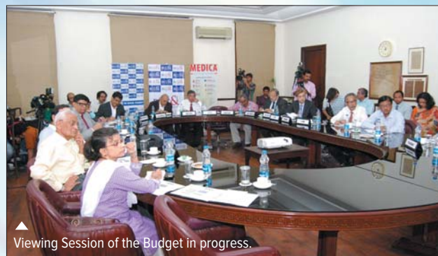
▲ Viewing Session of the Budget in progress.