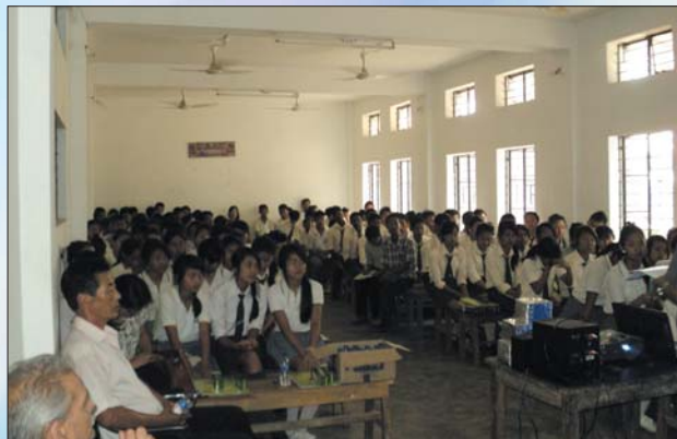
▲ Students attending the session at Vision Home Higher Secondary School, Dimapur, Nagaland.