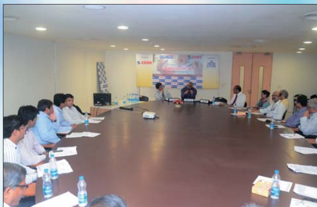
▲ The session in progress.