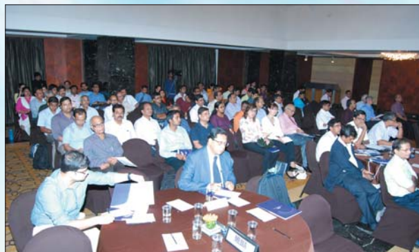
▲ The packed hall.

The programme was a grand success with about 120 invitees from industry, academia, legal fraternity and others. The feedback received from the invitees suggests it was a very relevant programme.