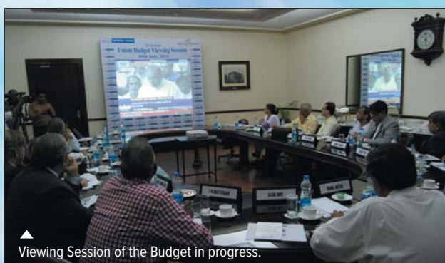
▲ Viewing Session of the Budget in progress.