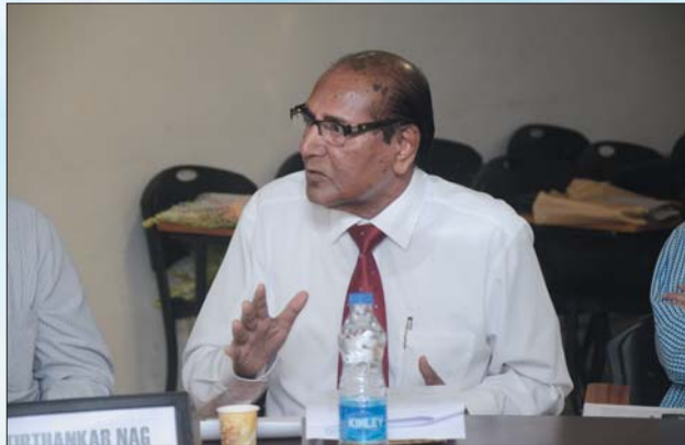
▲ A Question.