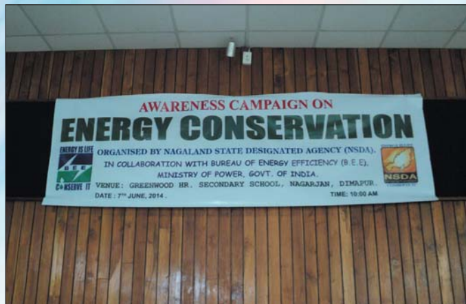
▲ Banner displayed inside the auditorium of the Greenwood Higher Secondary School, Dimapur, Nagaland.