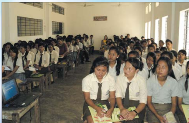
▲ Section of the students at Vision Home Higher Secondary School.