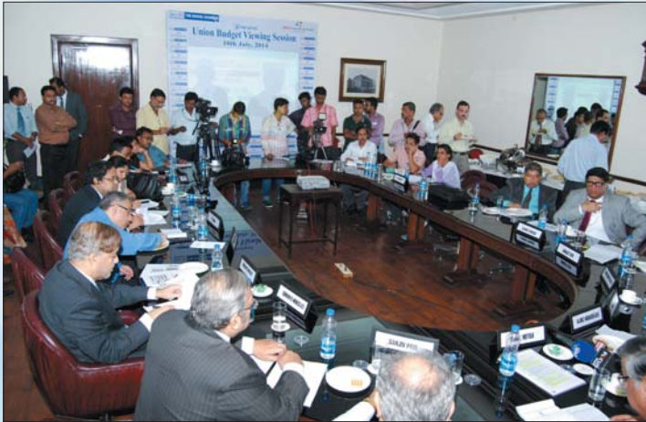
Media interaction in progress