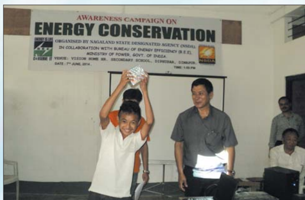
▲ A student of Vision Home Higher Secondary School receiving the award during the quiz.