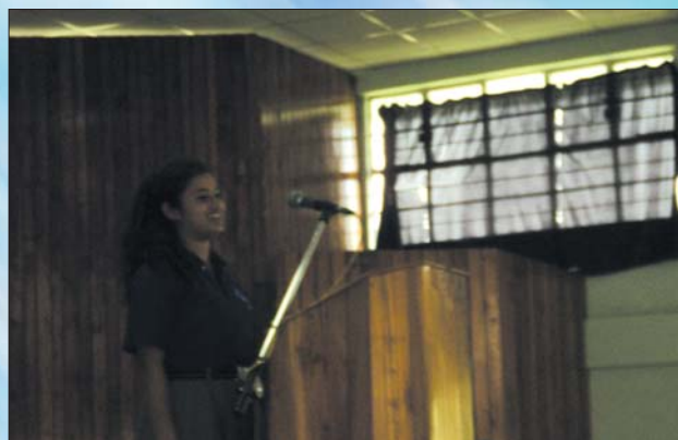
▲ A student from the Greenwood Higher Secondary School participating during the Quiz.