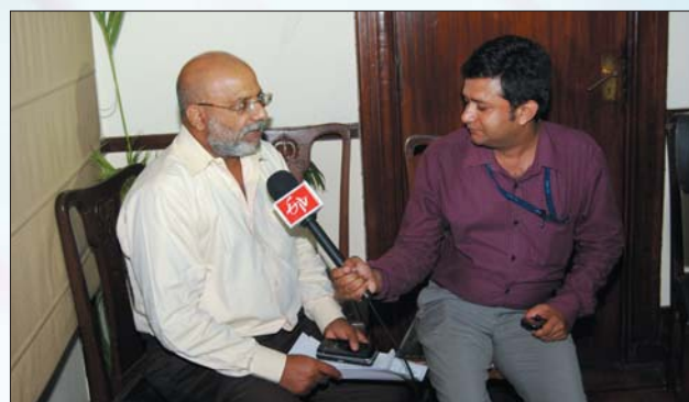
▲ Media interaction in progress