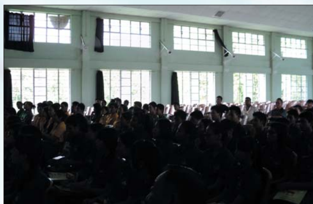
▲ Section of the students during the programme.