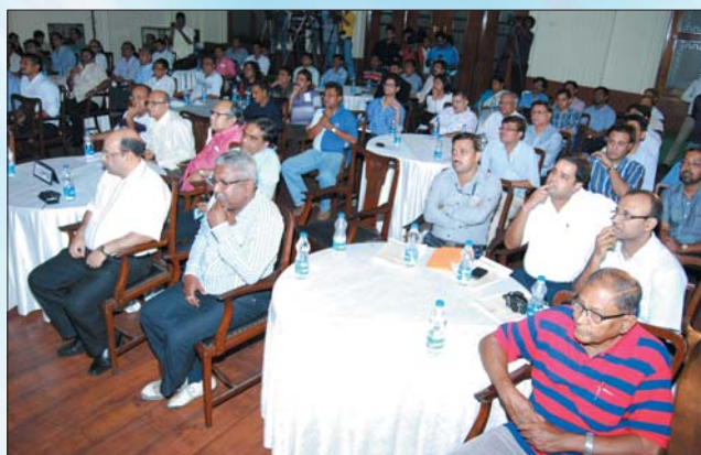
▲ A section of the audience enjoying the discussion.