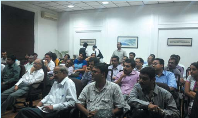
▲ The participants.

The session was a huge success with over 50 persons participating. The delegates were Company Secretaries in employment and in practice, Chartered Accountants, Bankers and Registrar and Share Transfer Agents.