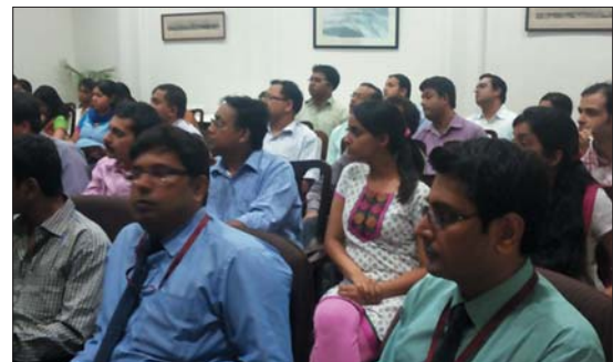
▲ A section of the participants.