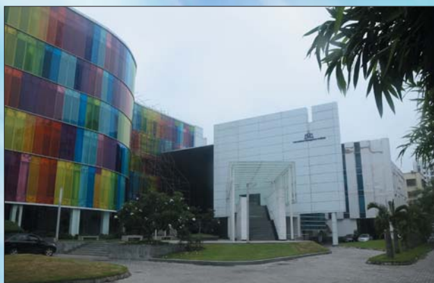
▲ The IMI Campus