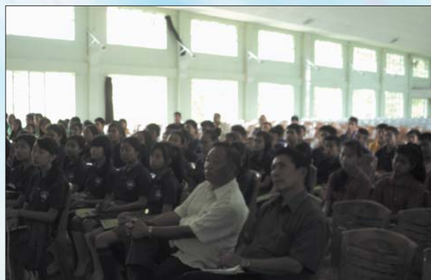
▲ Students and Dignitaries attending the session.