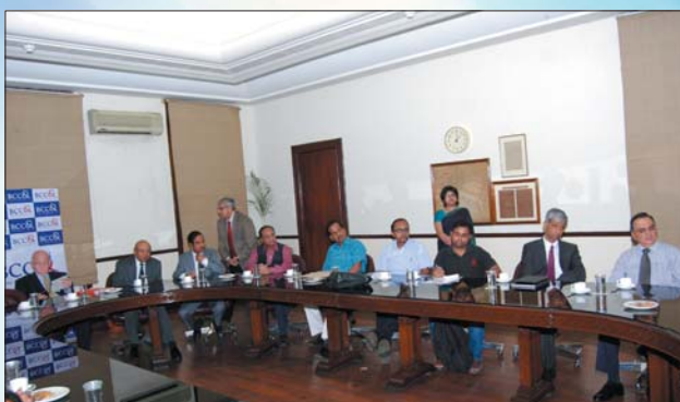
▲ Press Conference