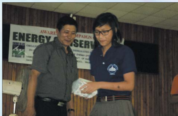
▲ A student receiving prize for giving the right answer during the Quiz.