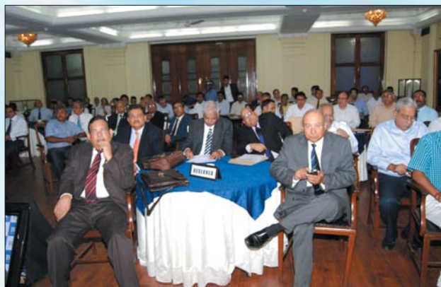
▲ The delegates present in the seminar.

The seminar has helped the Chamber to work out an issue-based action plan based on which further initiatives could be taken for bringing developments in Coastal Shipping in India, which would provide immense benefit to the shipping industry and especially to those industries which are end users of coastal shipping.