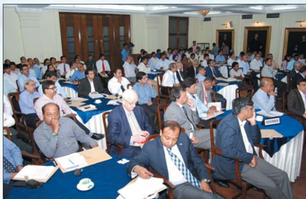
▲ The delegates present in the seminar.