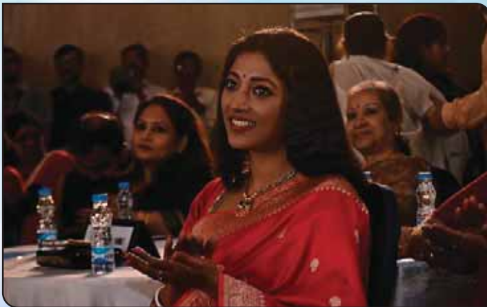
Ms. Paoli Dam at the award ceremony