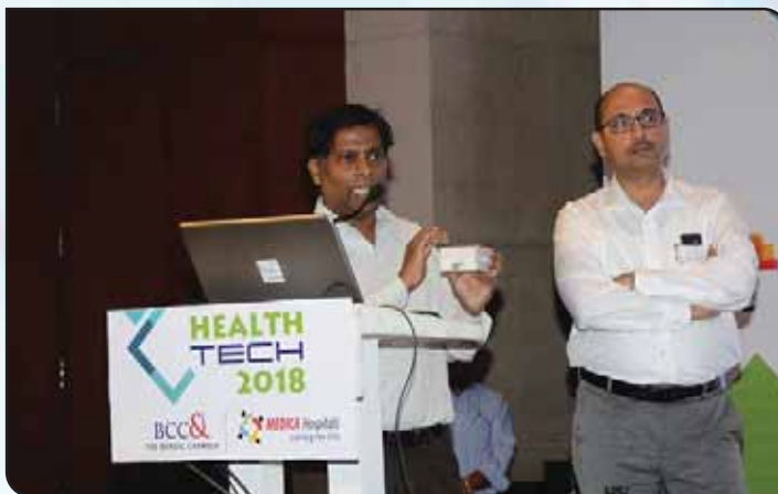
Finalist of Health Hack making presentations in front of audience and Jury Members