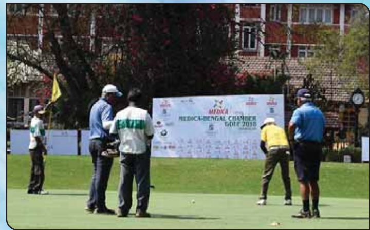
Participants playing during the tournament