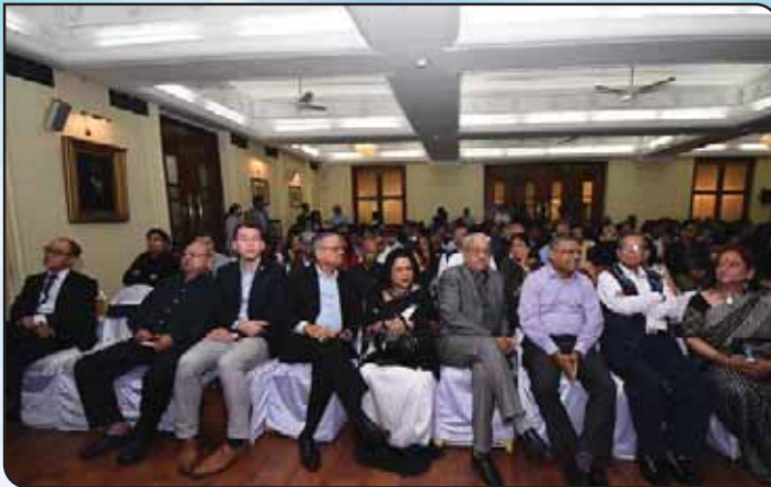
Audience at the session