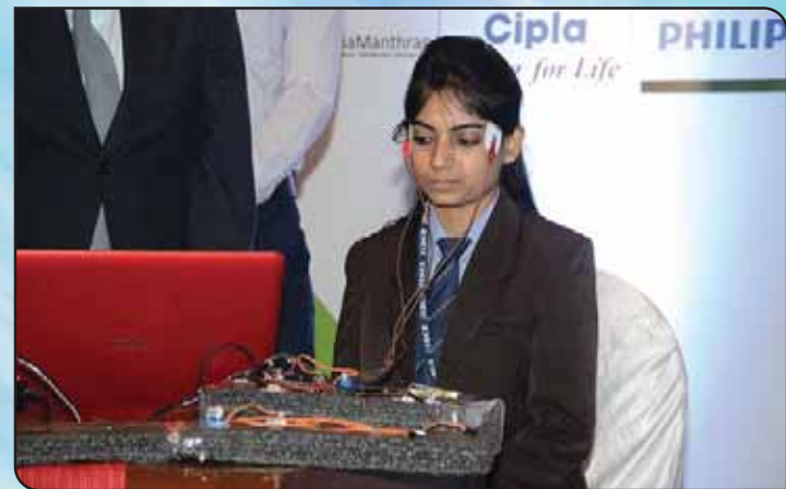
Finalist of Health Hack making presentations in front of audience and Jury Members