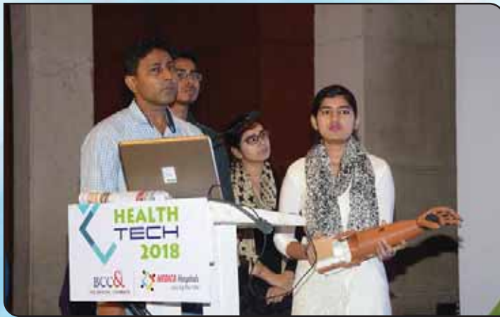
Finalist of Health Hack making presentations in front of audience and Jury Members

8th-11th March 2018, Hyatt Regency, Kolkata