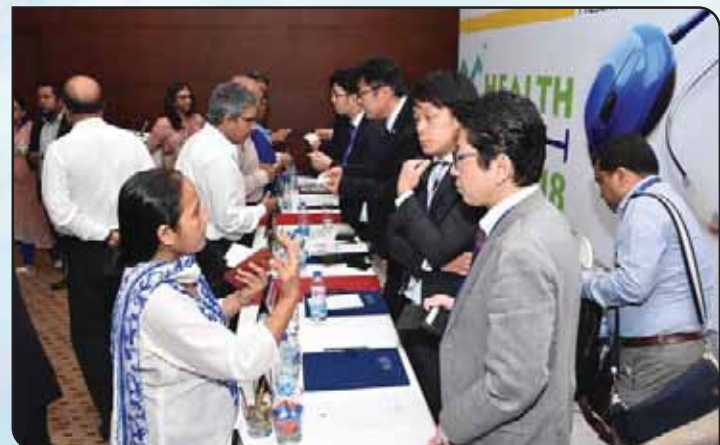
B2B Interaction in progress.