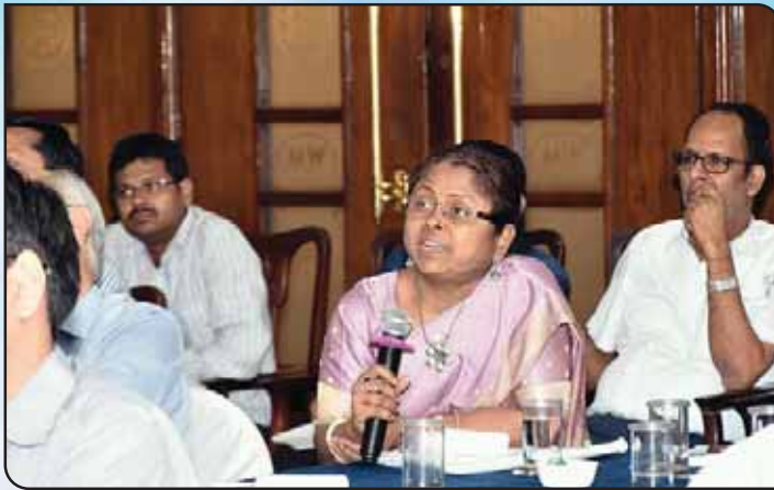
Q/A Session in progress