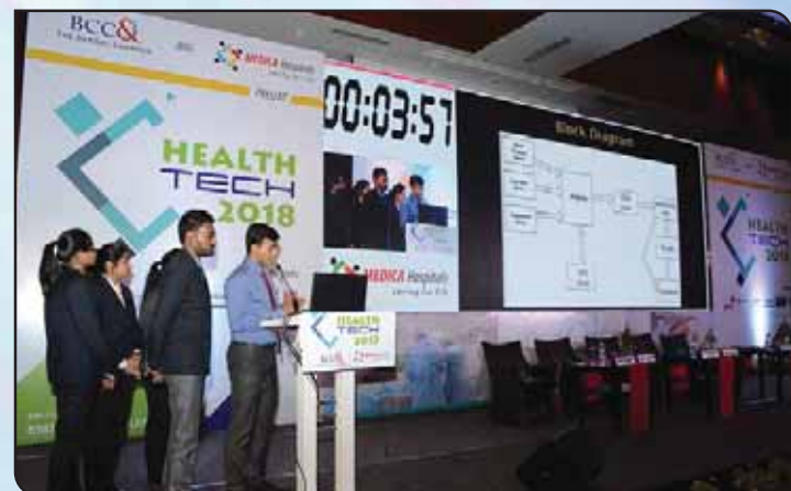
Finalist of Health Hack making presentations in front of audience and Jury Members