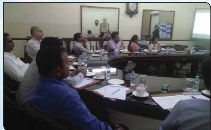
Participants at the Training Session on Indirect Taxation