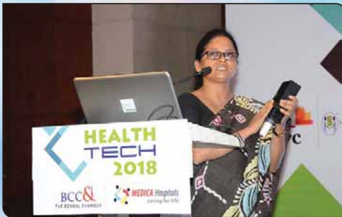
Finalist of Health Hack making presentations in front of audience and Jury Members