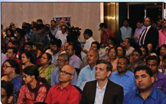
Audience at the programme