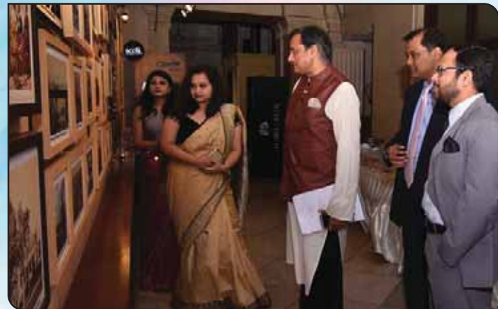
Dr. Shashi Tharoor taking a look around the Calcutta Gallery