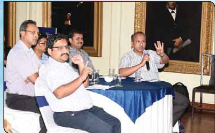
Q/A Session in progress