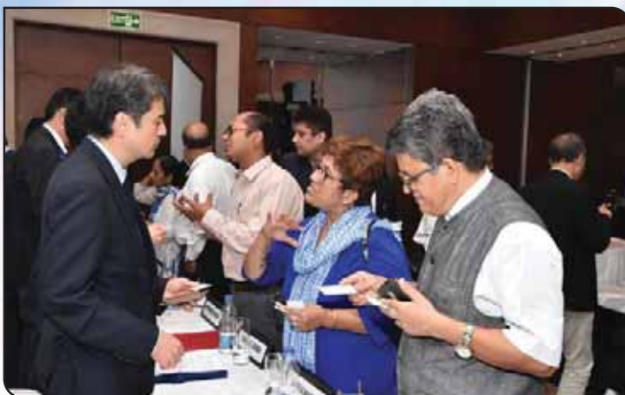
B2B Interaction in progress.