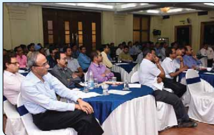
Audience at the Seminar