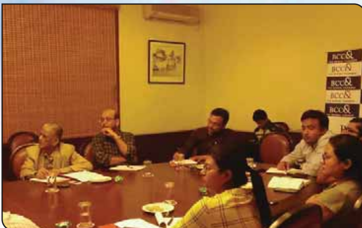
Participants at the Training Session on Indirect Taxation