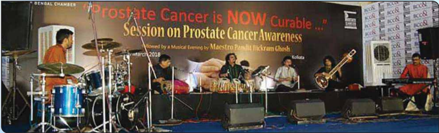
Performance by Maestro Pandit Bickram Ghosh and his team