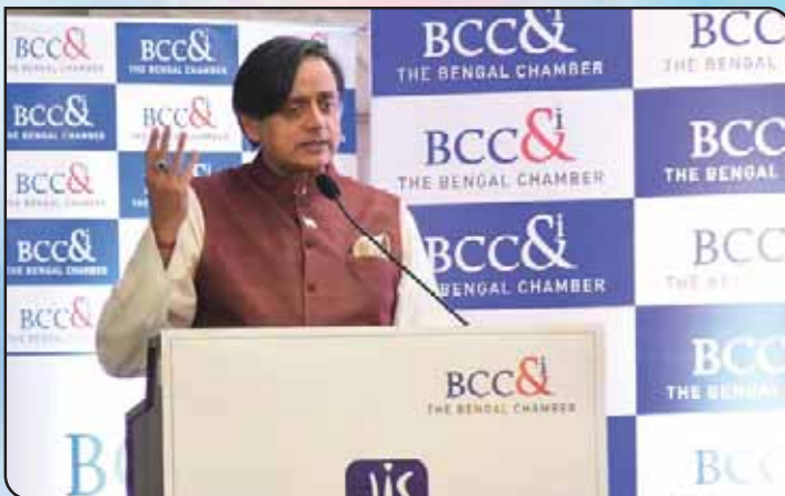
Dr. Shashi Tharoor, Member of Parliament representing Thiruvananthapuram and Chairman of the Parliamentary Standing Committee on External Affairs addressing the gathering