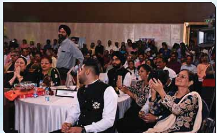
Audience and guests at the programme