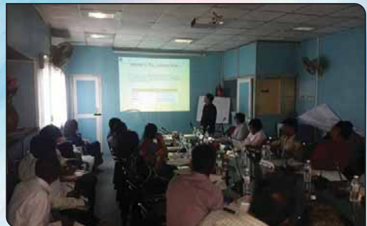
Section of Delegates

The Bengal Chamber of Commerce in association with MSMSE-DI organized an awareness programme for MSMEs titled “Awareness Programme on Intellectual Property Rights (IPRs)” on 9th March 2018 at MSME-DI Campus Kolkata. The objective of this awareness programme was to sensitize MSMEs of West Bengal regarding the new laws for subsidy on IPR and how they could apply for the patent, copyright, trademark and GI. Representative of Government Institution also spoke how MSMEs could be able to get certificate after sample test of their products. Through the interactive session of this programme, MSME-DI provided necessary information about IPRs and how IPRs can play an important role for the MSME fraternity.