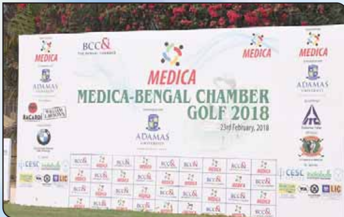
Backdrop of the Event

MEDICA - BENGAL CHAMBER GOLF TROPHY IN ASSOCIATION WITH ADAMAS UNIVERSITY, SEASON-7