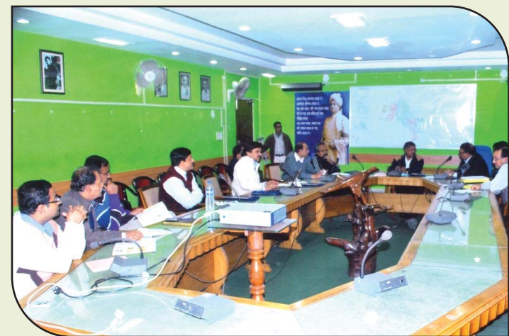
▲ Bengal Chamber and SJDA Representatives

Representatives from SJDA talked about the role and activities of their organization in driving development in North Bengal. They also made an