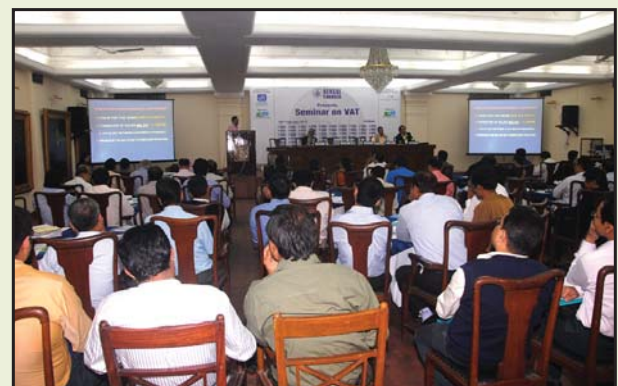
▶ Seminar in progress.