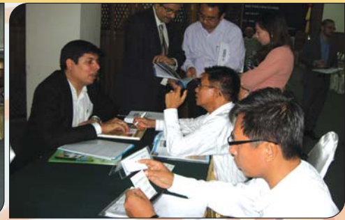
▲ B2B meeting at UMFCFI, Yangon