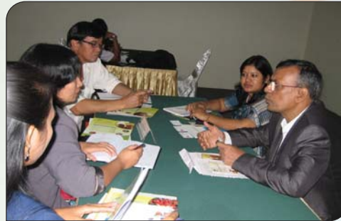
▲ B2B meeting at UMFCFI, Yangon