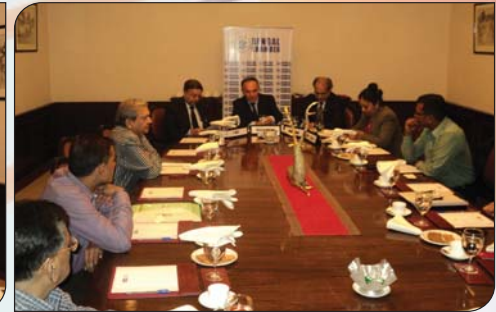
▲ Delegates present at the Interactive Session