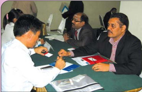
▲ B2B meeting at UMFCFI, Yangon