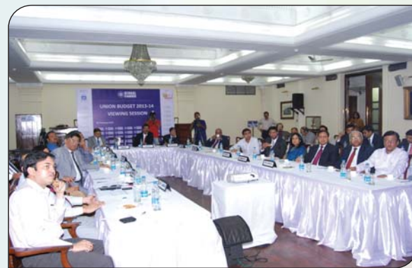
◀ Budget Viewing in progress