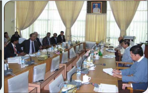
▲ Meeting with Ministry of Commerce, Govt. of Myanmar in NPT