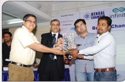
▲ Winners receiving the trophy