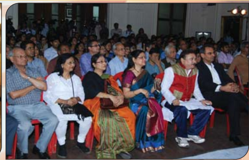
▲ Section of audience along with Shri Madan Mitra, Minister-in-Charge, Departments of Sports and Transport, Government of West Bengal