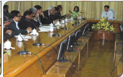
▲ BCCI Delegation with H.E Mr. Aye Myint, Union Minister of Industry, Myanmar