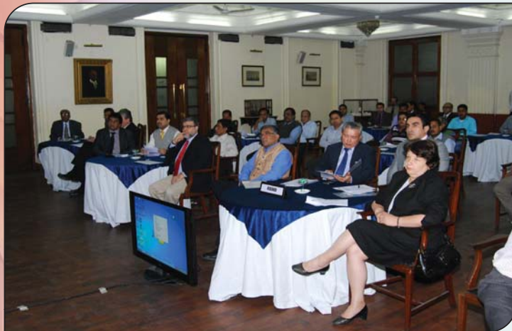
▲ Delegates who attended the India Eurasia Business Partnership Seminar