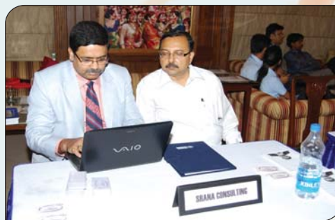
▲ Sponsor – Srana Consulting

Education sector. The sponsors made presentations of their products that were being increasingly used in Education in place of the now dated terms like Education Technology; Computer based education and Technology-Enhanced Learning. Different administrative modules that could be used in schools, colleges and institutions were also showcased by the sponsors.