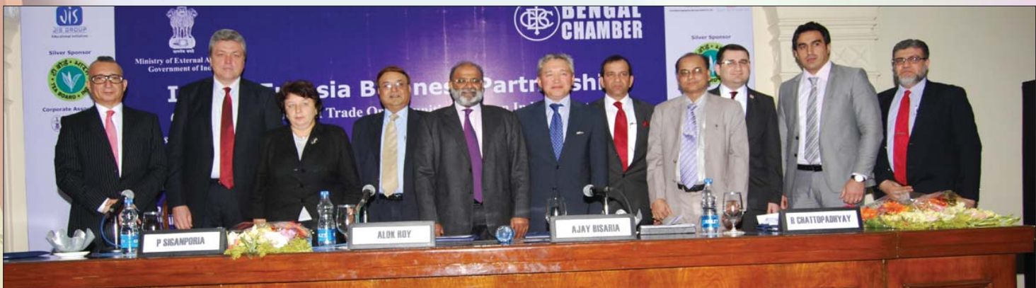
▲ All the dignitaries of the Seminar