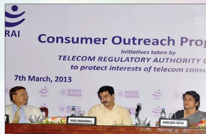
Senior officials from TRAI, Telecom Service Providers and Retail Customers actively participated in this interactive session.