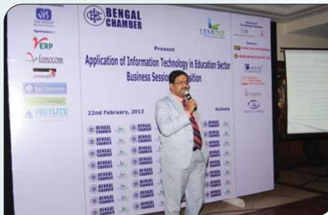
▲ Product presentation by a Sponsor