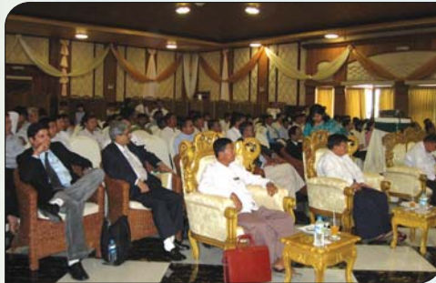
▲ Delegates attending the BCCI Seminar in Mandalay