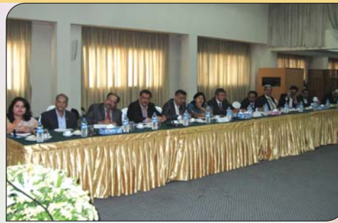
▲ Indian Delegation at UMFCFI, Yangon