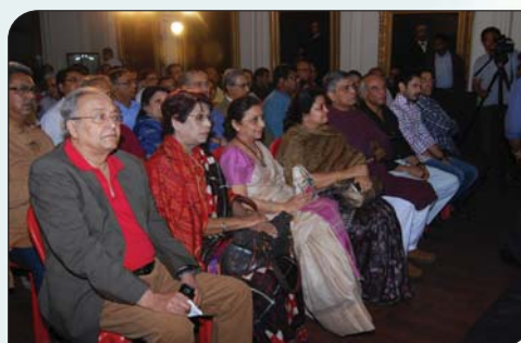
▲ Panelists and their family members along with the audience