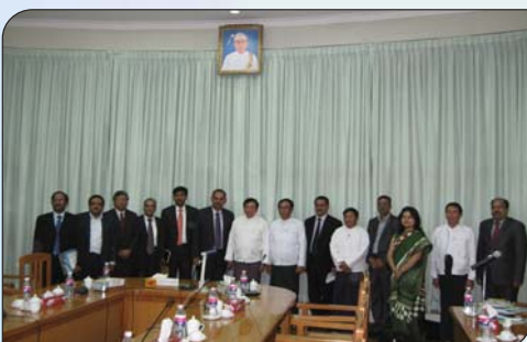
▲ BCCI Delegation with the Union Minister of Construction, Myanmar