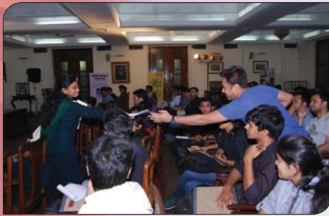
▲ Audience winning prize