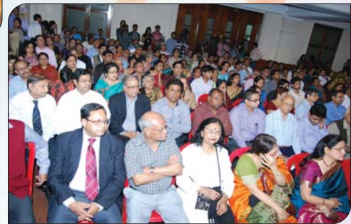
▲ Section of the audience