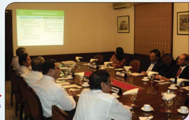
▶ The meeting in progress