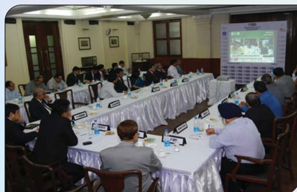
◀ Budget Viewing in progress