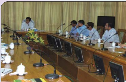
▲ Meeting with Hon'ble Minister of Industry and other senior officials of the department