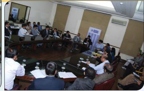
▲ Discussion in progress on Chamber's reaction on the Budget