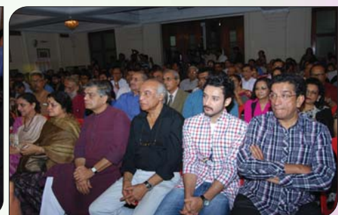
▲ Panelists seated with the audience