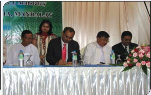
▲ MOU signed between BCCI & Monywa Chamber