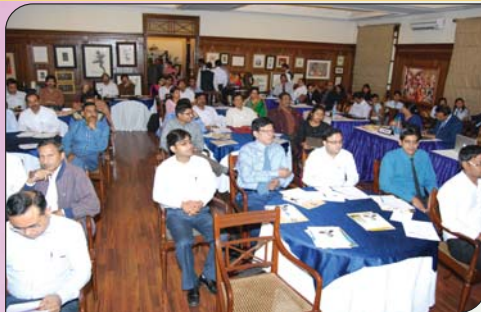
▲ Audience at the B2B meet

The Bengal Chamber of Commerce and Industry in association with Lemenz organized a B2B meet, 'Application of Information Technology in Education – Business Session & Exposition' on 22nd February, 2013 at The Palladian Lounge. It was