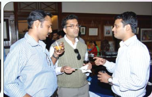
▲ Networking Cocktails