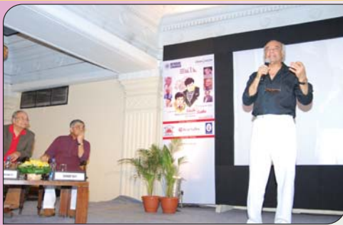
▲ (L-R) Shri Soumitra Chattopadhyay, Shri Sandip Ray and Shri Barun Chanda during the adda