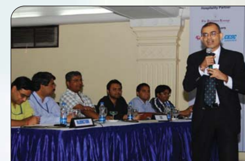
▲ During the Final Round

away from the more familiar general and business quizzes, which makes it all the more interesting and enjoyable.