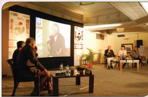
▲ During the adda