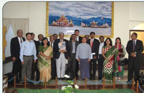
▲ BCCI Delegation with H.E Dr Pwint San, Deputy Minister of Commerce, Myanmar