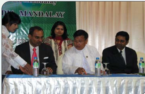
▲ MOU Signed between BCCI & Mandalay Chamber