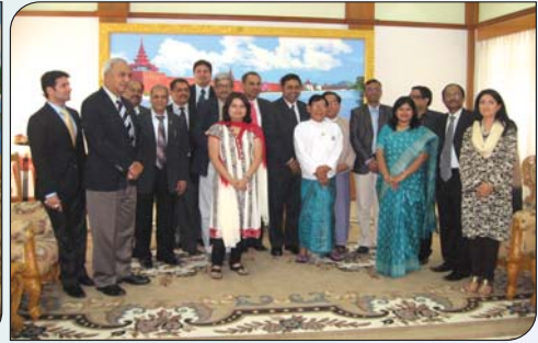
▲ The delegation with the Mayor of Mandalay