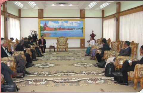
▲ Meeting with H.E Aung Moun, Hon'ble Mayor & Minister for Development Affairs of the Mandalay Region

20TH - 23RD FEBRUARY 2013, YANGON, NPT, MANDALAY