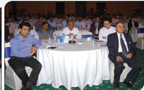
▲ The audience