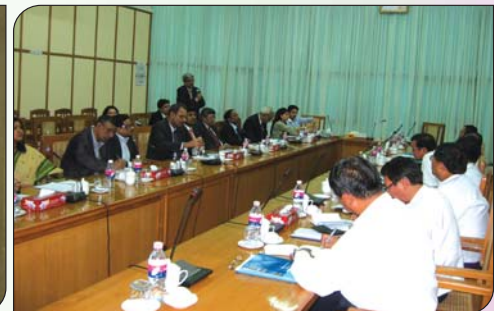
▲ Meeting with H E Mr. Kyaw Lwin, Union Minister of Construction & Department officials in NPT