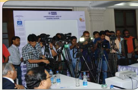
▲ Media Set Up