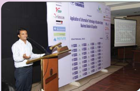
▲ Product presentation by a Sponsor

The product presentation was followed by networking cocktails. The B2B meet was a resounding success and was attended by faculty members, administrative heads of different schools, colleges and institutes of Kolkata and around.