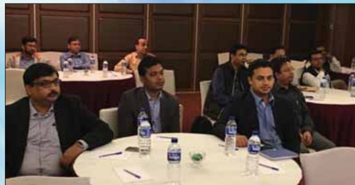
Participants attending the session

25th January 2017 BD Block Auditorium, Salt Lake, Kolkata