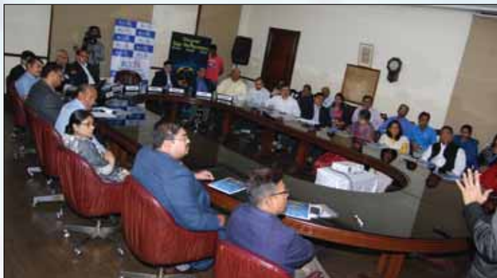
Participants attending the session