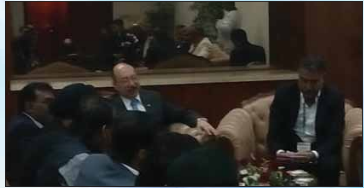
Meeting of The Bengal Chamber Delegation with Shri Harsh Vardhan Shringla, High Commissioner of India to the People's Republic of Bangladesh