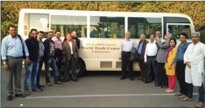
Members of BCC&I Delegation - on arrival at the Chittagong airport