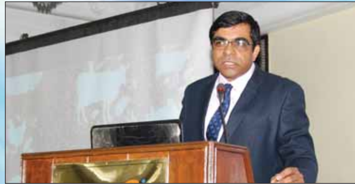
An Applicant under the Steel and Manufacturing Category making his presentation