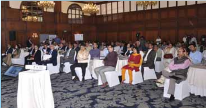
Participants at Metals 2017