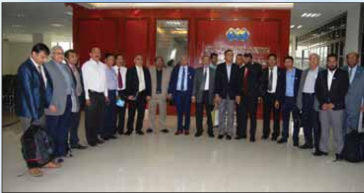
Members of The Bengal Chamber Delegation at World Trade Centre, Chittagong