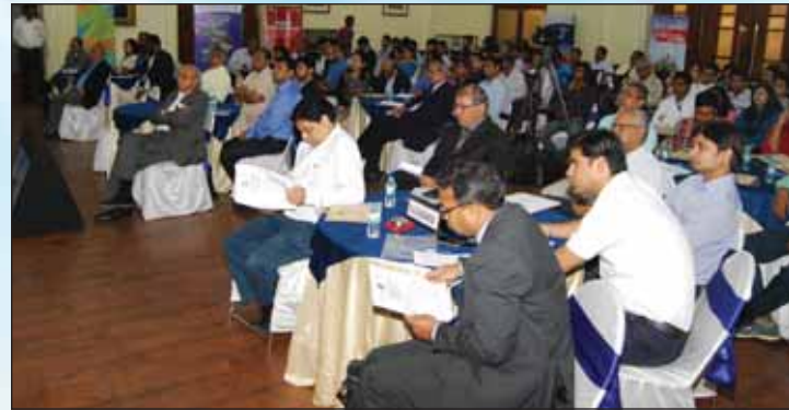
Delegates present on Day 1 of the Conclave