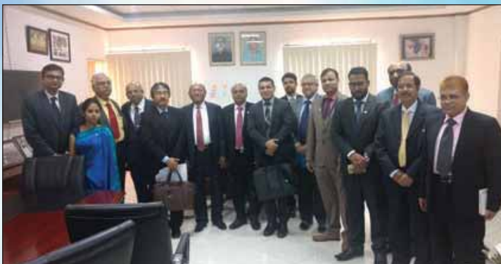
Members of BCC&I Delegation with Janab Tofail Ahmed, Hon'ble Commerce Minister, People's Republic of Bangladesh