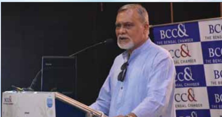
Shri Apurba Mukherjee, Hon'ble Mayor, Durgapur Municipal Corporation