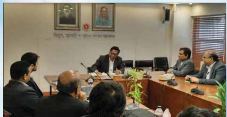
Meeting of The Bengal Chamber Delegation with Janab Nasrul Hamid, Hon'ble State Minister, Power Division-Ministry of Power Energy & Mineral Resources