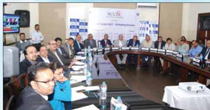
Viewing Session of the Union Budget 2017 – 18 in progress