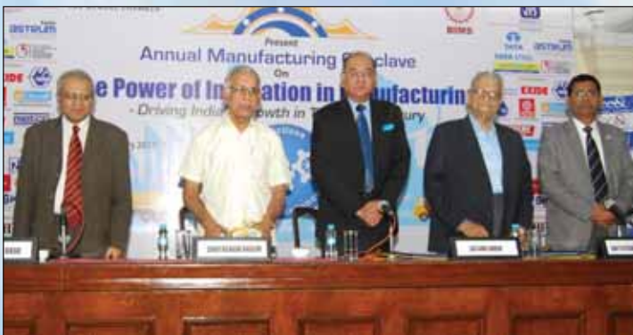
A group photo of the Panelists