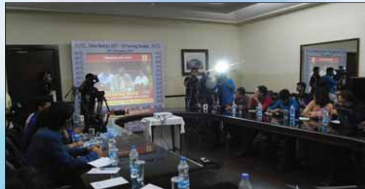
Viewing of Speech of Dr. Amit Mitra, Hon'ble Finance Minister of West Bengal, in progress