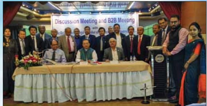
The members of BCC&I Delegation with the President and other members of FBCCI