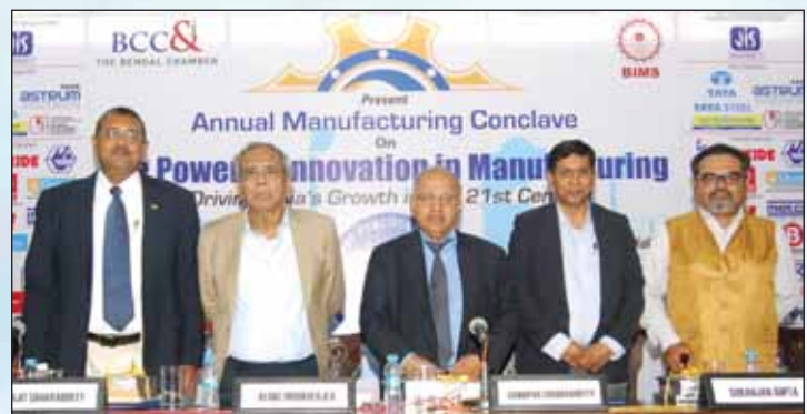
A group photo of the Panelists