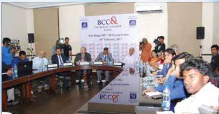
The attendees taking note of the Hon'ble FM's speech during the viewing session