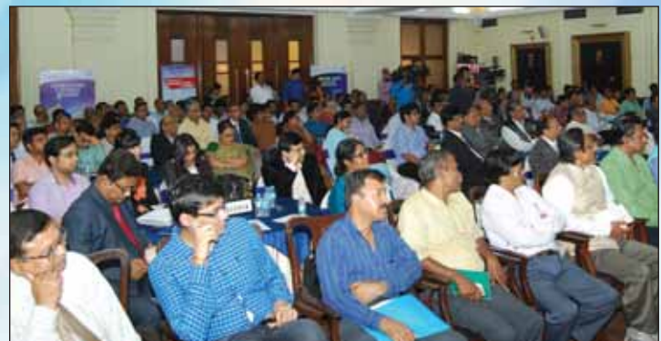
Delegates present on Day 2 of the Conclave