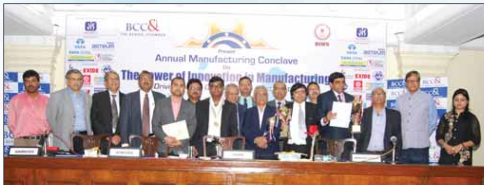
A group photo of the BCC&I and BIMS Annual Manufacturing Conclave