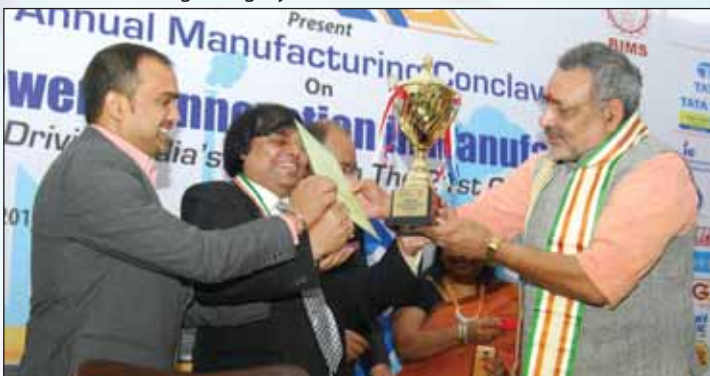
Shri Giriraj Singh presenting the Winning Trophy and the Certificate of Best Case Study Presentation to one of the award winners under the Service Category