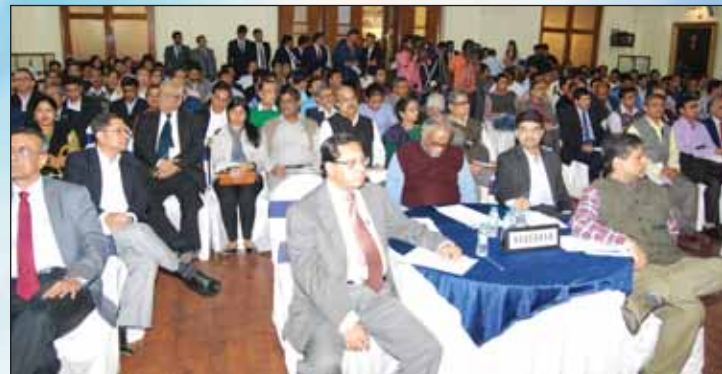
Audience at "Union Budget 2017 -18: An In-depth Analysis"