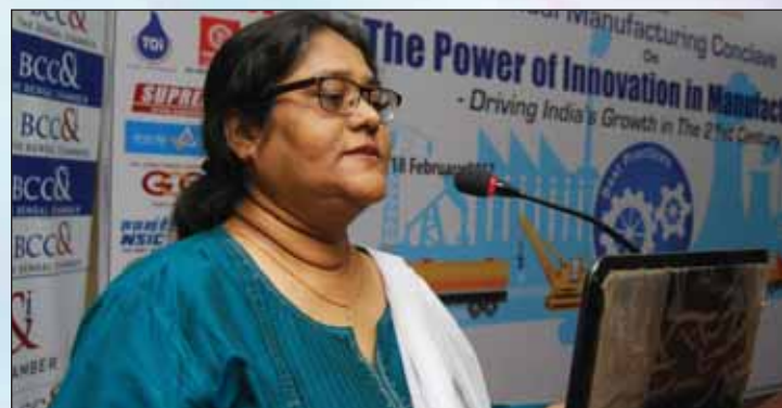
An Applicant under the Service Category making his presentation