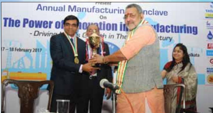
Shri Giriraj Singh presenting the Winning Trophy and the Certificate of Best Case Study Presentation to one of the award winners under the Steel and Manufacturing Category