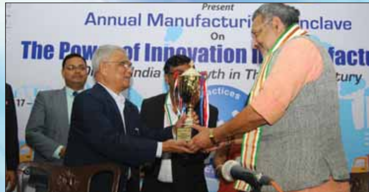
Shri Giriraj Singh presenting the Winning Trophy and the Certificate of Best Case Study Presentation to one of the award winners under the Steel and Manufacturing Category