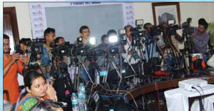
Media Interaction in progress