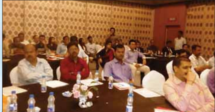
Q/A Session in progress