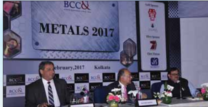
Opening Session of Metals 2017