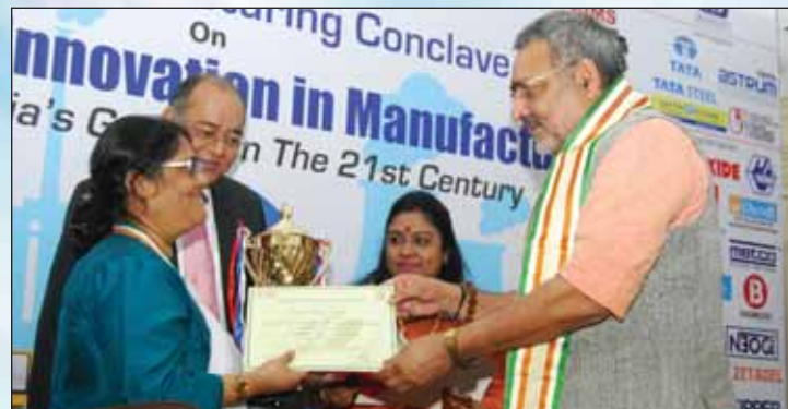
Shri Giriraj Singh presenting the Winning Trophy and the Certificate of Best Case Study Presentation to one of the award winners under the Service Category