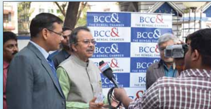
Shri Arup Roy, Hon'ble Minister-in-Charge, Department of Cooperation, Government of West Bengal interacting with Media