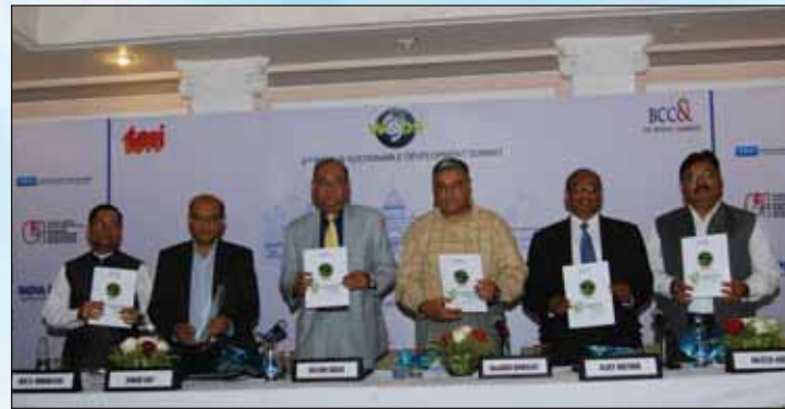
Release of Chamber's publication "Environmental Appraisal and Planning - A Treatise"