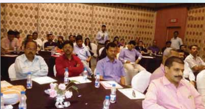
Q/A Session in progress