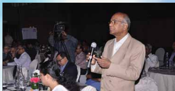
Interaction with the participants in the Session on "Demand for Indian Iron & Steel Industry: Overview & Road Ahead from PSU's Perspective"