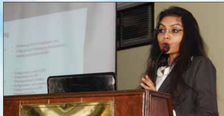
An Applicant under the Service Category making his presentation