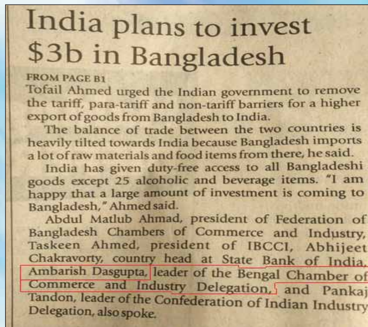
The BCC&I Delegation, found good coverage in Bangladeshi media