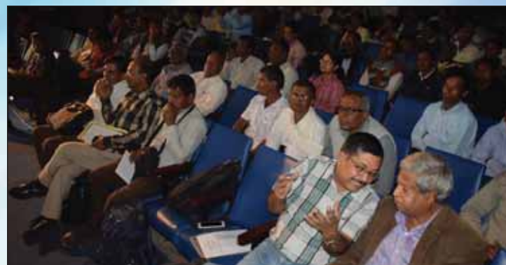
Section of Audience