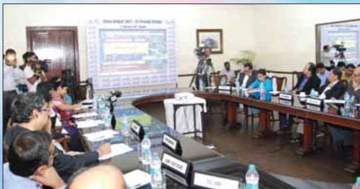
Viewing Session of the Union Budget 2017 – 18 in progress