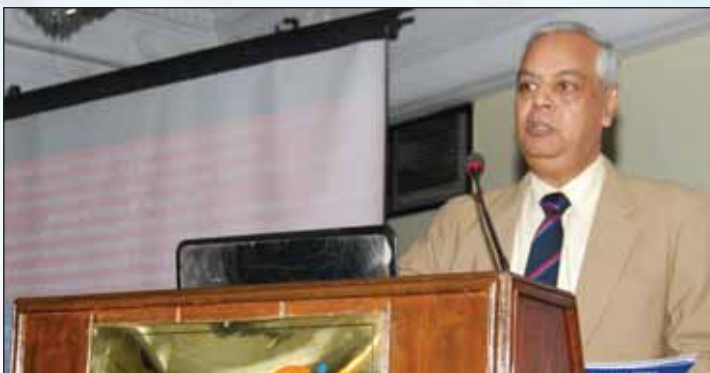
An Applicant under the Steel and Manufacturing Category making his presentation