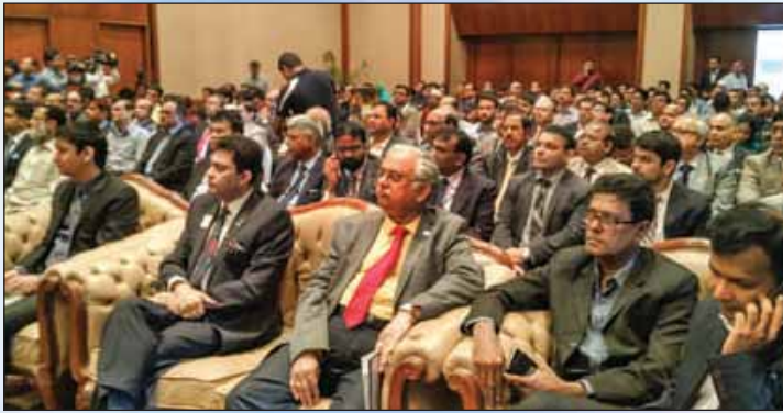
A section of audience with the BCC&I Delegation members at the Inaugural Ceremony of Indo Bangla Trade Fair