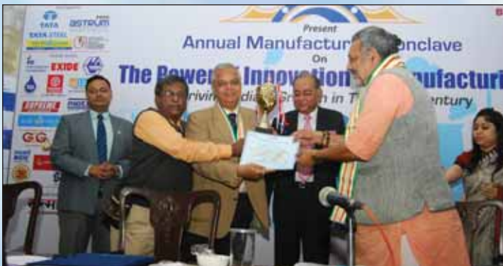
Shri Giriraj Singh presenting the Winning Trophy and the Certificate of Best Case Study Presentation to one of the award winners under the Steel and Manufacturing Category