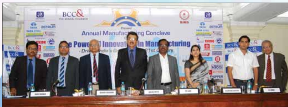
A group photo of the Panelists