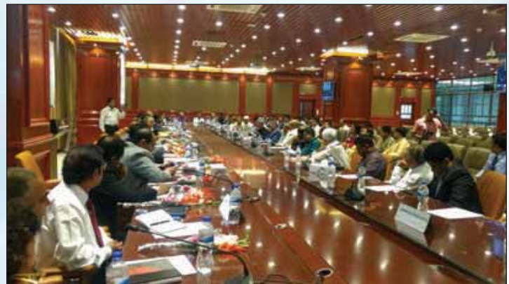
B2B Meeting with Chittagong Chamber of Commerce in progress