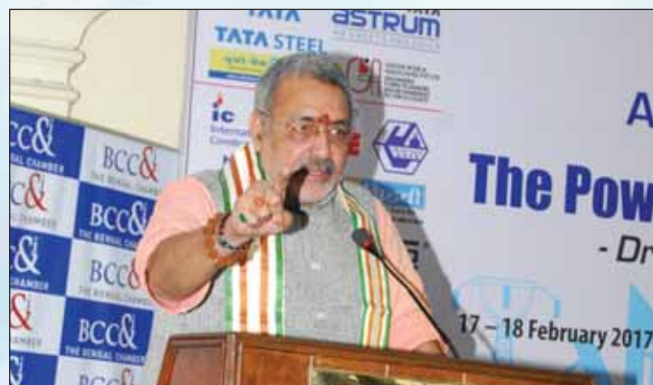
Shri Giriraj Singh addressing the audience