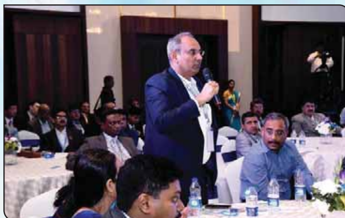
Interaction in progress