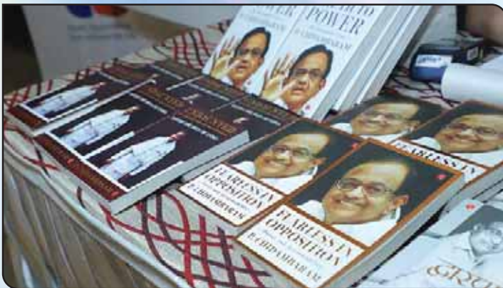
Shri P. Chidambaram's books on display at the venue

"UNDAUNTED" – SAVING THE IDEA OF INDIA: THE BOOK LAUNCH OF SHRI P. CHIDAMBARAM