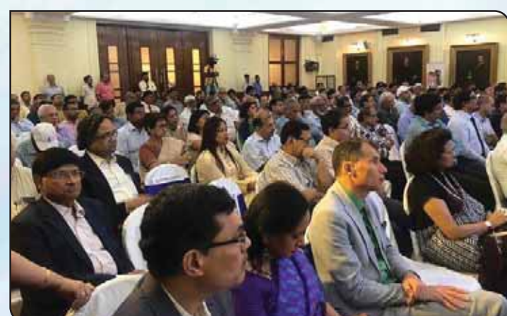
Audience at the session