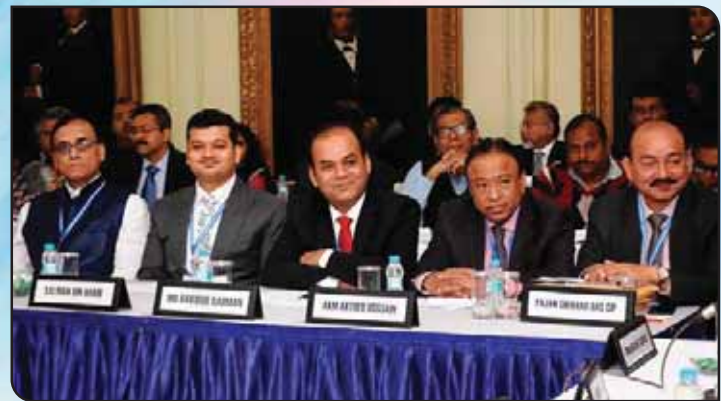
Delegate members of The Chittagong Chamber of Commerce and Industry