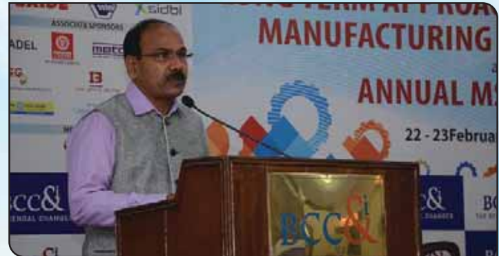
Air Chief Marshal Arup Raha, PVSM, AVSM, VM, ADC addressing the session