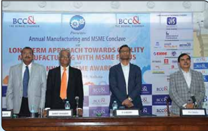
A group photo of the Session Speakers