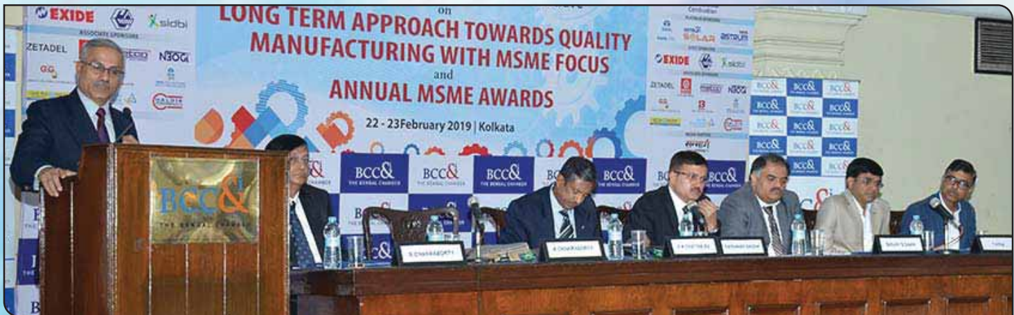
Lt. General Aniruddha Chakraborty, (Retd), Indian Army, Ministry of Defence, Government of India addressing the session

22 nd - 23 rd February 2019, Chamber Premises