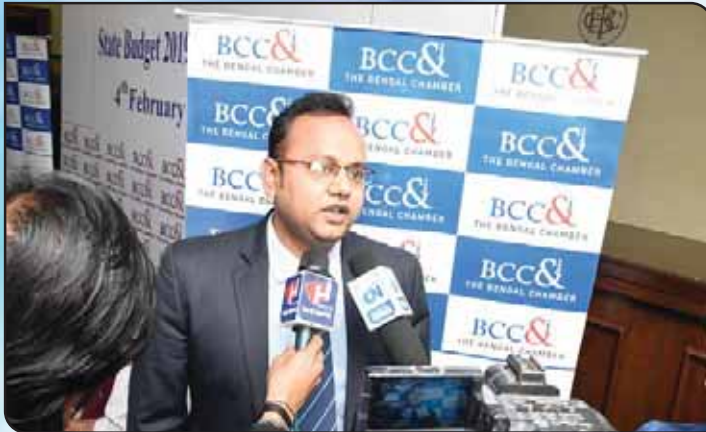
Media Interaction in progress