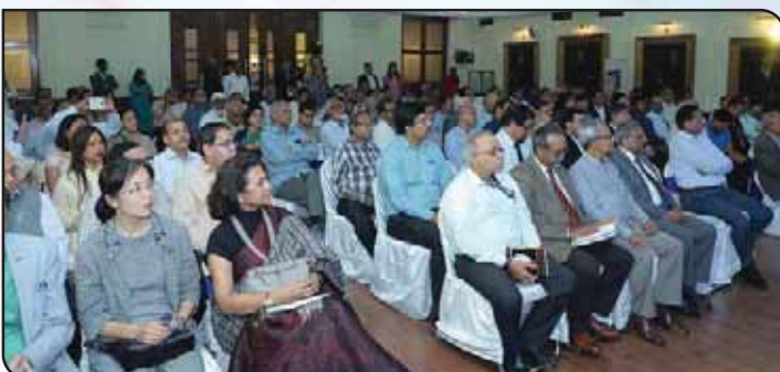
Audience at the session