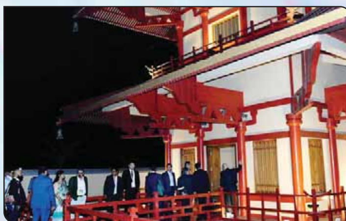
Japanese delegate members at Japanese Forest, ECO Park, Kolkata