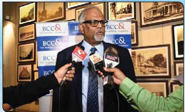
Media Interaction in progress