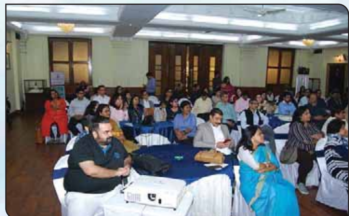
A section of audience