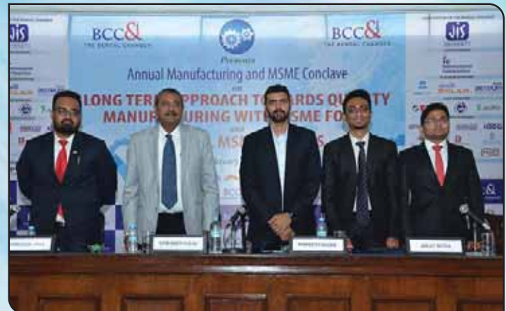
A group photo of the session speakers