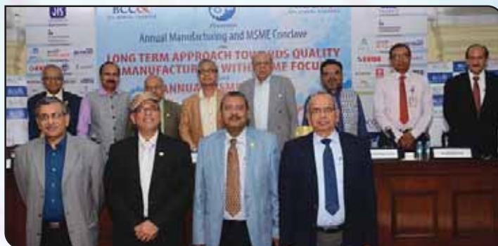
A group photo of the valedictory speakers and the judges of the programme