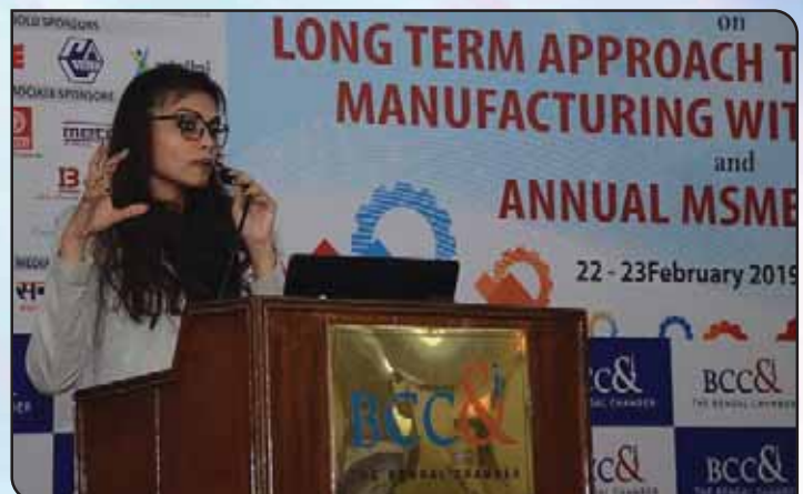
An applicant making a presentation under the Service Category for The Bengal Chamber MSME Excellence Awards 2019