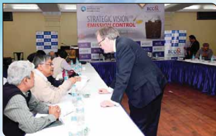
Group Discussion in progress during the workshop