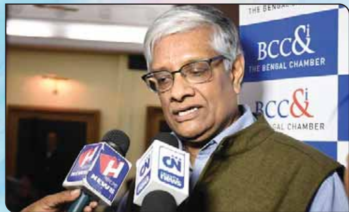
Media Interaction in progress