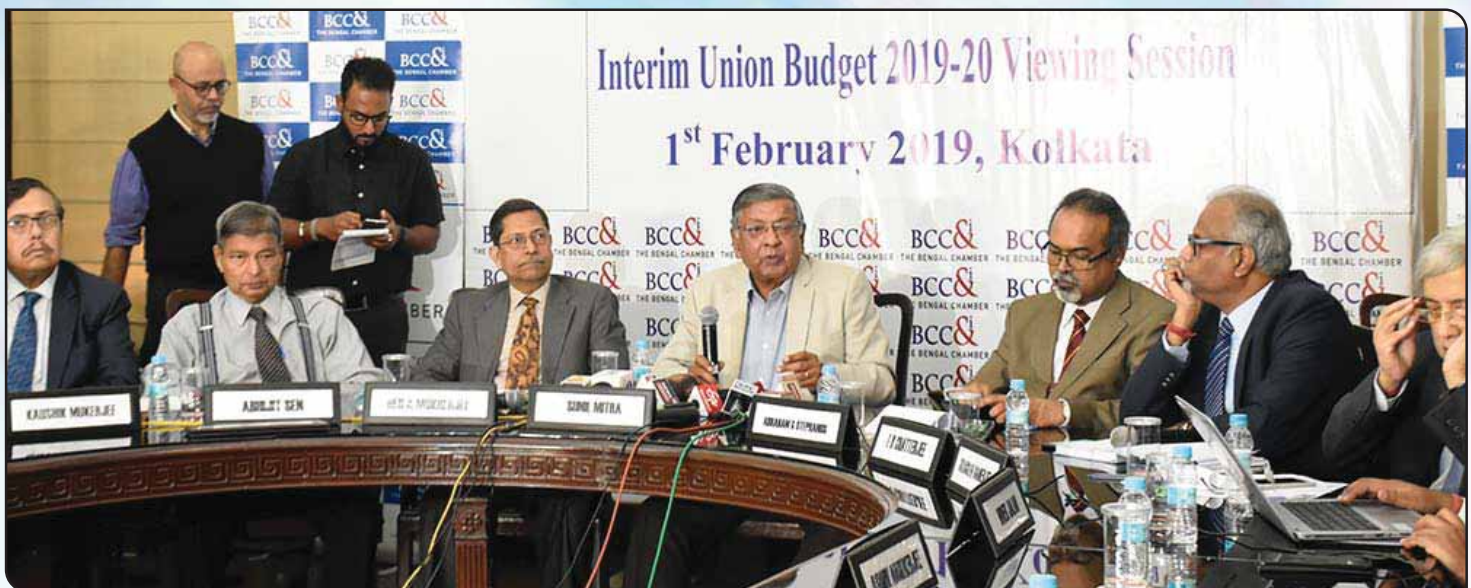
Media Interaction in progress