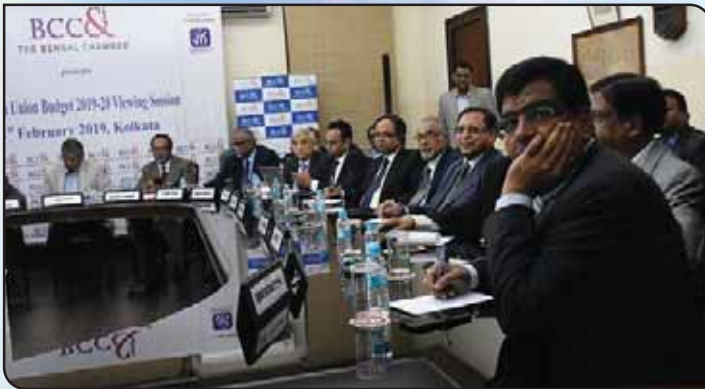
Interim Union Budget 2019-20 Viewing Session in progress

INTERIM UNION BUDGET 2019-20 VIEWING SESSION