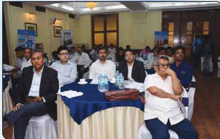
Delegates present in the programme