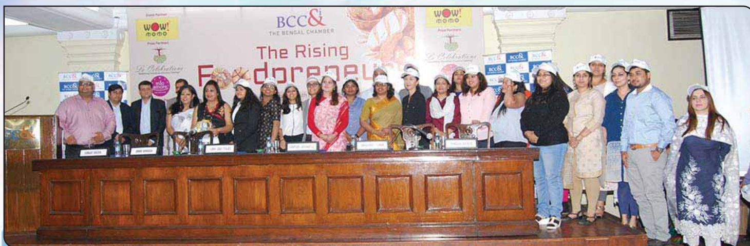
Photo Session of the Internal & External Juries with the participating Foodpreneurs