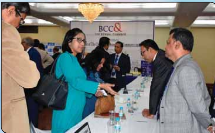
B2B meeting in progress