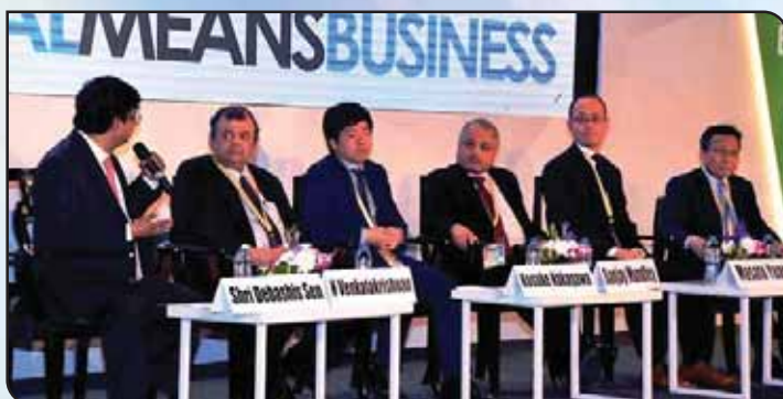
Panel discussion in progress

JAPAN COUNTRY SESSION AT BENGAL GLOBAL BUSINESS SUMMIT (BGBS) 2019