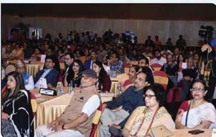
Audience at the program