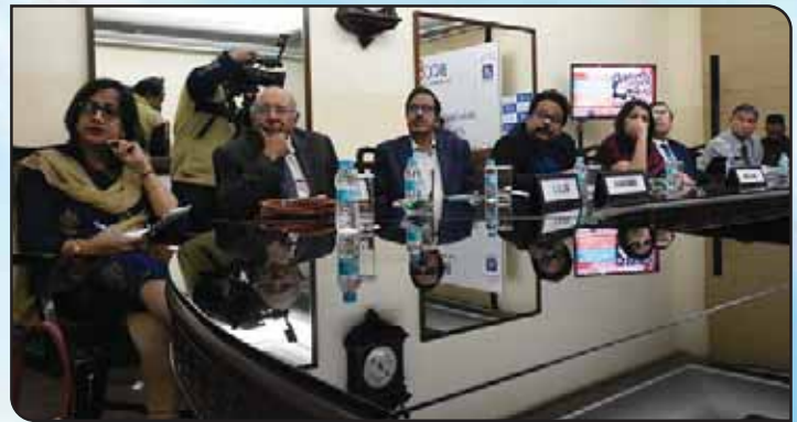
Interim Union Budget 2019-20 Viewing Session in progress