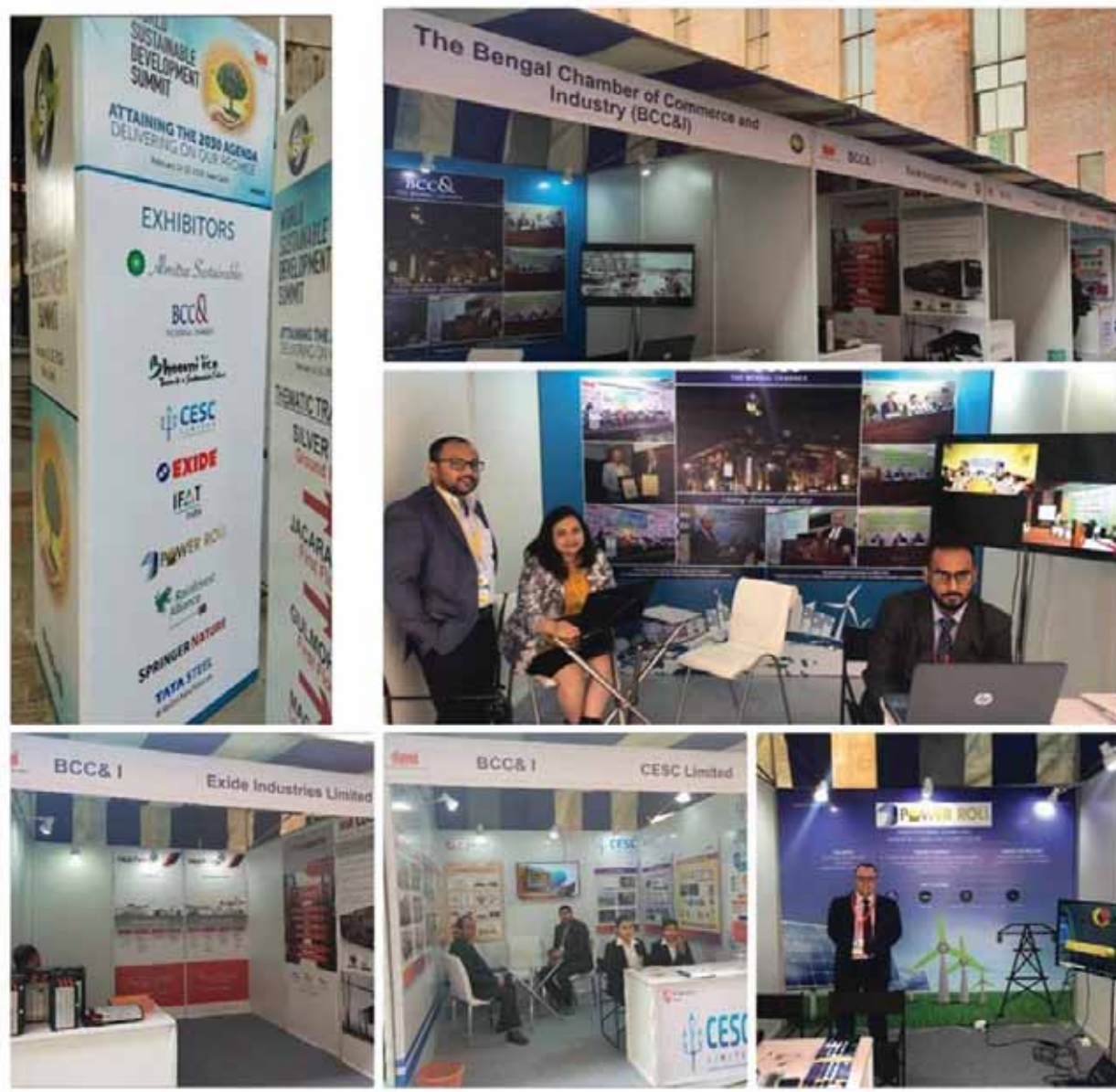
The Bengal Chamber along with Exide, CESC, Power Roll Pavilion at The World Sustainable Development Summit (WSDS 2019) organised by TERI between Feb 11-13, 2019