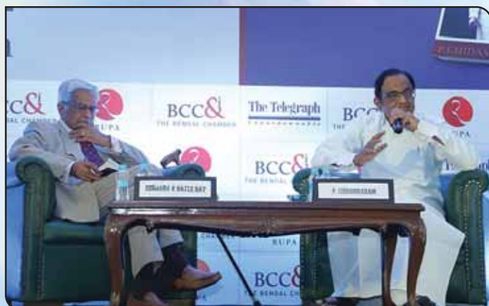
Shri P. Chidambaram, Member of Parliament, addressing the gathering

“UNDAUNTED” – SAVING THE IDEA OF INDIA: THE BOOK LAUNCH OF SHRI P. CHIDAMBARAM