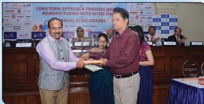
Air Chief Marshal Arup Raha, PVSM, AVSM, VM, ADC presenting The Bengal Chamber Award to Mittal Technopack Pvt Ltd, one of the winners under the Steel and Manufacturing Category