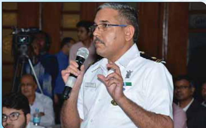
Delegates during an interaction with the speakers.

22 nd - 23 rd February 2019, Chamber Premises