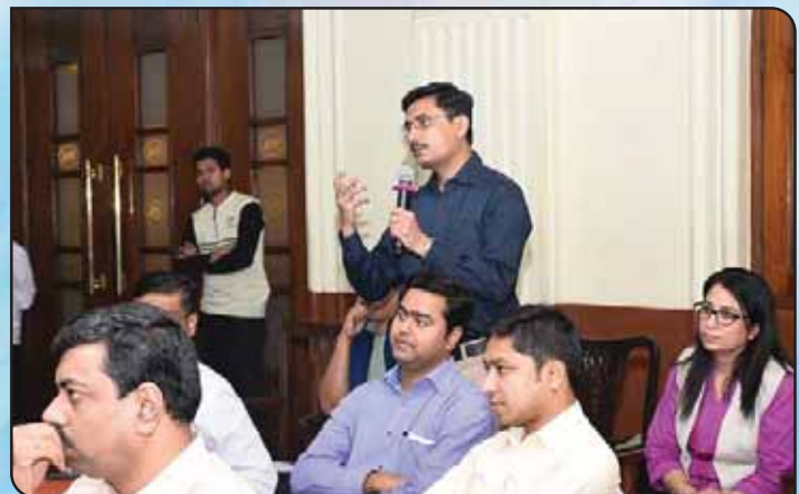
Audience at the seminar