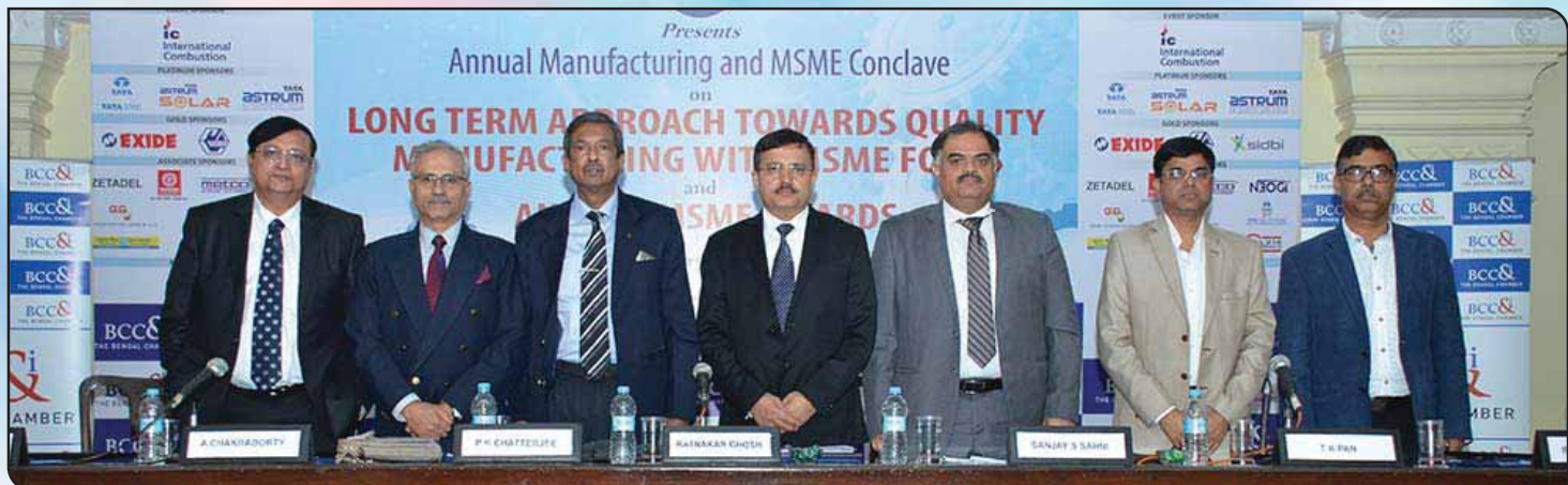
A group photo of the Panel Speakers