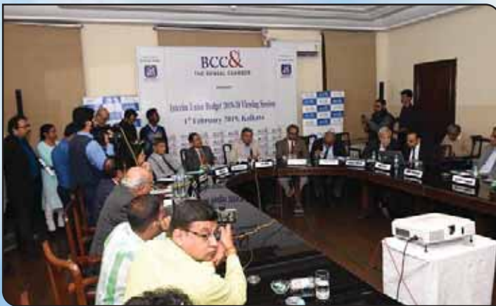
Media Interaction in progress