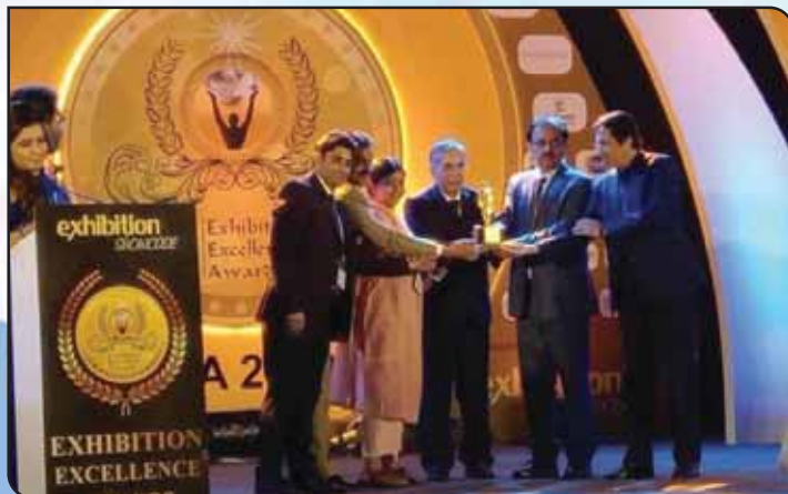
GS Marketing got the First & only Award in the Best Consumer & Houseware Category for the IIMTF, Kolkata 2018 and also for Top B city show B TO C for IIMTF, Bhubaneswar