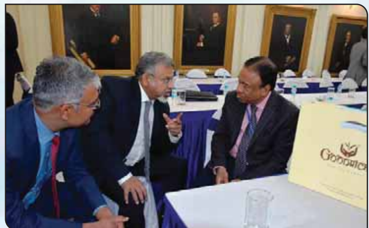
B2B meeting in progress