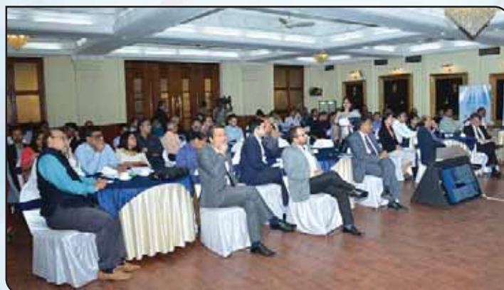
Audience during the Conclave