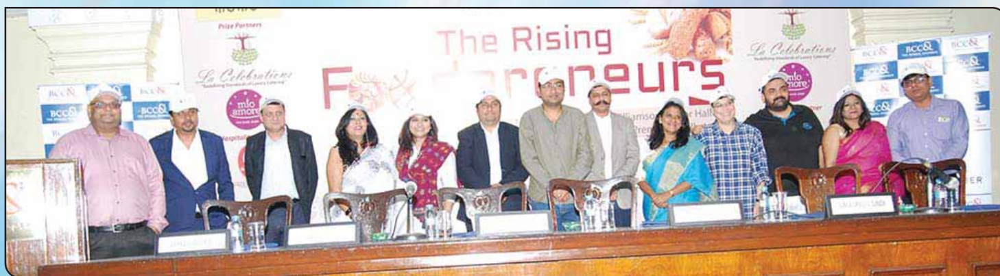
Photo Session of the Internal & External Juries of The Rising Foodpreneurs event