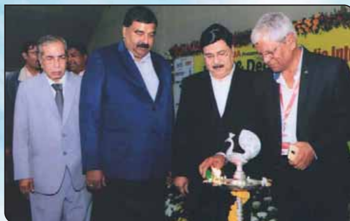
Inaugural Ceremony of IIMTF Bhubaneswar 2019

We had a total of more than 450 companies participating in the IIMTF in Bhubaneswar. During the eleven days of the fair, we had approx. 5,50,000 visitors gracing the India International Mega Trade Fair 2019, in Bhubaneswar.