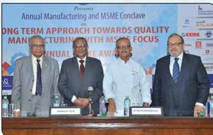
A group photo of the Inaugural Speakers