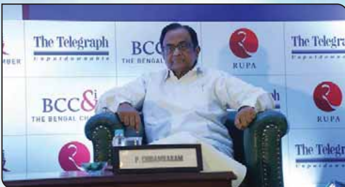
Shri P. Chidambaram seated at the dias