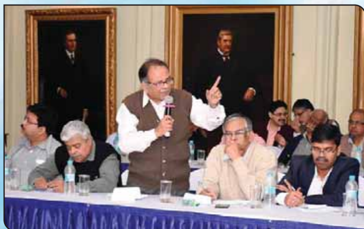
Interaction in progress