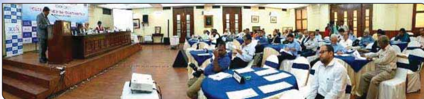
Section of the audience