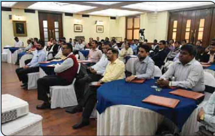
Q/A Session in progress