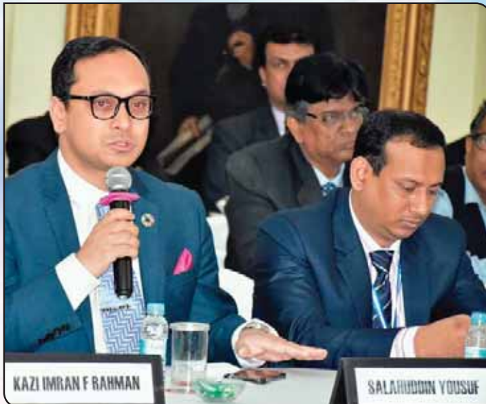
One of the delegate members of The Chittagong Chamber of Commerce and Industry addressing the gathering