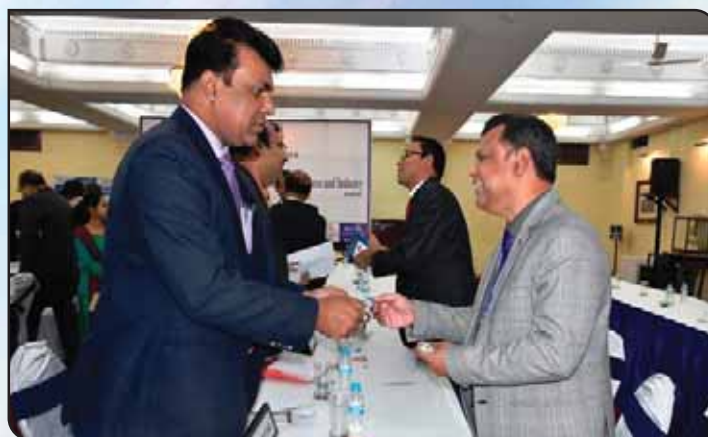
B2B meeting in progress