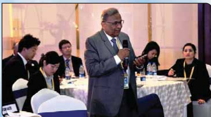
Interaction in progress