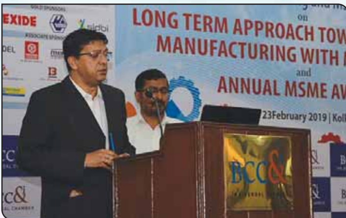
An applicant making a presentation under the Steel and Manufacturing Category for The Bengal Chamber MSME Excellence Awards 2019