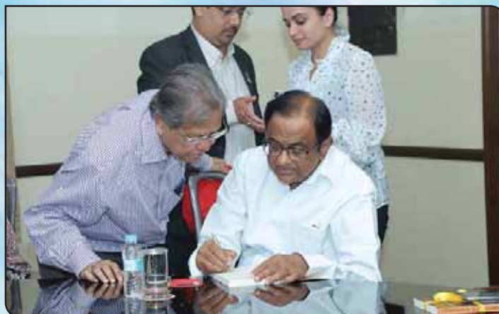
Shri P. Chidambaram signing copies of his book after the end of session