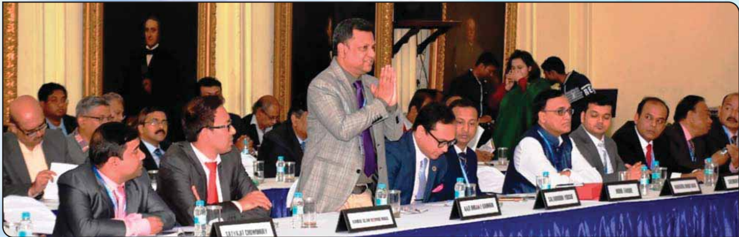
Introduction of the delegation of The Chittagong Chamber of Commerce and Industry

B2B MEETING WITH THE DELEGATION OF THE CHITTAGONG CHAMBER OF COMMERCE AND INDUSTRY