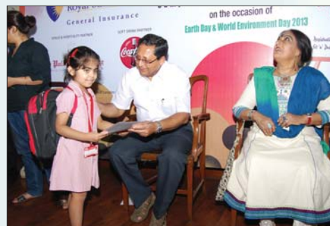
▲ Presenting a certificate of participation to a little one