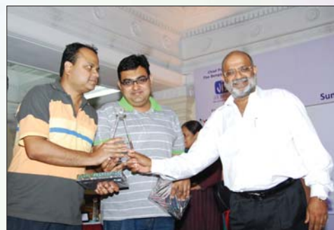
▲ Winner (CNMC Alumni Association)