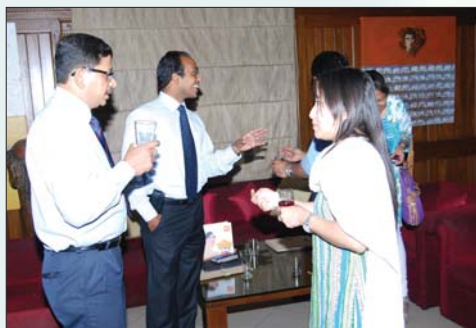
▲ The after-Quiz party at the Palladian Lounge