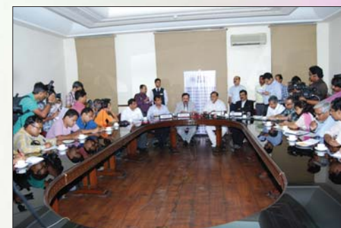
▲ Press Conference.