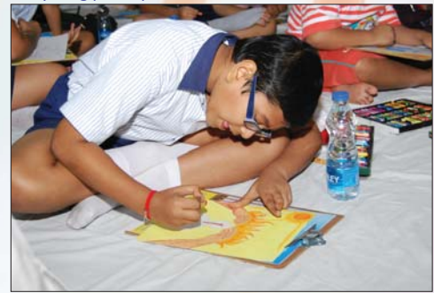
▲ A very committed participant