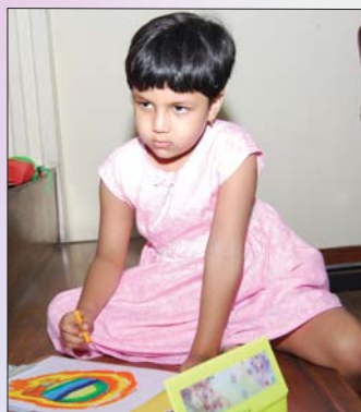
▲ In a very contemplative mood