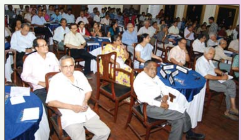
▲ A packed Williamson Magor Hall.