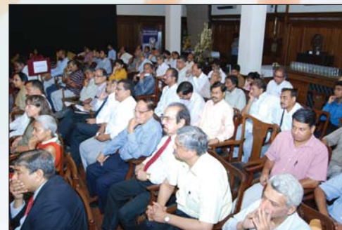
▲ a cross section of the Audience