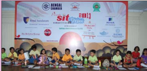
▲ The young participants

Like last two years, all the drawings would be reviewed by a special panel of judges and the winners (80 selected drawings) would be awarded special certificates at the Bengal Chamber's flagship Energy Sustainability Conclave on 30th and 31st August 2013 at the ITC Sonar. The schools (of the winners) would be informed accordingly.