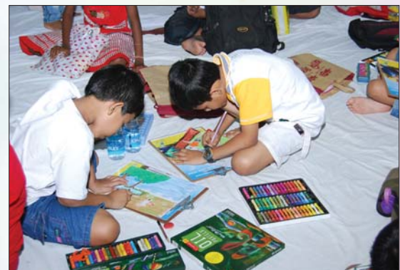
▲ In a rush to finish on time