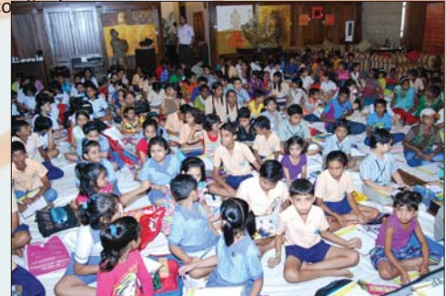
The Palladian Lounge, which was one of the two venues (the other one being the Williamson Magor Hall), with the young participants