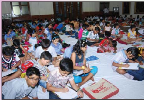
▲ Engrossed in their drawings