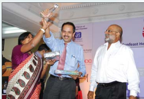
▲ 1st Runners UP (CMRI)