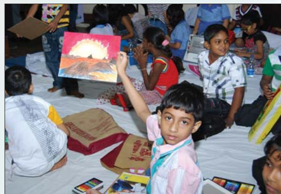
▲ Showing off! And a great one too