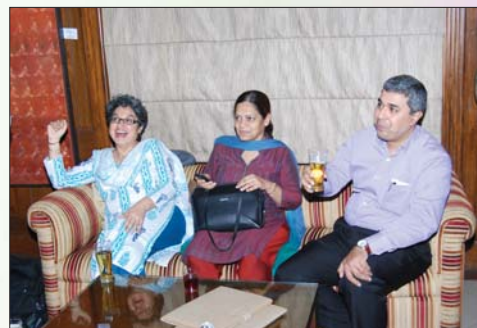
▲ The get-together at the Palladian Lounge