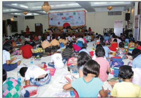
▲ The Sit n Draw in progress