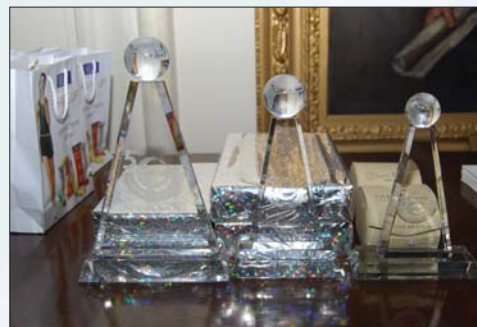
▲ The coveted prizes