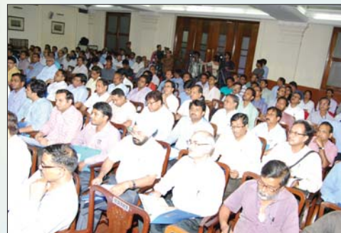
▲ The Williamson Magor Hall with 250 invitees.