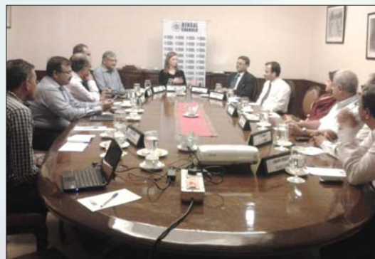
▲ Meeting in progress

The interactive session was attended by representatives from sectors like logistics, mining, steel and education. Skill development was a focus of the discussions. Improvement of waste management and cultural tourism were also highlighted.