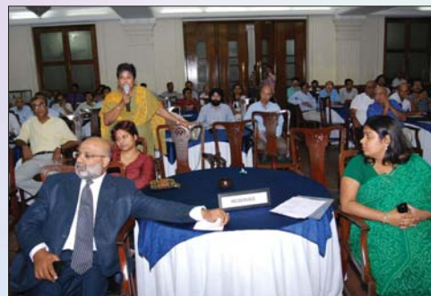
Q/A Session in progress