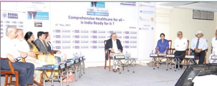
Panelists during the discussion