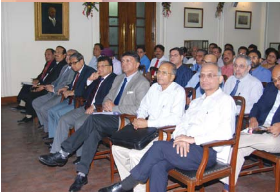
▲ Delegates present at the Shipping Workshop on Look East Policy – Wake up Call for Ports and Logistics.

The workshop was attended by a large number of delegates from the industry, port users, representatives of trade, and other delegates and altogether the total number of participants for the workshop was 106. The workshop helped us to identify and highlight to the Government of India the issues that need ‘priority clearances for development of Port Infrastructure and its connectivity with the hinterland’. Highlighting the shortcomings and challenges was a firm step towards the deliverables of India’s Look East Policy.