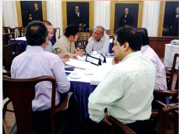
◀ B2B Meeting in progress.