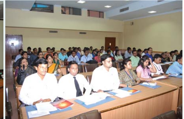
Students, teachers, professionals as part of the audience for the Summit.