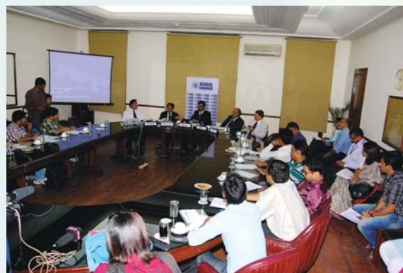
▲ Press Conference in progress.