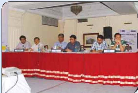
▲ Finalists during final round