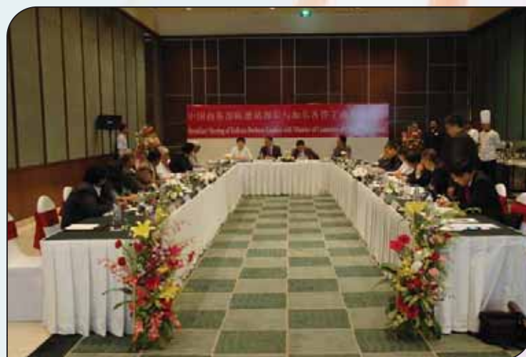
▲ Meeting in progress.