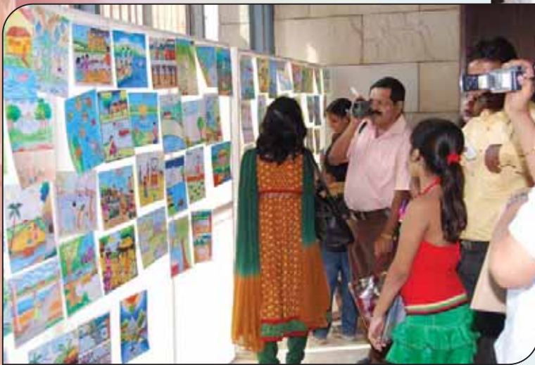
◀ Selected drawings from The Bengal Chamber Sit n Draw held on the occasion of World Environment Day exhibited at the venue.

LUNCHEON MEETING WITH H.E. MR. JOSE PACHECO, MINISTER OF AGRICULTURE, REPUBLIC OF MOZAMBIQUE.