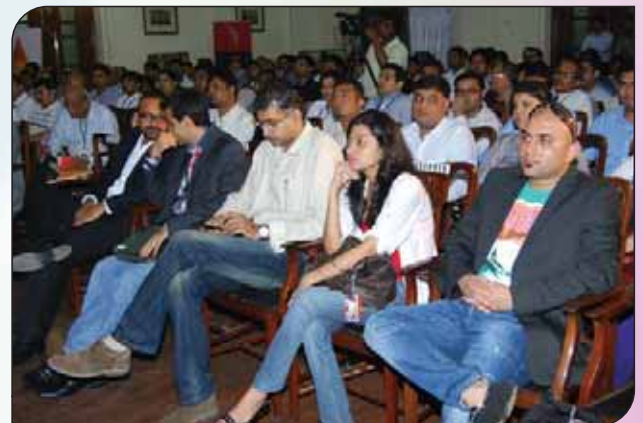
▲ The audience