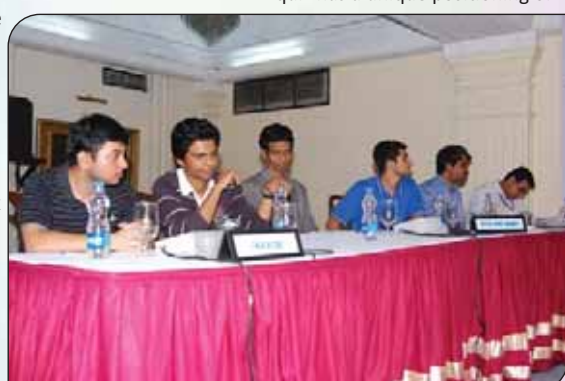
▲ Finalists during the final round