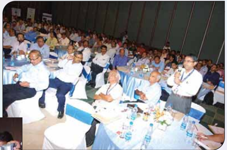
Packed Hall on Day 2 (1st September 2012) ▶

31ST AUGUST – 1ST SEPTEMBER 2012, ITC SONAR, KOLKATA