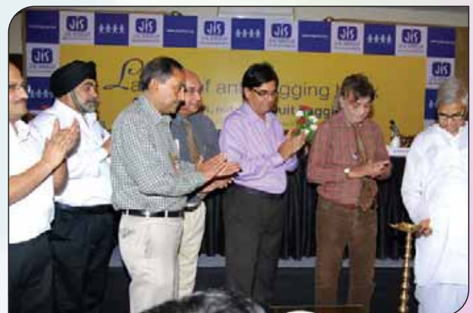
▲ Lighting the ceremonial lamp