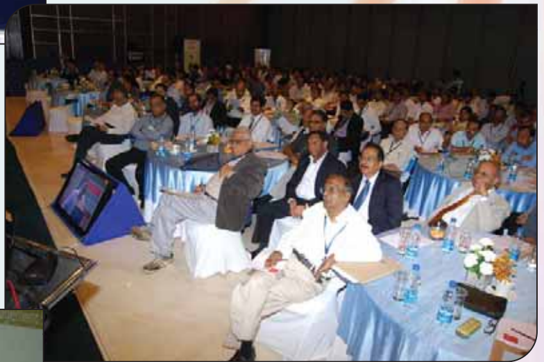
Packed Hall on Day 1 (31st August 2012) ▶