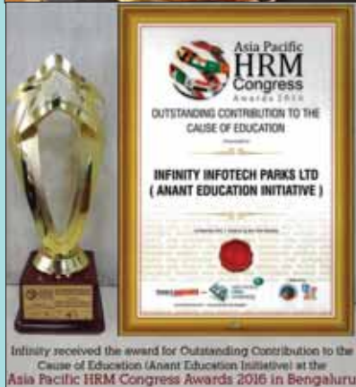
Infinity received the award for Outstanding Contribution to the Cause of Education (Anant Education Initiative) at the Asia Pacific HRM Congress Awards 2016 in Bengaluru.

The Akshaya Patra Foundation has received the 1st Dr. A.P.J. Abdul Kalam Memorial Award for Innovation in Governance.