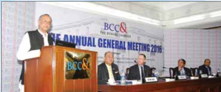
Address by the Chief Guest, Dr. Amit Mitra, Hon'ble Minister-in-Charge, Department of Commerce & Industries, Finance & Excise, Industrial Reconstruction and Public Enterprises, Government of West Bengal