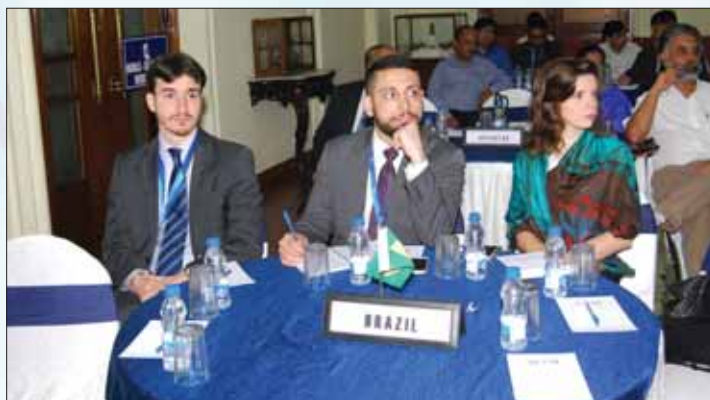
The visiting Diplomats