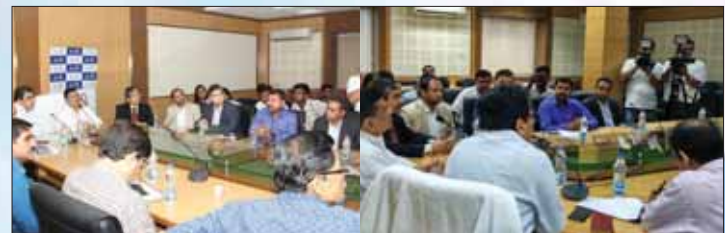
Press Conference in progress