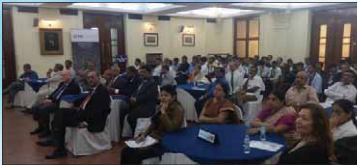
Delegates present in the programme