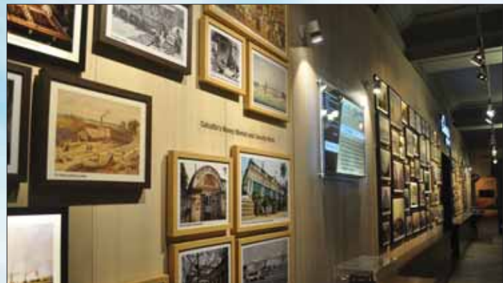
The Calcutta Gallery – An exhibition on Calcutta's business and industrial heritage.