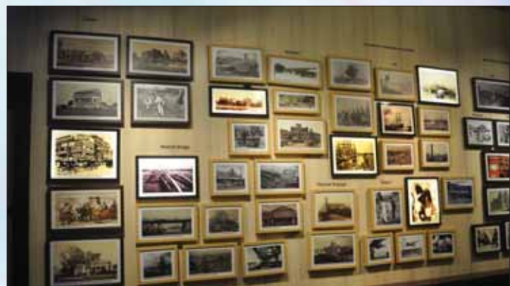
A collection of photographs portraying the journey of transformation of three villages by the Hooghly into a colossal metropolis called Calcutta now Kolkata.