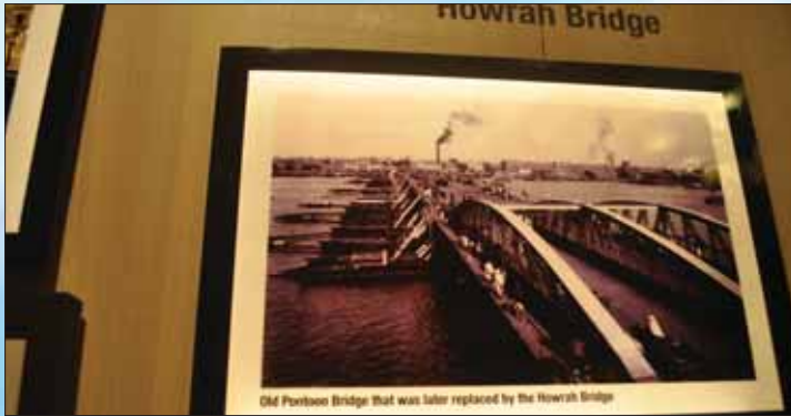
A photograph of Pontoon Bridge which was later replaced by the Howrah Bridge.