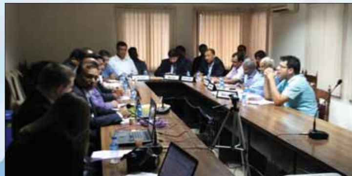
Interactive Session in Progress