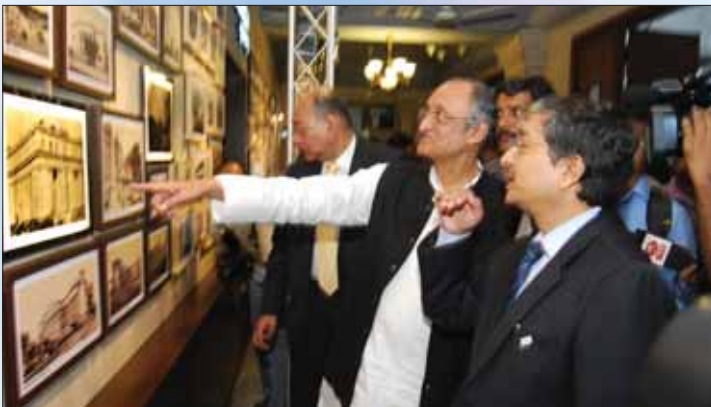
The Bengal Chamber heritage building's photograph in the panel catches eyes.

On the occasion of The Bengal Chamber's AGM on 14th September 2016, The Bengal Chamber's very own Calcutta Gallery was inaugurated by Dr. Amit Mitra, Hon'ble Minister-in-Charge, Commerce & Industries, Finance & Excise, Industrial Reconstruction & Public Enterprises, Government of West Bengal. The Calcutta Gallery, dedicated to our Eternal City, is a pictorial journey down the hallowed pathways of the industrial and business history of Kolkata. The transformation of three villages by the Hooghly into a colossal metropolis is fascinating, awe inspiring and magical. The Gallery is a first-of-its-kind initiative, which portrays the 325 years of progress of Calcutta as a leading city of the world through a collection of rare photographs of the iconic City. It is permanently housed in the Chamber premises.