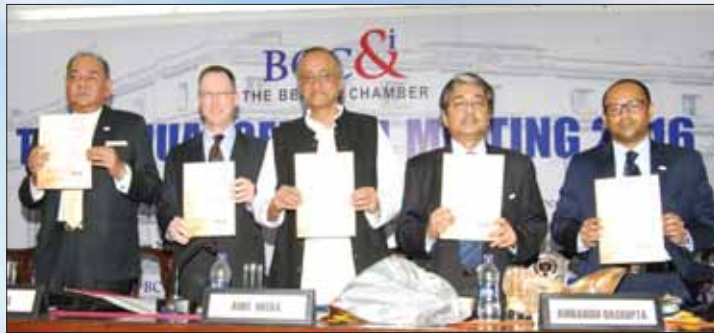
Extraordinary Personalities from Bengal- A Tribute by The Bengal Chamber'- A special publication by The Bengal Chamber, launched on the occasion of the Chamber's AGM

The Bengal Chamber's special publication portrays the lives and works of twelve national Heroes from Bengal – Raja Ram Mohan Roy, Ishwar Chandra Vidyasagar, Bankim Chandra Chattopadhyay, Jagadish Chandra Bose, Rabindranath Tagore, Prafulla Chandra Ray, Swami Vivekananda, Chittaranjan Das, Meghnad Saha, Satyendra Nath Bose, Subhas Chandra Bose and Kazi Nazrul Islam