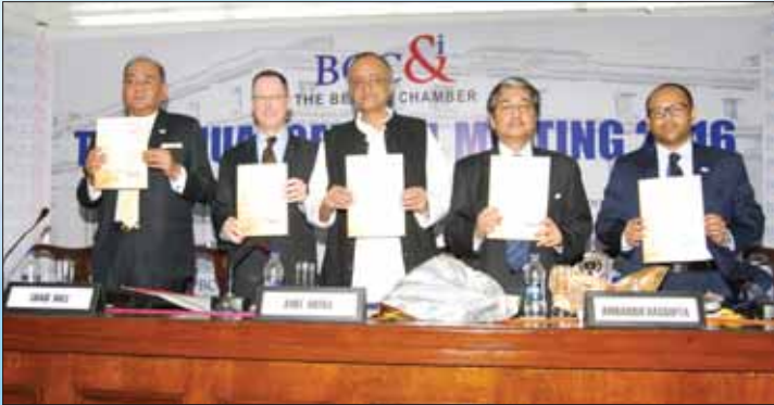
Release of the Special Publication – “Extraordinary Personalities from Bengal: A Tribute by the Bengal Chamber