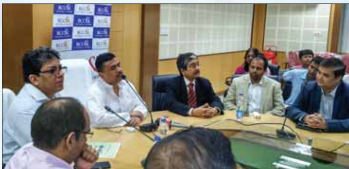
Shri Suwendu Adhikari, Hon’ble Minister- in-Charge, Department of Transport, Government of West Bengal addressing the media