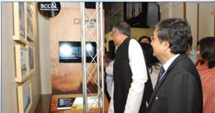
The Calcutta Gallery has an audio visual kiosk with narration of our City's 325 years of business history.