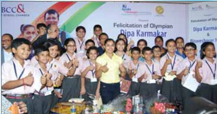
School children enjoying a special moment with Olympian Dipa Karmakar