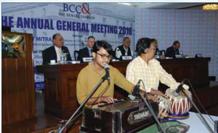
Commencement of AGM with ‘Akash Bhara Shurjo Tara