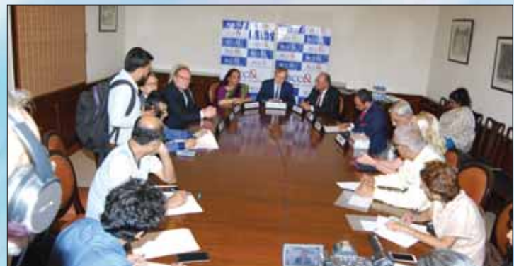
Press Conference in progress