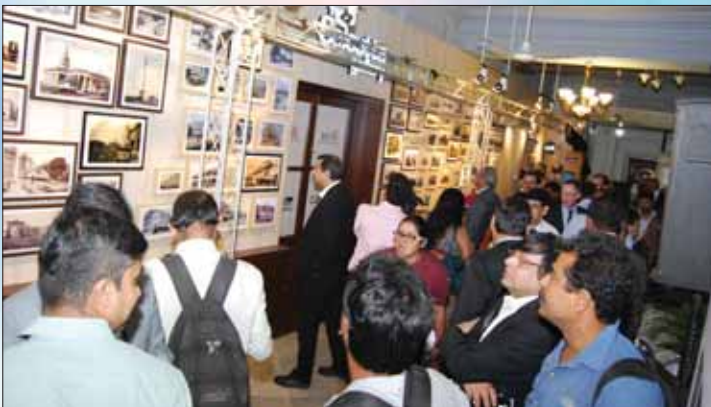
The Calcutta Gallery- dedicated to our Eternal City is a pictorial journey down the hallowed pathways of the industrial and business history of Calcutta.