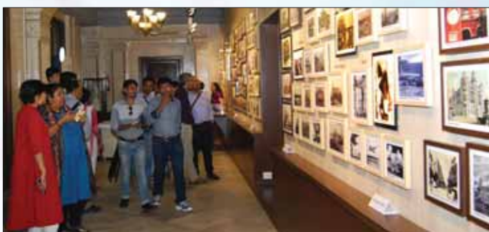
Walk-through of the Calcutta Gallery