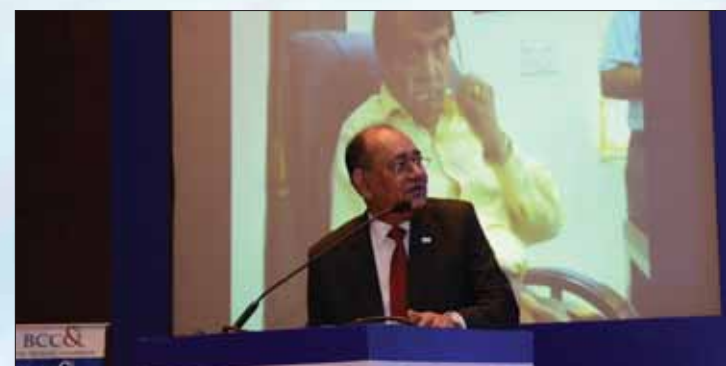
Shri Suresh Prabhakar Prabhu , Hon'ble Minister, Ministry of Railways, Government of India is interacting with the President and other Guest Speakers at the Inaugural Session via Video Conferencing