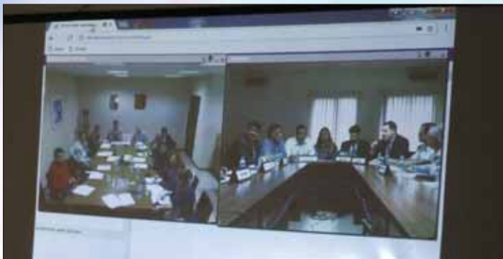
B2B interaction between India and Russia via video conferencing

The Russian representatives also invited the delegates and also the BCC&I IT Fraternity to pay a visit to Voronezh sometime soon to explore more on mutually beneficial collaborative arrangements.