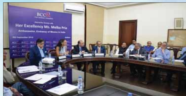
Interaction in progress