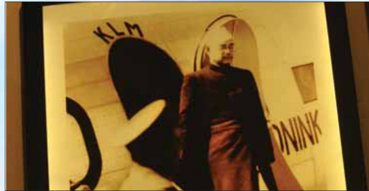
A rare photograph of Netaji Subhas Chandra Bose.