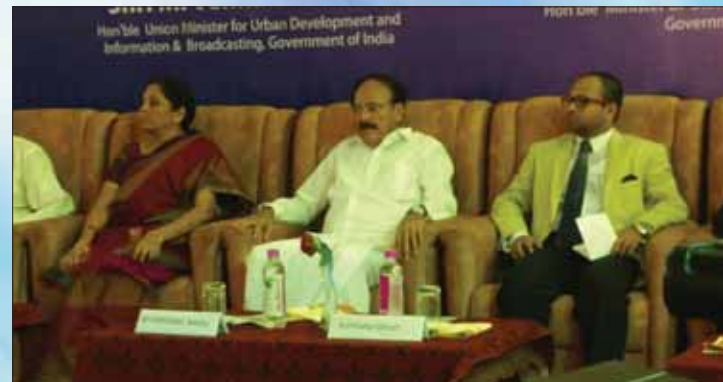
The Inaugural Panel- from L-R: Smt. Nirmala Sitharaman, Hon'ble Minister of State for Commerce & Industry, Government of India; Shri Venkaiah Naidu, Hon'ble Union Minister For Urban Development and Information & Broadcasting, Government of India; Mr. Subhodip Ghosh, Director General, BCC&I

Notable to mention was the immense presence of the Electronics industry in this Fair. With more than 2 pavilions, this industry was very well represented at the Fair. Many of the Electronics brands participated through Sowndarya, which is a leading Electronics Showroom in AP.