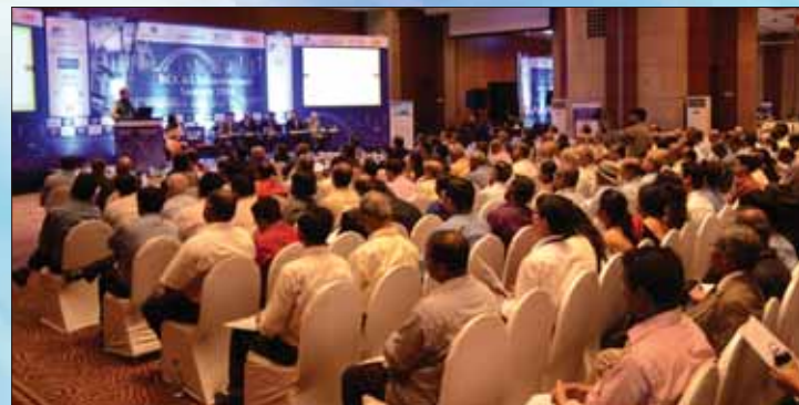
August audience at the BCC&I Infrastructure Summit