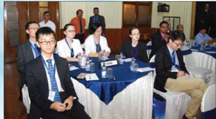
The visiting Diplomats