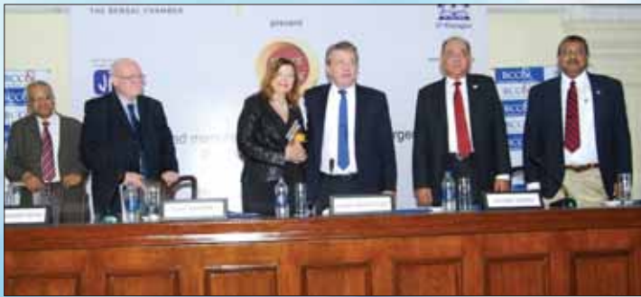
A Group photo of the speakers