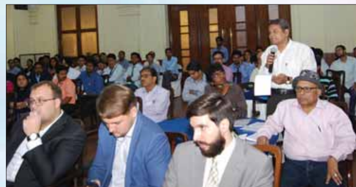
Question from audience.