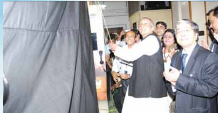
Dr. Amit Mitra, Hon'ble Minister-in-Charge, Finance and Excise, Commerce and Industries, Industrial Reconstruction and Public Enterprises, Government of West Bengal, inaugurating the Gallery.