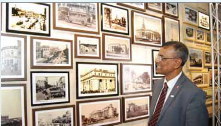
Mr. Chandra Shekhar Ghosh, President Designate, BCC&I, renowned banker and the MD & CEO, Bandhan Bank looking at the history of the City, which gave birth to the Indian banking system.