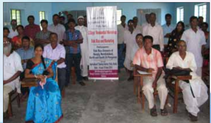
Audience of the programme