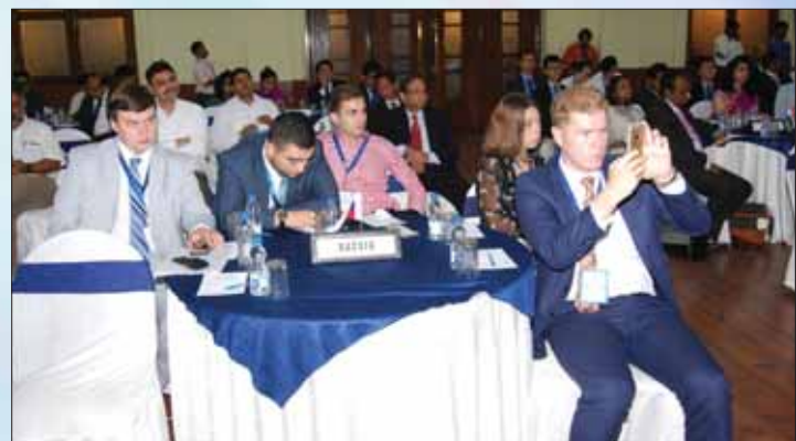
The visiting Diplomats