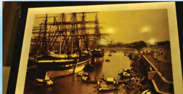
An old picture of Calcutta Port from the Gallery.