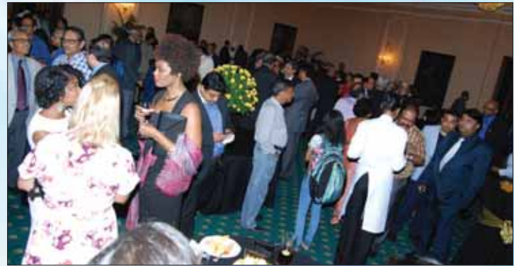
People enjoying the Annual Reception