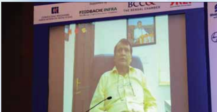
Shri Suresh Prabhakar Prabhu , Hon'ble Minister, Ministry of Railways, Govt. of India is delivering the Inaugural Address at the Inaugural Session via Video Conferencing