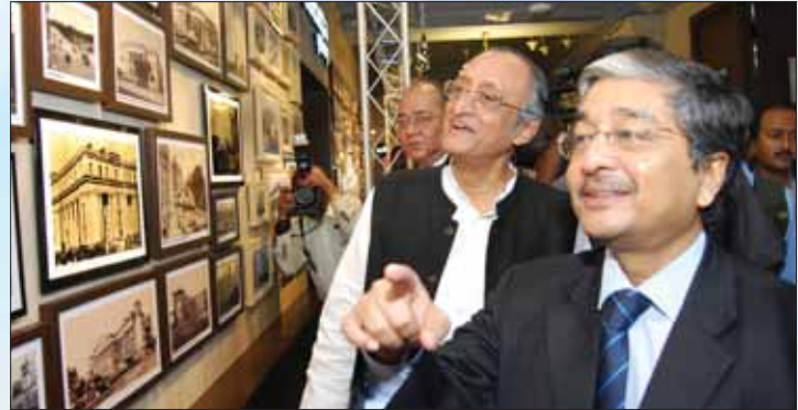
Inauguration of the The Calcutta Gallery