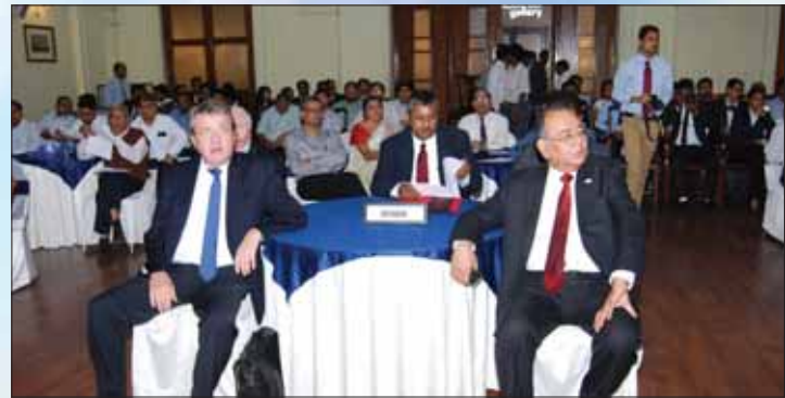
Delegates present in the programme