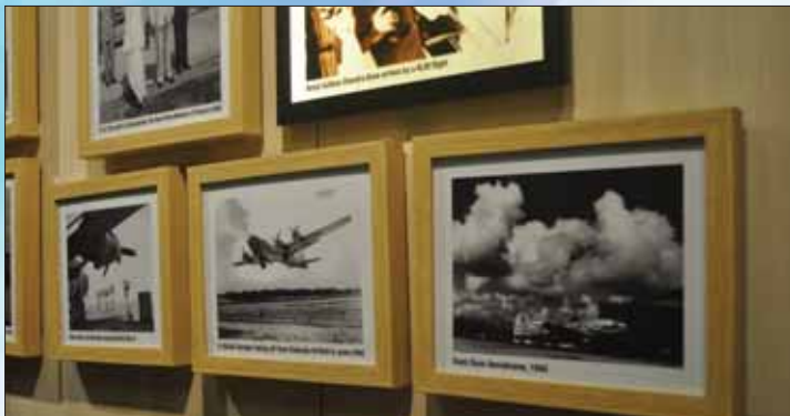
Dum Dum airport during World War II.