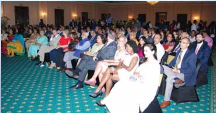
A section of the guests.