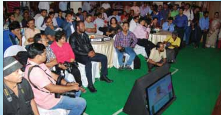
A part of the audience