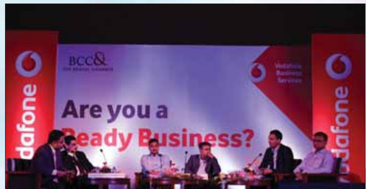
The Panel Discussion