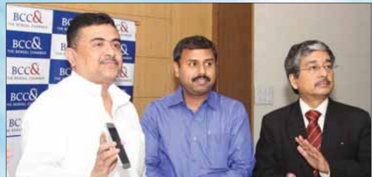
Shri Suwendu Adhikari addressing the media and officially launching the App