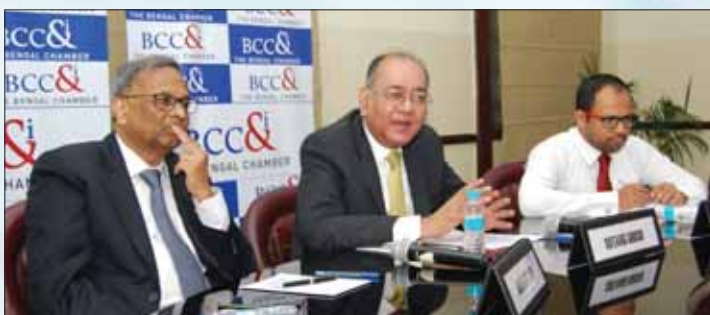
Press Conference in progress