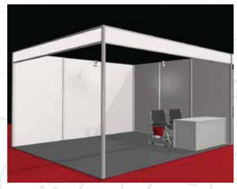
Standard booth (3mx3m)