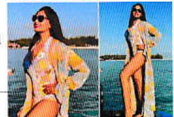
Bipasha Basu Breaks The Internet With Swimsuit Photoshoot, See Her Best Bikini Looks