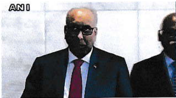
Former RBI Deputy Governor S S Mundra.

A more effective result can be produced if a public sector character is retained and operational freedom and ownership are separated, he said.