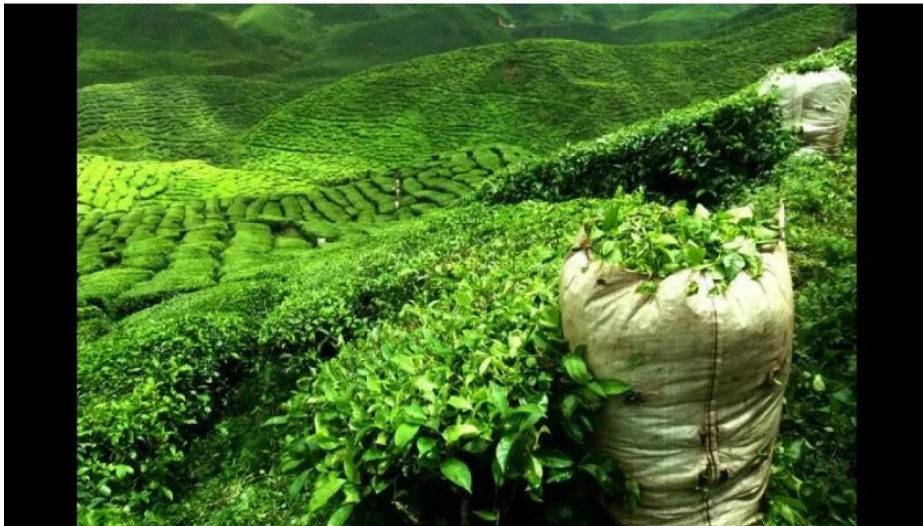
Tea industry facing multiple challenges in wake of Covid pandemic