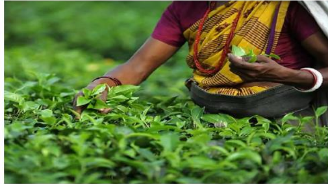
दार्जिलिंग चाय उद्योग 'आइसीयू में भर्ती मरीज' की तरह है, अंशुमन कनोरिया। फाइल फोटो।