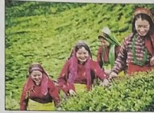
TROUBLE IN PARADISE