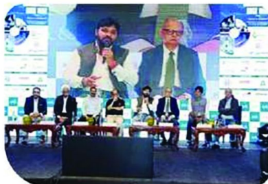
Shri Babul Supriyo , Hon'ble Minister-in-Charge, Information Technology and Electronics Department, Government of West Bengal gracing the Opening Session with other Dignitaries.