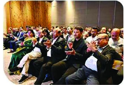
The VCs and Angel Investors from Kolkata, Bengaluru and Mumbai.