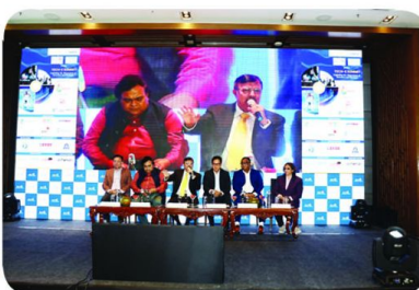
Session on Tech Entrepreneurs: Stories of Home-Grown Entrepreneurship Ventures with International Footprints