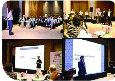
Showcase Session for Bengal based Startups.