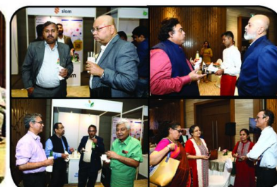
Vibrant Networking Evening.