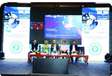
Special Session with IDEAS- Technology Innovation Hub by Indian Statistical Institute (ISI) on Lab to Market- Technology Research and Opportunities for Start Up