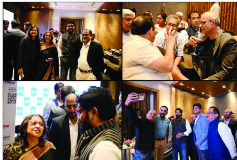
VIBRANT NETWORKING IN PROGRESS.